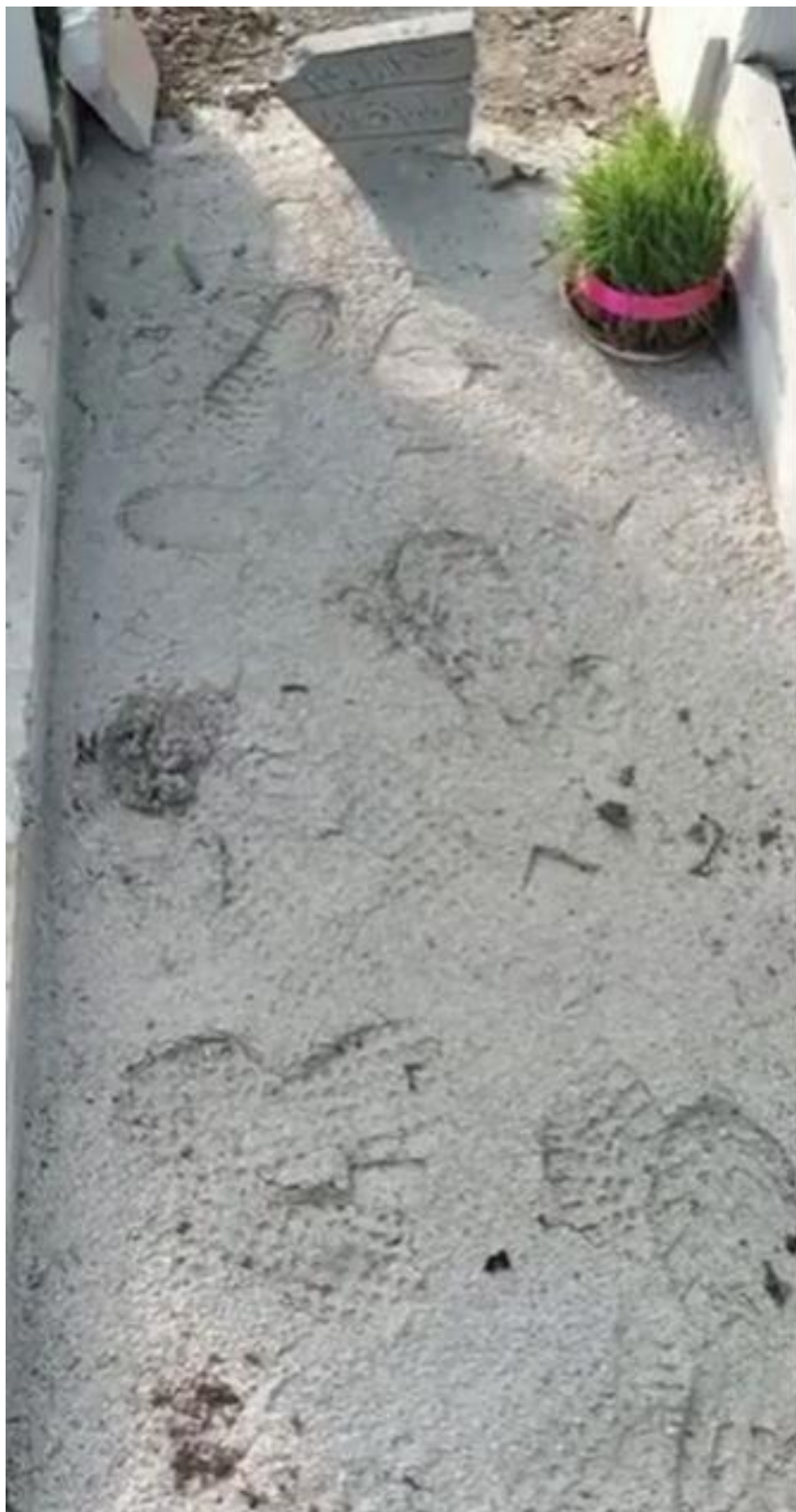
Arian Khoshgavar's grave. The picture shows his grave after it was vandalised with the cement containing multiple shoe prints