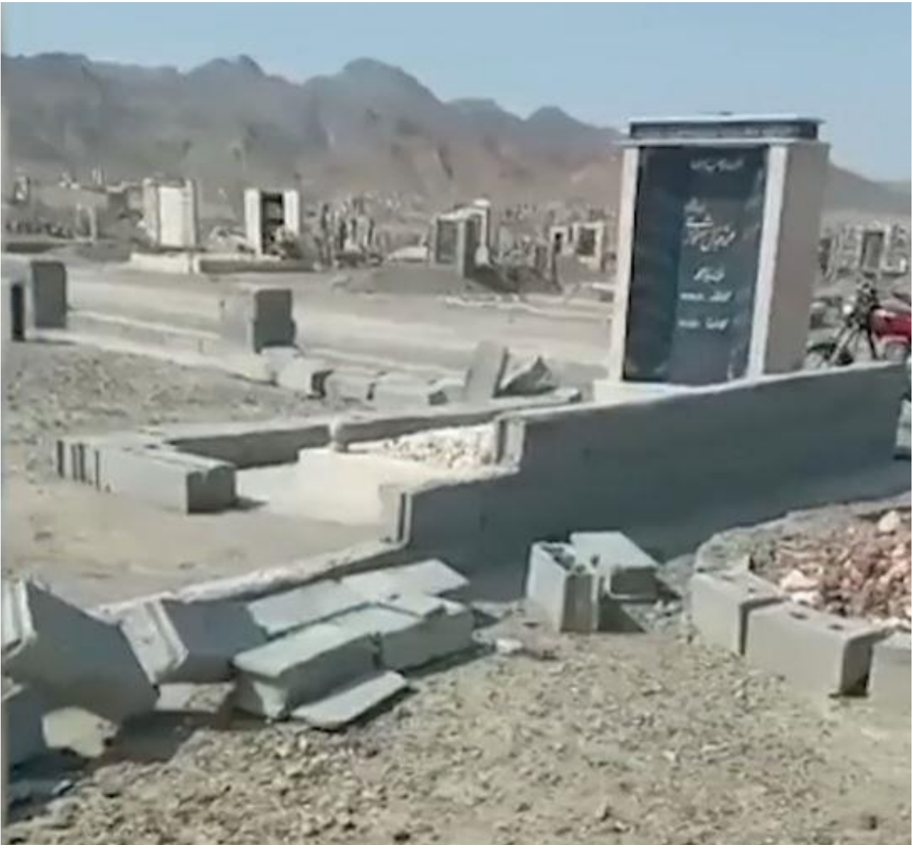
The grave of Mohammad Eghbal Shahnavaзи (Nayebzehi). The picture shows his gravesite after it was vandalised, with some of the bricks forming the raised concrete structure around his grave broken.