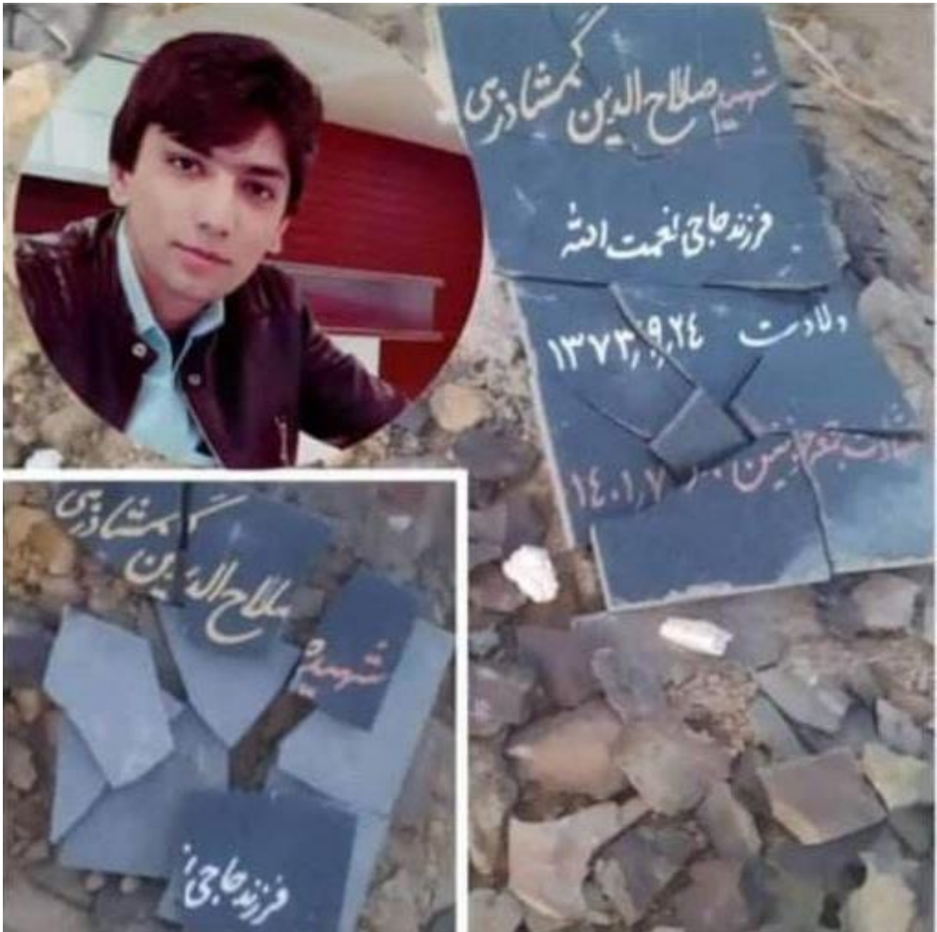
Salaheddin Gamshadzehi's grave. The picture shows his gravestone smashed into pieces.