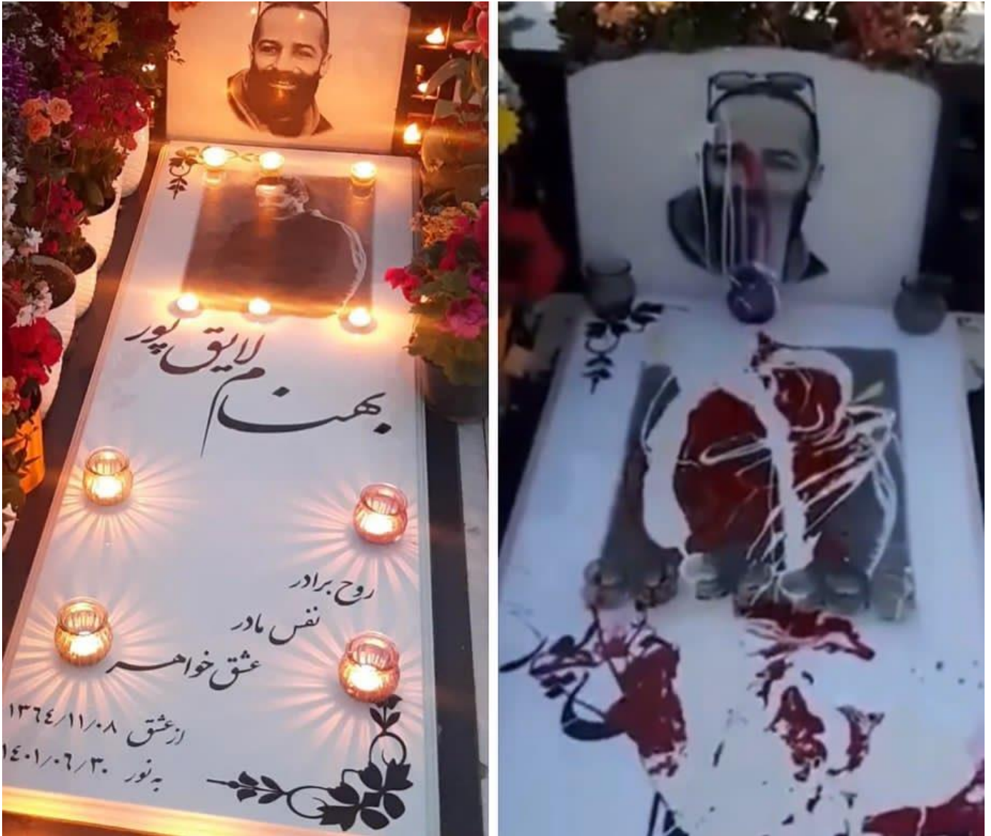
Behnam Layeghpour's grave. The picture on the left shows his gravestone before it was vandalised. The picture on the right shows his gravestone after it had paint thrown.