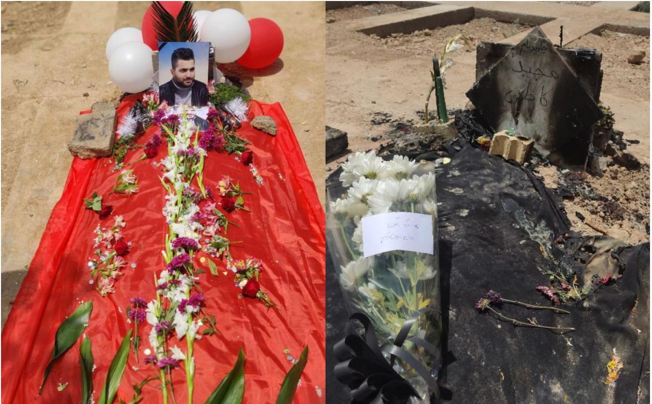
Majid Kazemi's grave. The picture on the left shows Majid Kazemi's grave draped in red cloth, before it was vandalised. The picture on the right shows his grave on 8 June 2023, after it was set on fire overnight, with the cloth destroyed.