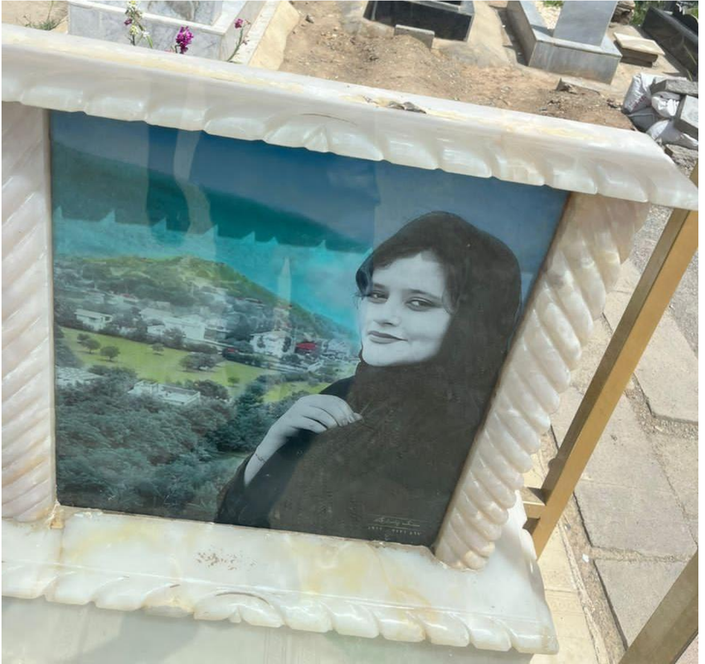
A picture of Mahsa/Zhina Amini's grave after it was vandalised for the second time, on 23 May 2023, this time with the crown on the headstone broken off and removed.