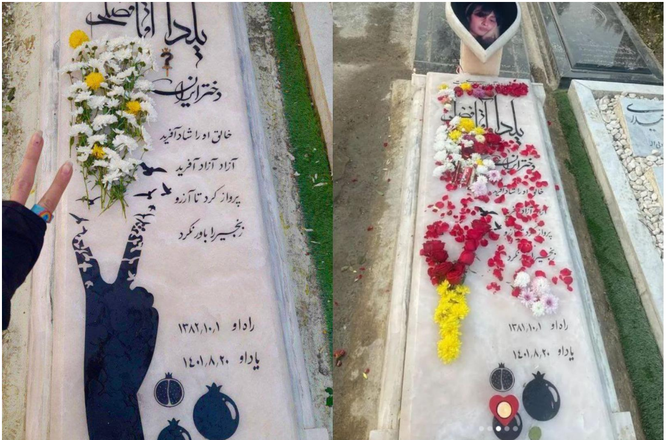
Yalda Aghafazli's grave. The picture on the left shows her gravestone including the artwork depicting the victory sign with two raised fingers that transform into numerous flying doves, before it was vandalised. The picture on the right shows her grave after the artwork was erased.