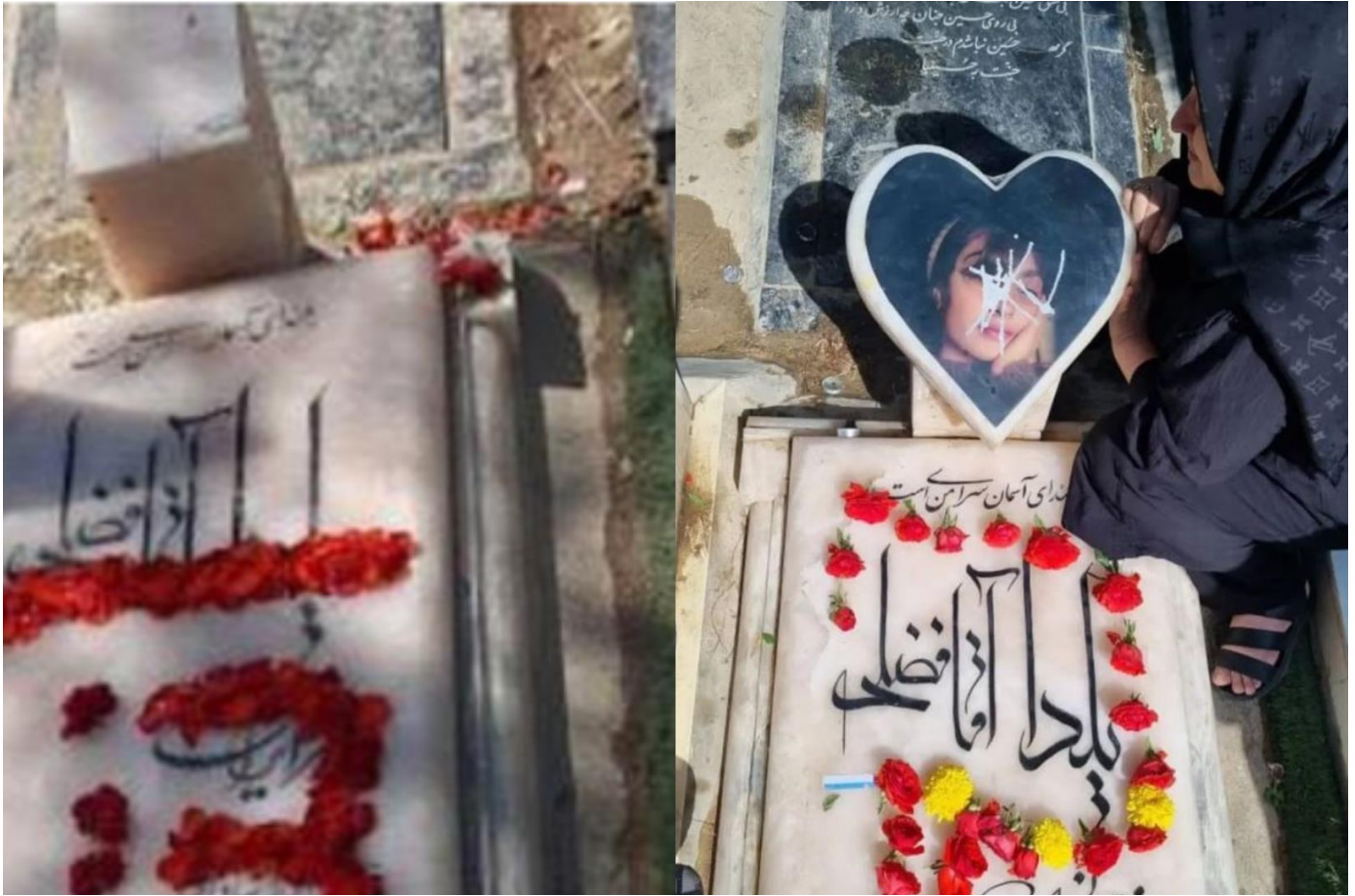
Yalda Aghafazli's gravesite. The picture on the left is from April 2023, when the heart-shaped part of her headstone containing a picture of her face was removed. The picture shows the pillar that remained afterwards. The family reinstalled a heart-shaped headstone several days later. The picture on the right is from August 2023 when lines were scratched onto her face on her headstone.