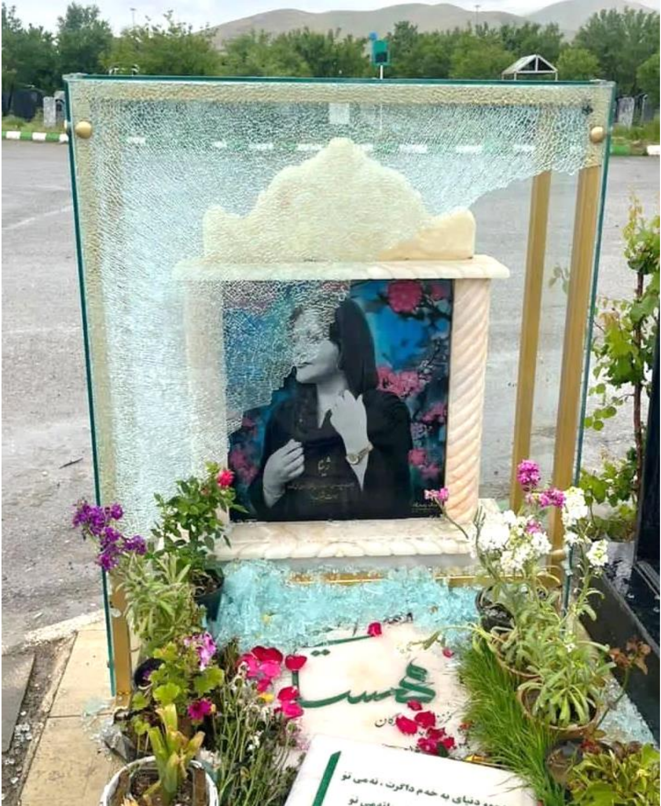
A picture of the vandalised grave of Mahsa/Zhina Amini, taken on 21 May 2023, with the glass encasing the headstone broken.