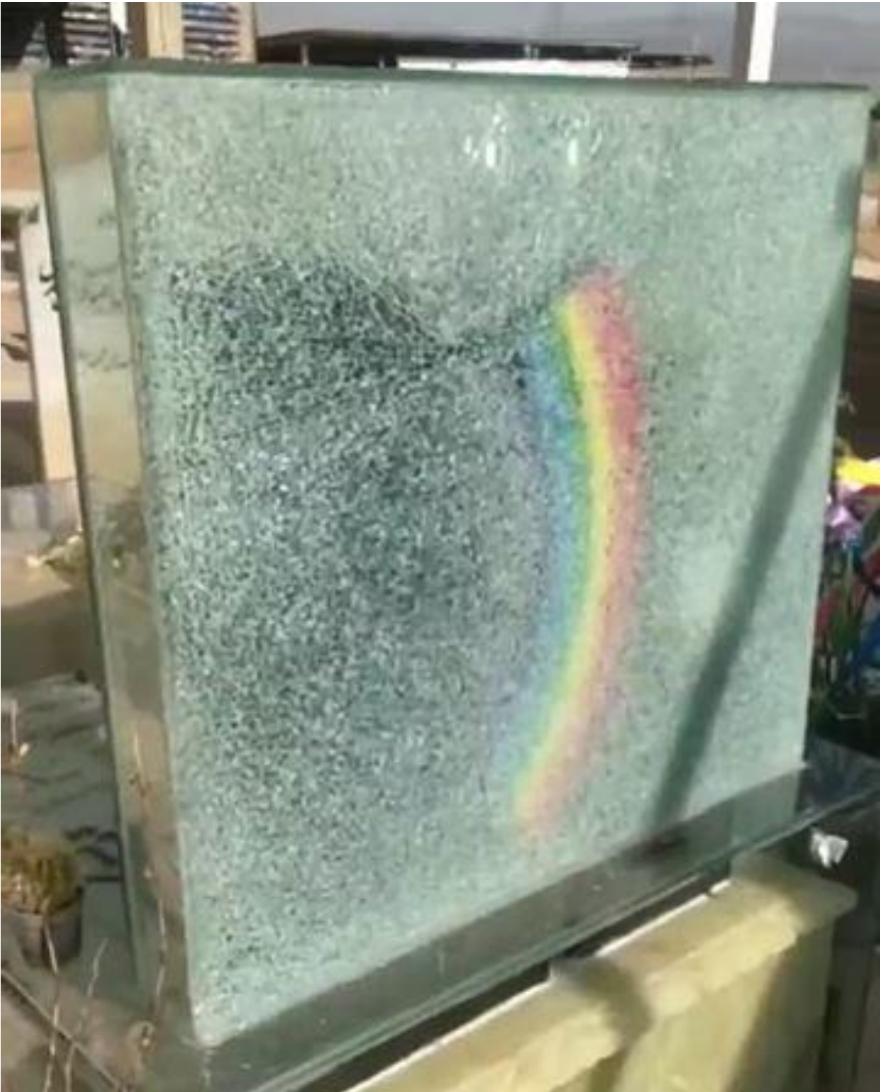
Kian Pirfalak's vandalised grave. The picture is a still from a video taken of his grave which showed that the glass encasing his headstone had been smashed.