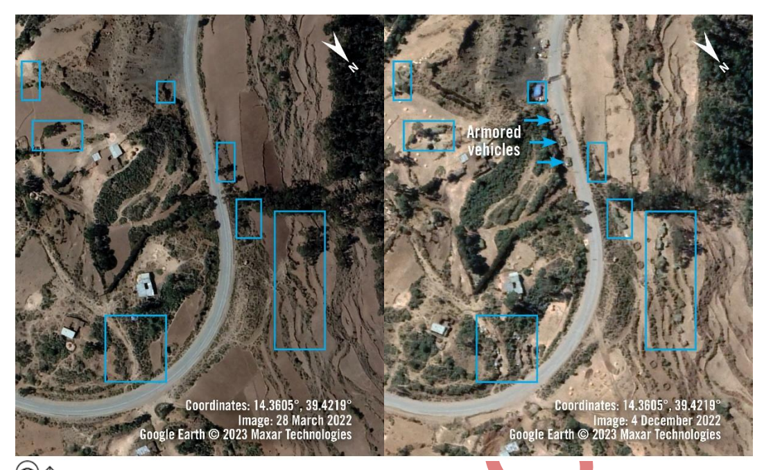
★ Kokob Tsibah District: Satellite imagery shows many new structures - highlighted with blue boxes - have appeared between 28 March 2022 and 4 December 2022. Armored vehicles are visible along the main road.