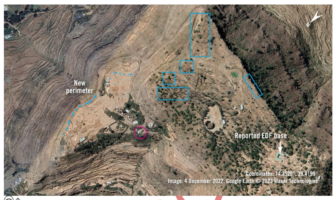
Schedule 2022 close to the reported EDF military base. New perimeters are also visible. One damaged structure is visible - have appeared between 28 March 2022 and 4 December 2022 close to the reported EDF military base. New perimeters are also visible. One damaged structure is visible - highlighted with a red circle.

an interview with a social worker, the women were targeted on suspicion of having relatives or partners in the Tigrayan forces.<sup>51</sup>