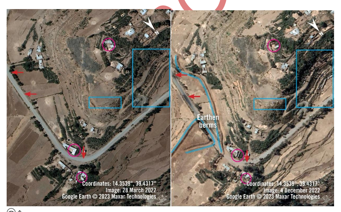
(☉) ↑ Kokob Tsibah District: Satellite imagery shows that many new structures - highlighted with blue boxes - have appeared between 28 March 2022 and 4 December 2022. New machine-built earthen berms are also visible. Red arrows show burn scars on the road from destroyed vehicles and red circles highlight three structures that appear damaged or destroyed. The vehicles were destroyed between 2-3 November 2022, according to satellite imagery (not shown).

EXTRAJUDICIAL EXECUTIONS IN KOBOB TSIBAH DISTRICT