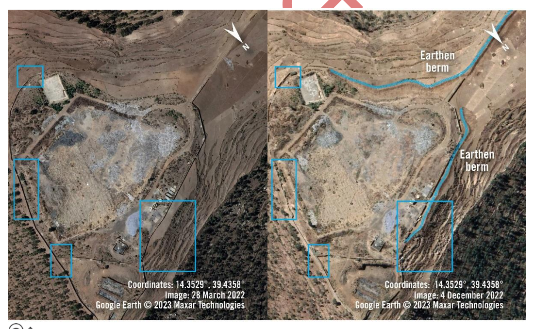
Satellite imagery shows that many new structures - highlighted with blue boxes - have appeared between 28 March 2022 and 4 December 2022. New machine- built earthen berms are also visible. Red arrows show burn scars on the road from destroyed vehicles and red circles highlight three structures that appear damaged or destroyed. The vehicles were destroyed between 2-3 November 2022, according to satellite imagery (not shown).

This was not the first time that Kokob Tsibah fell under the EDF's control. Previously, it had been held by the EDF for seven months from 21 November 2020 to 28 June 2021, according to a social worker. During this time, nearby towns had also been under EDF's control, and the social worker said that made it extremely difficult for survivors to get medical support at the nearest available heath centers.<sup>37</sup> The social worker told Amnesty International that, during this earlier period, around 120 women had reported to their organization that they had been subjected to sexual violence by members of the EDF.