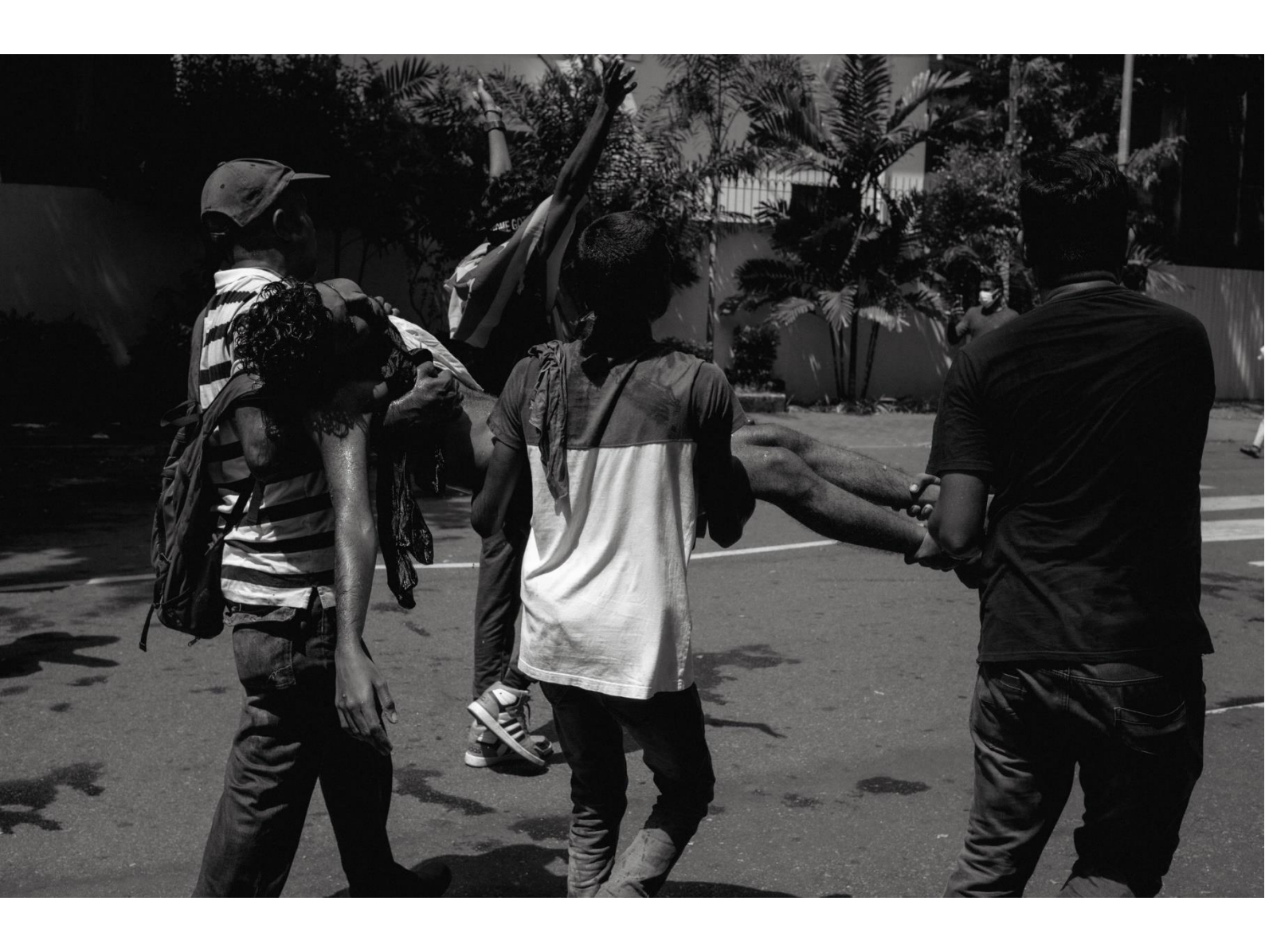
♠↑ An unconscious protester is carried away to an ambulance following clashes with armed forces outside the Prime Minister's office on Flower Road, in Colombo on 13 July 2022.