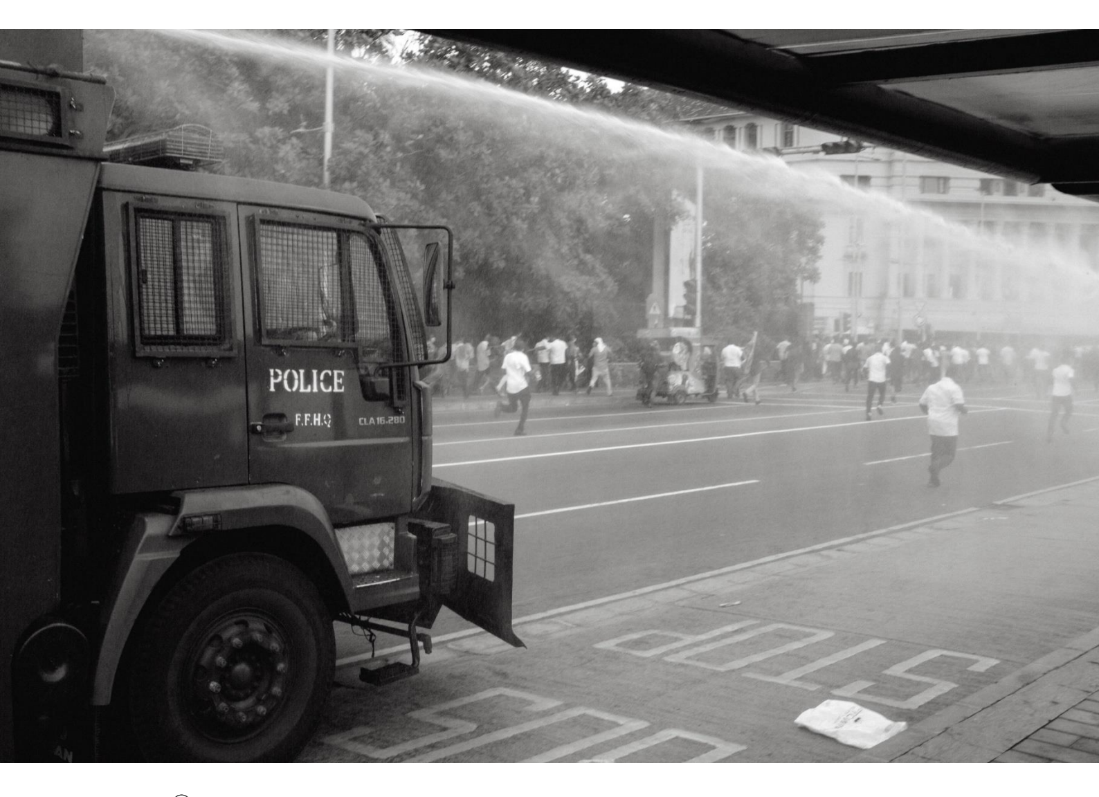
⊕ ↑ Security forces fire water cannons at protesters on Galle Road, in Colombo, on 9 May 2022.