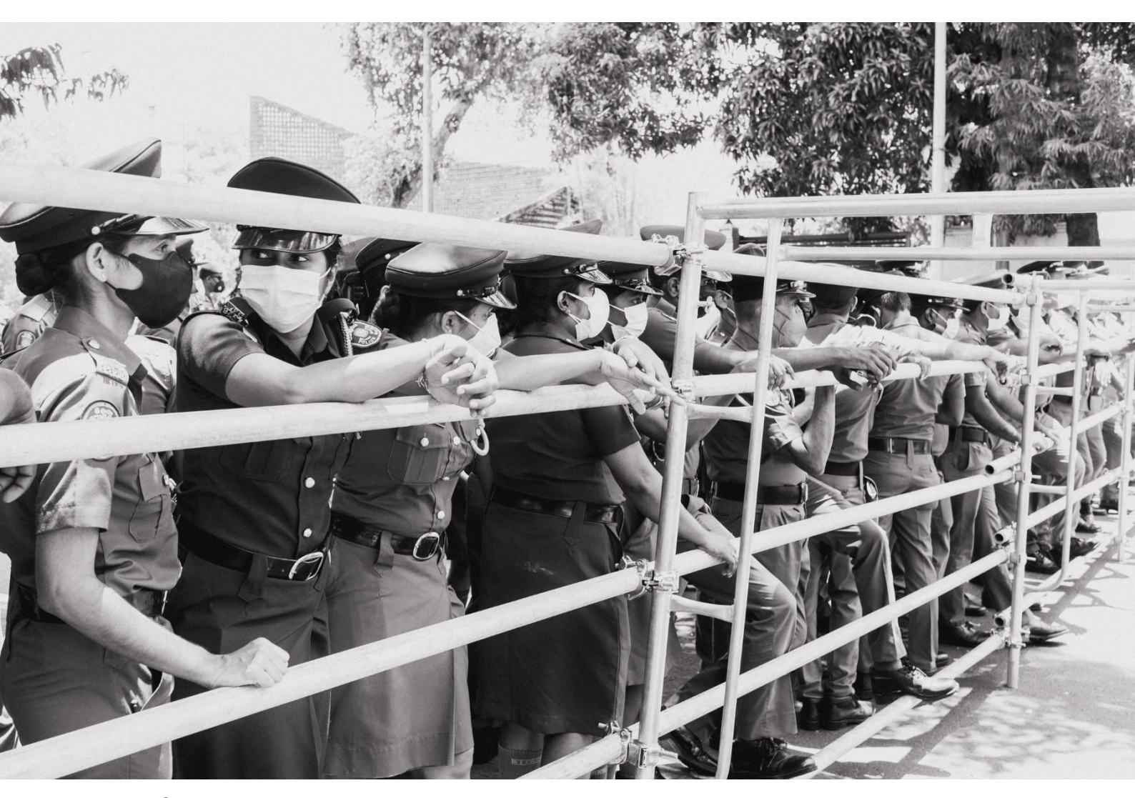
⊕↑Police reinforce a steel barricade preventing protesters from accessing Independence Square to protest at Independence Avenue in Colombo, on 03 April 2022.