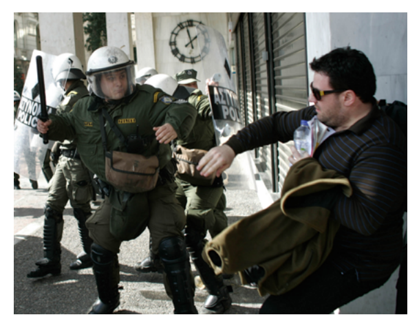
A police officer in riot gear raises his baton during a general strike in Athens, Greece.

As for any other use of force, the principle of necessity requires law enforcement officials first to attempt non-violent means. Therefore, they must warn that they will use their baton if their order to stop engaging in violent behaviour is not complied with, and allow sufficient time for the person to obey the order. This requirement is inherent to the principle of necessity and the duty to minimise harm. If a person might already stop violent actions due to a warning, then there is no need to resort to the actual use.<sup>14</sup> Thus, to minimise harm, a person must be allowed to stop any harmful behaviour before using a baton can be justified. Only if the warning would put the law enforcement official or any other person at risk or would be clearly pointless, can it be accepted to immediately resort to the weapon without warning.