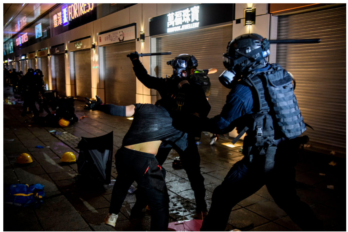
Man appears to be subjected to overhead strikes while being arrested by two police in Hong Kong

• This requires that strikes should come from the side. Overhead strikes are inherently dangerous since they may easily end up hitting the head or shoulder bones and lead to more serious and unwarranted injuries.<sup>16</sup>