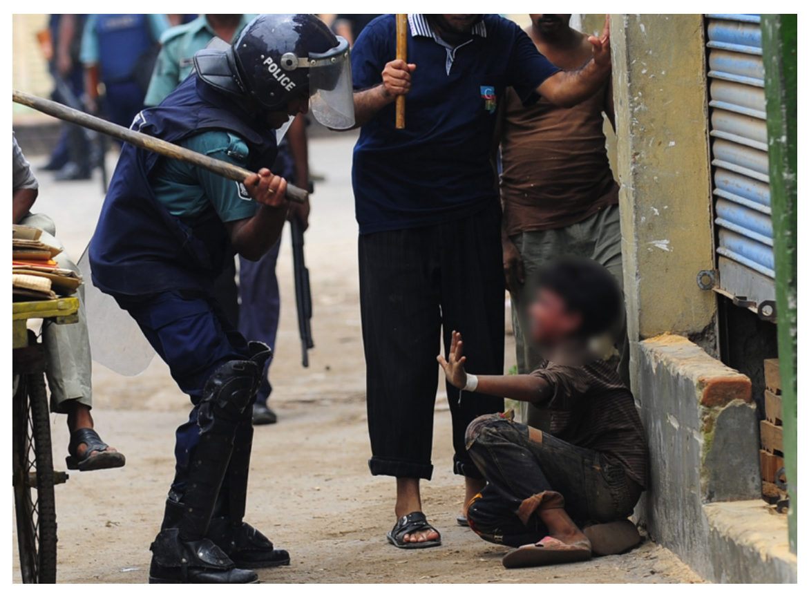
A Bangladeshi policeman is about to hit a child with a baton.

More serious injury can also occur when the person is of a rather slim body shape; for example children or older persons will have less muscle mass so that the strikes can more easily lead to a bone injury. In particular, older people are at heightened risk of bone fractures.