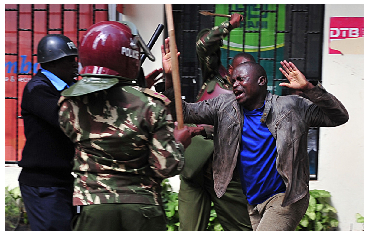
Kenyan riot police officers threaten to beat an opposition supporter with batons.

Note: In the course of public assemblies, one can frequently observe law enforcement officials hitting at the hand of protesters with a baton to make them drop a banner or other sign of protest they are carrying. This is clearly unjustified, excessive use of force. The carrying of a banner is not a violent act and does not present a risk to another person. Batons strikes that may lead to considerable bone or joint injury is neither necessary nor proportionate.