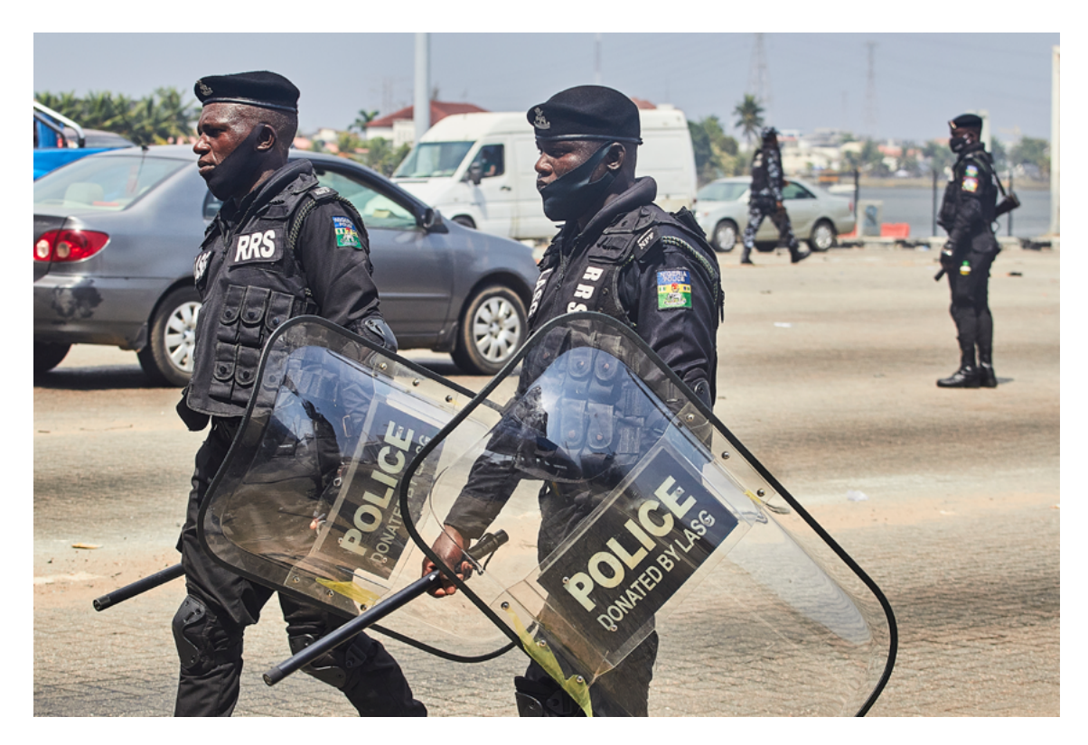
Policemen in riot gear during a demonstration in Lagos, Nigeria, in October 2020.

To ensure the human rights compliant use of batons, state authorities must ensure proper instructions and training of all law enforcement officials equipped with this weapon (section 8). They also have important obligations regarding the development and testing and the trade and transfer of these weapons to security forces in other countries (section 9).