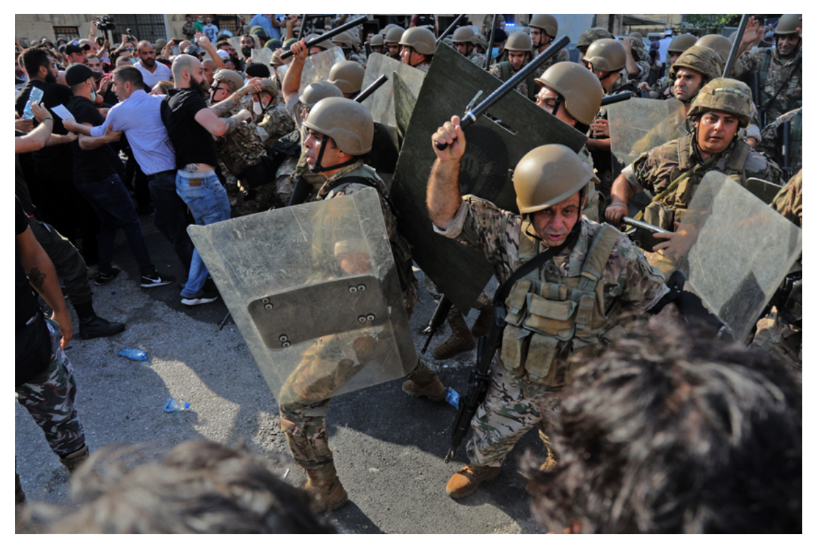
Security forces attempt to disperse protesters gathering outside the entrance to the port of Lebanon's capital on 4 August 2021, on the first anniversary of the blast that ravaged the port and the city.