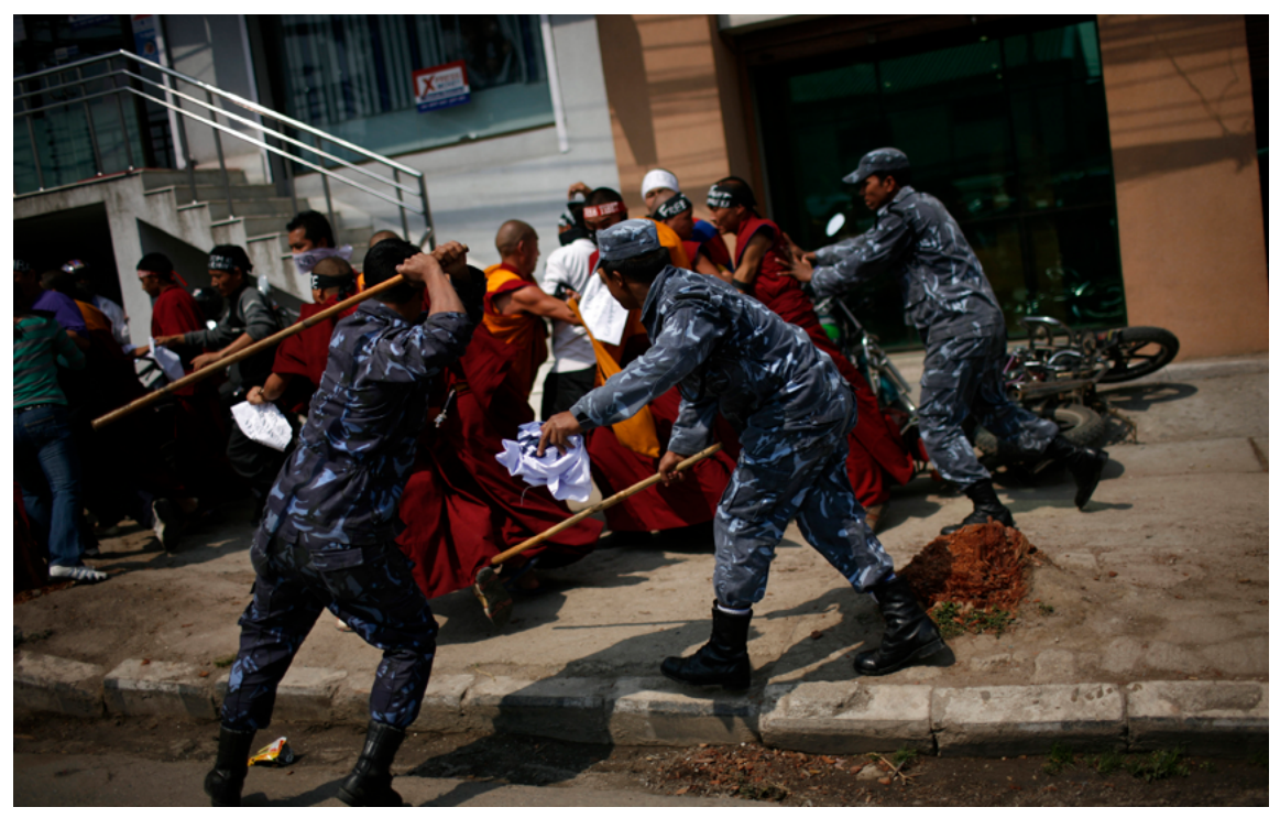
Nepali police baton charge demonstrators with long sticks.

Other forms of handheld kinetic impact weapons are (longer) canes or sticks usually made from bamboo or other wood.