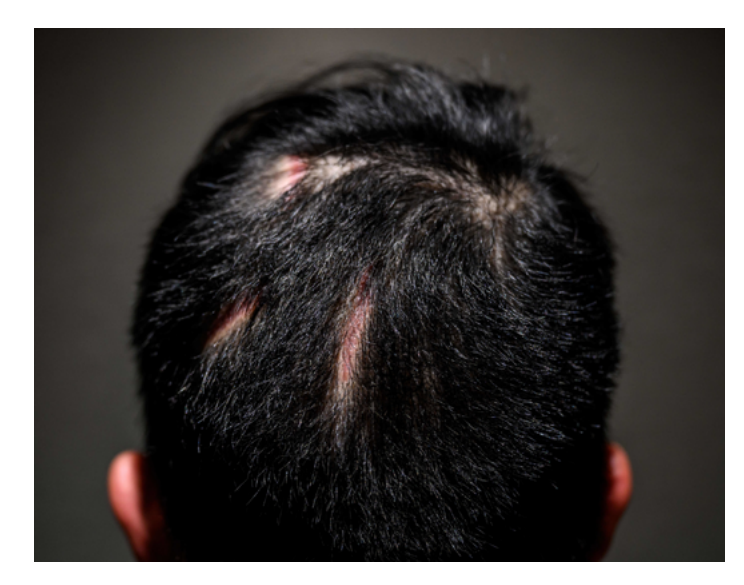
Scarring from injuries on the head of a 17year-old high-school student from Hong Kong which he received, when he and others were allegedly clubbed repeatedly by riot police with batons inside a waiting train. He needed 14-stitches to close a head wound.

Strikes to the head and face may lead to concussion and other head injuries, open head wounds, and potentially life-threatening brain injuries. Strikes to the face may cause facial deformities, eye injury, ear deformities and hearing loss, facial fractures with potentially serious consequences, such as injuries to the eye, nose, cheek, jaws or teeth.