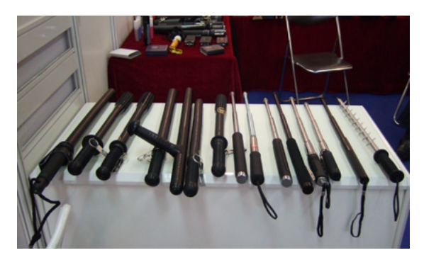
A selection of Chinese straight, side handled and telescopic batons

Particular attention needs to be given to the material and design of batons. For instance, a baton that can easily break bears considerable risks both for law enforcement officials and the person against whom the weapon is used. Law enforcement agencies should not simply rely on the information provided by the manufacturer as it may be inaccurate or imprecise, but make their own assessments – if necessary with the help of independent scientific and medical experts.