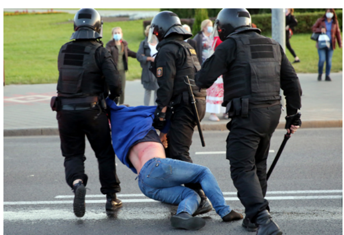
Riot police officers carry away a man with visible marks of a baton use during an opposition rally to protest against the presidential inauguration in Minsk, Belarus, on September 23, 2020.

Usually identified as low-risk areas are the main muscle zones: <u>the thighs</u> <u>and upper arms</u>. In most cases, striking with a baton at these zones will create some painful bruises, also depending on the amount of force used as well as the material and shape of the weapon: the softer the material, the less problematic will be the injury caused by strikes to these areas, the harder and/or the more more angular or sharper edged, the more serious will be the injury caused.