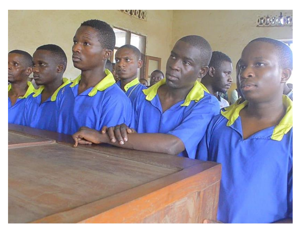
Some of the 13 LUCHA activists during their appearance before the Beni-Butembo garrison military court in Beni on 1 April 2022. The 13 activists arrested during a peaceful protest in the town of Beni on 11 November 2021 and accused of "provocation to disobey the laws" were convicted to one year in prison in April 2022.