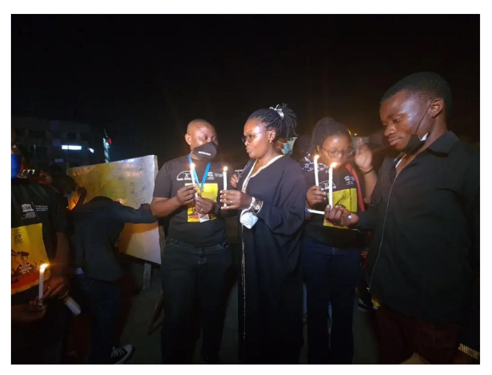
Candle for Press Freedom campaign launched by media trade union in North Kivu to show solidary with those killed and demand justice.