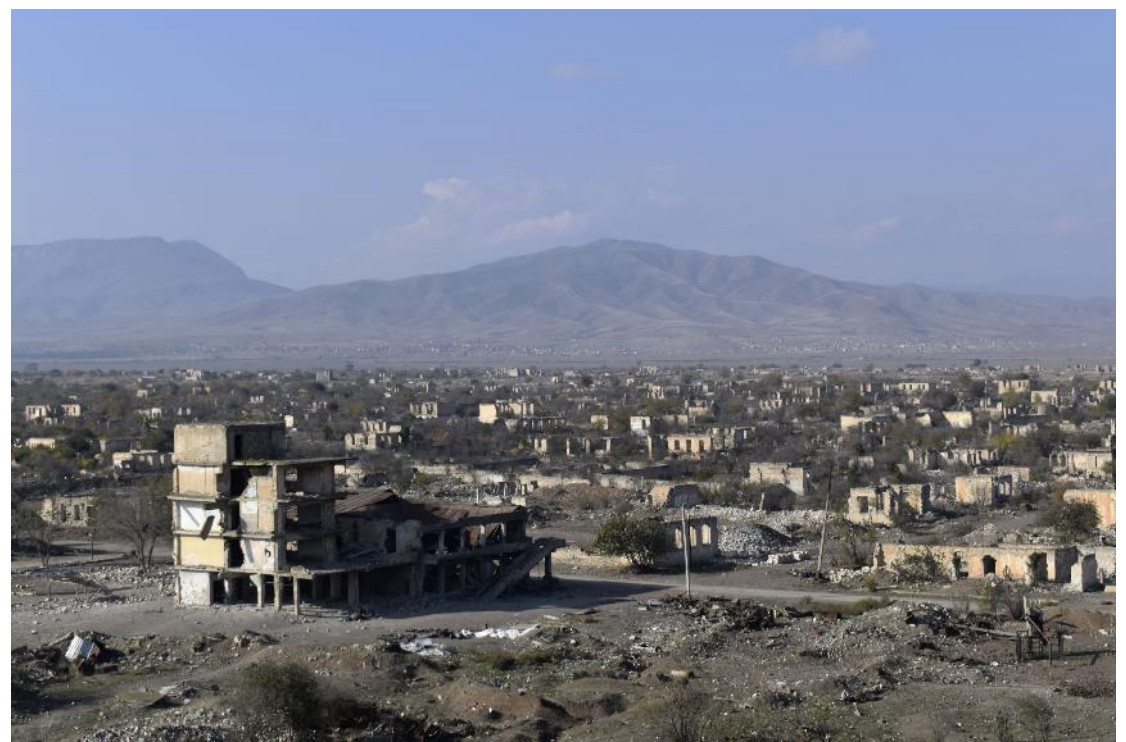
Picture taken in November 2020 of destroyed buildings in Aghdam, Azerbaijan, which has been occupied by Armenia since the 1990s

Under international humanitarian law, civilian objects, including homes and other civilian infrastructure, are protected from military attack unless they become military objectives; the targeting of civilian objects as well as indiscriminate or disproportionate attacks that destroy or damage civilian objects are prohibited.<sup>22</sup> The "[e]xtensive destruction and appropriation of property, not justified by military necessity and carried out unlawfully and wantonly" amounts to a war crime.<sup>23</sup> As the occupying power in these areas, Armenia was also prohibited from destroying or seizing civilian property, "unless required by imperative military necessity," which could again amount to war crimes.<sup>24</sup> In addition, any targeting of Azerbaijani cultural property, including religious monuments and institutions as well as museums and artefacts, was prohibited and a war crime.<sup>25</sup>