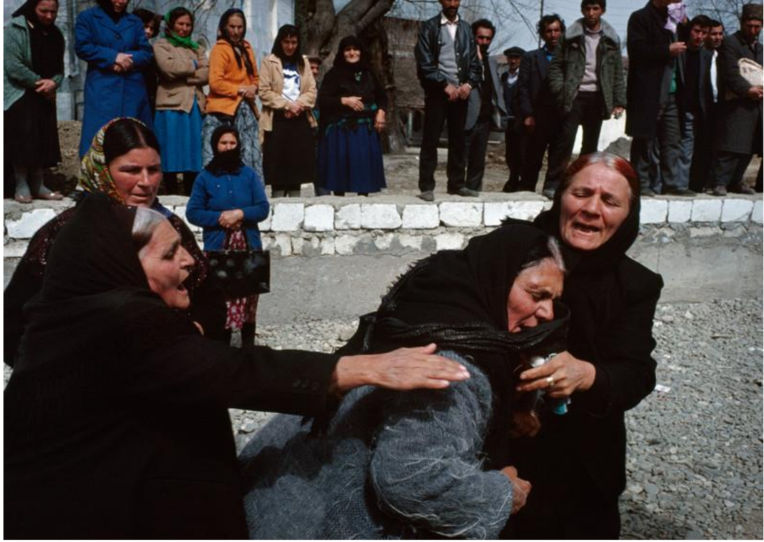
Women console each other after finding the dead bodies of their relatives at a makeshift morgue in February 1992 in Aghdam, Azerbaijan.

The older people interviewed for this report, all of whom were displaced from Nagorno-Karabakh or surrounding regions between 1988 and 1994, experienced grave violations of their rights during that period. Those who lived in communities with ethnic Armenian majorities often described being subject to violence, harassment, and intimidation by ethnic Armenian fighters; some had their homes targeted with explosive devices, one was taken hostage, and others saw their entire communities burned to the ground. Most of those living in communities with majority ethnic Azeri populations, particularly in the seven districts surrounding Nagorno-Karabakh, fled their homes later in the conflict, in 1993 or 1994, typically after their village or town had been subject to indiscriminate and disproportionate shelling for several months. In some cases, displaced people said they had been shot at while fleeing, and saw other people killed while fleeing.