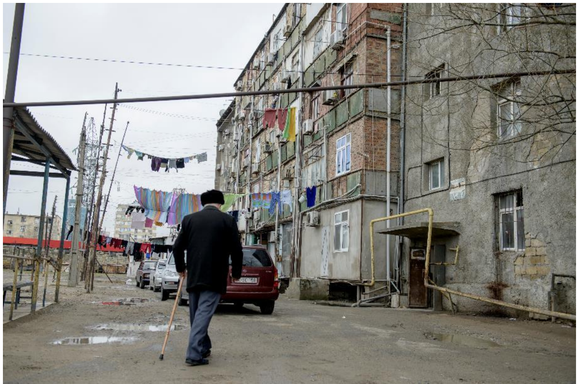
An older man walks across the courtyard of a dormitory for displaced persons in Baku, Azerbaijan

Some older residents of dormitories said they had repeatedly petitioned to move but had been ignored by the executive authorities, appointed officials meant to represent displaced people from a given pre-war community.60