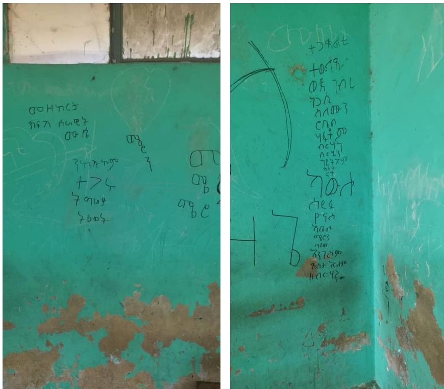
Writing on the wall of the Ewket Chorra school in Kobo, in the Amhara region of Ethiopia, says "Memorial of Moses Division. For all Tigrayans, (Tegaru), Tigray will prevail". The school was being used as a military camp by Tigrayan forces when they controlled the town last year, and was left ransacked and vandalized.