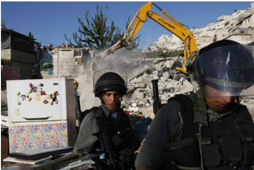
← Israeli policemen guard a bulldozer demolishing a house in the Silwan neighbourhood of occupied East Jerusalem, on 5 November 2008