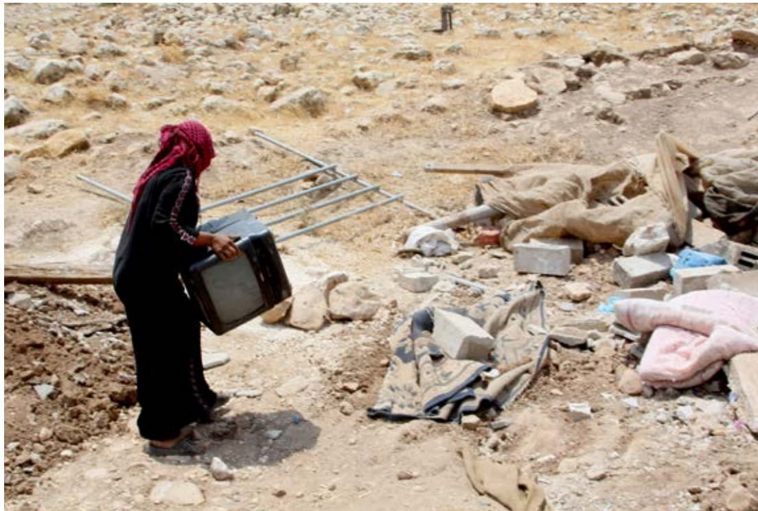
Children inspect the wreckage after Israeli authorities demolished a number of Palestinian homes built without a permit in the village of Umm Al-Khair in the occupied West Bank, on 9 August 2016