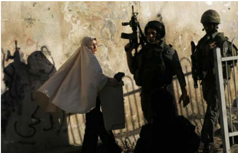
← A Palestinian woman walks past Israeli border policemen during the demolition of a Palestinian house by Jerusalem municipality workers in the Silwan neighbourhood of occupied East Jerusalem, on 5 November 2008

Jewish settlements, houses and compounds in the heart of Palestinian neighbourhoods have a disastrous impact not only on the displaced Palestinian families, but also on the entire neighbourhood and daily life of the Palestinians. Settlers are usually armed, and their compounds are fenced and protected by private security companies, which leads to friction with the local Palestinians. In several cases, these tensions have led to violent confrontations that usually end with the arrest and injury of Palestinians, including children. The settlers' control over land and property in Silwan has also led to the fencing of these sites, blocking passages that served the local Palestinian population and disrupting their lives.