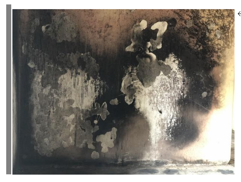
← ⓓ A photograph of burn marks on a wall taken by Amnesty International in the North Western Province, following the violence on 13 May 2019

A photograph of the damage to metal sheeting taken by Amnesty International in the Western Province, following the violence on 13 May 2019