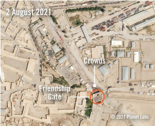
Spin Boldak border crossing. 2 August 2021. Planet Labs.

Afghans who tried to cross land borders, an Afghan researcher, and the UN agency in charge of refugees (UNHCR), all told Amnesty International that the Afghan people were also prevented from seeking refuge abroad because most of the land border crossings were closed for asylum seekers. 185