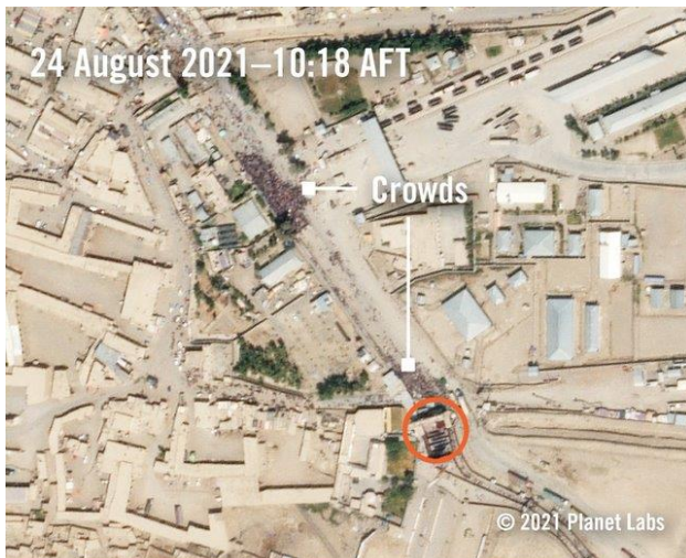
Spin Boldak-Chaman crossing. 24 August 2021.

For instance, according to UNHCR, Pakistan closed its border with Afghanistan, except for people in need of medical treatment, or with a proof of residency. 186 Despite that, at the Spin Boldak-Chaman border crossing in Kandahar, people with Tazkira (National ID Card) from Kandahar, Helmand, Zabul, and Uruzgan were allowed to cross the border. Between 2 August 2021 and 24 August 2021, the crowds attempting to cross the border to Pakistan via the Spin Boldak crossing increased exponentially, as documented via satellite imagery (see above) and video analysed by Amnesty International.