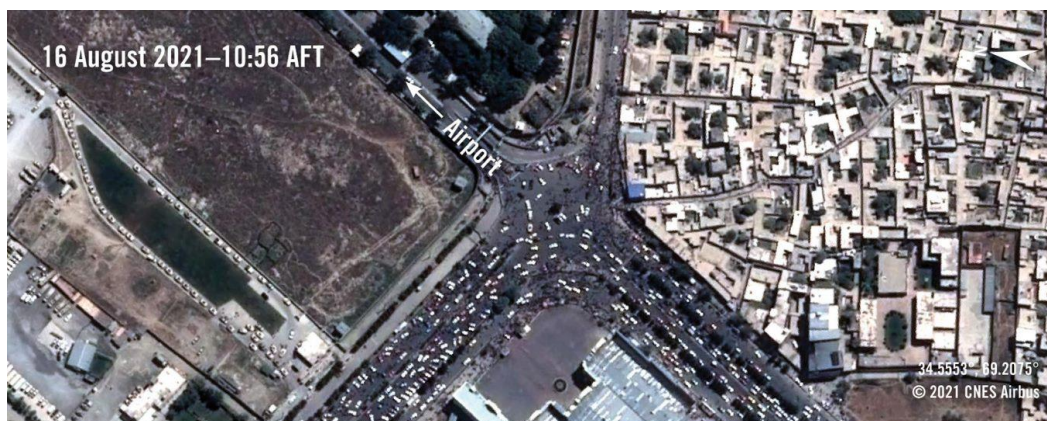
Kabul Airport vicinity. 16 August 2021.

In this report, Amnesty International, International Federation for Human Rights (FIDH) and the World Organisation against Torture (OMCT) have documented incidents of human rights violations that have taken place in Afghanistan since the takeover by the Taliban on 15 August. This report calls on the UN Human Rights Council (UNHRC) to take decisive action to establish a robust independent investigative mechanism to monitor and report on human rights abuses committed in violation of international human rights law, and to contribute to accountability for crimes under international law. Human rights defenders, journalists, and others who are targeted for their work must be evacuated and given safe passage if they wish to leave Afghanistan; and women and girls, and ethnic and religious minorities who are targeted because of their gender, ethnic, and religious identity, must be guaranteed protection. All those who wish to leave Afghanistan must be assured the right to seek asylum. At the same time, the Office of the Prosecutor of the International Criminal Court must receive assistance from the international community to immediately recommence its investigations into crimes under international law committed in Afghanistan.