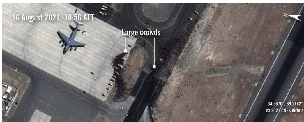
16 August 2021. Kabul Airport.

The thousands who are left behind, or are trying to leave Afghanistan, are testament to the brutal regime of the Taliban circa 2001, when extrajudicial executions abounded, and women and girls were oppressed with a plethora of restrictions. Since then, even in the last 20 years, the Taliban and other armed groups have conducted brutal attacks on civilians, journalists, human rights defenders, and government workers, resulting in Afghanistan having one of the highest civilian deaths in the world. 32 Nearly 50,000 civilians have died in the last 20 years. 33 The first half of 2021 alone recorded 5183 civilian casualties (1,659 deaths and 3,524 injuries), of which 32 per cent were children. This is a 47 per cent increase in civilian casualties compared to the same period in 2020. 34 Those responsible for these casualties include both anti-government and pro-government forces. 35