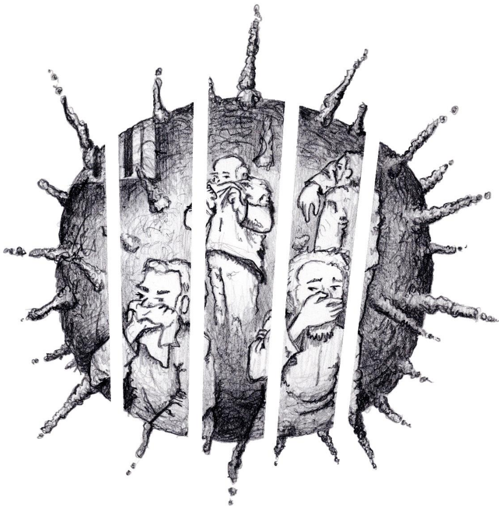
Preventive and protective measures.

“As far as our protection is concerned, it is the grace of God that protects us. We only have a few gloves and masks... What we were given was very insufficient. While we use the materials economically, that is to say one glove instead of two to do the searches, it wears out in a few days [but] we manage as best we can.” 74