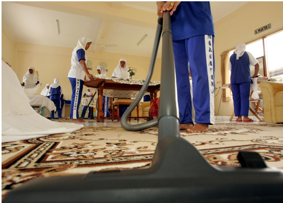
An Indonesian domestic worker trainee practices using a vacuum at a private training and education centre for domestic workers

Rosalinda, a Filipino domestic worker in Qatar, said: