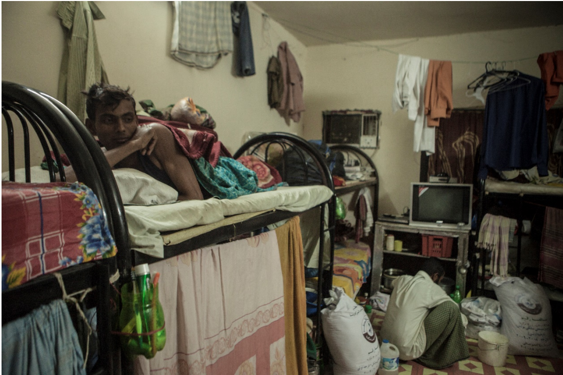
Migrant workers rest after a day of work between 1 and 8 centimetres thick, in a labour camp dormitory in Doha's Industrial Area, on June 18, 2011

The men were then held in overcrowded cells without beds or bedding, and not given enough food or water, before being deported several days later, many without having been paid their outstanding salaries and benefits from their companies.