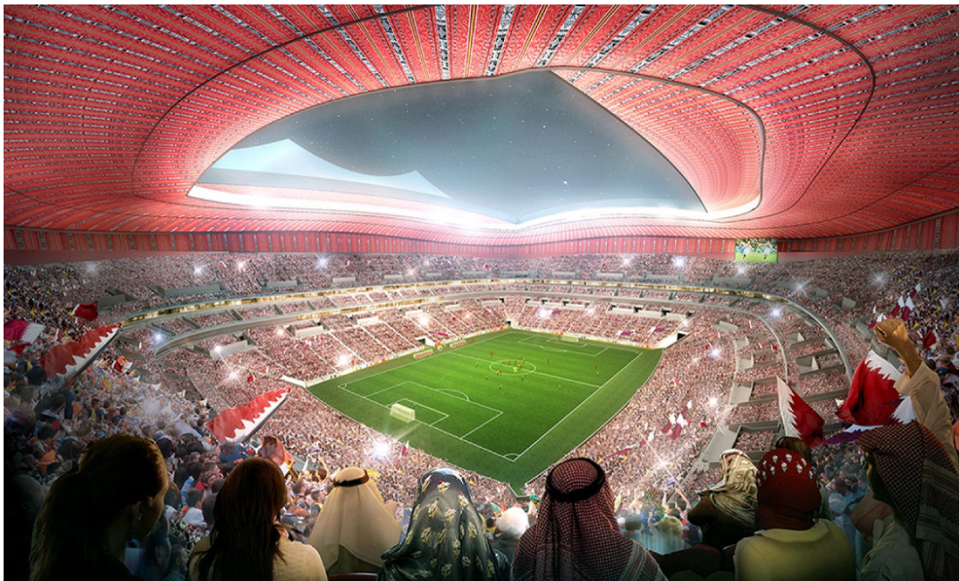
Artists impression of the Al Bayt Stadium, one of the newly built venues for the FIFA World Cup Qatar 2022. © LOC FIFA

But as the countdown to kick off continues, are the promises of labour reforms matched by the reality faced by migrant workers upon whom Qatar so depends?