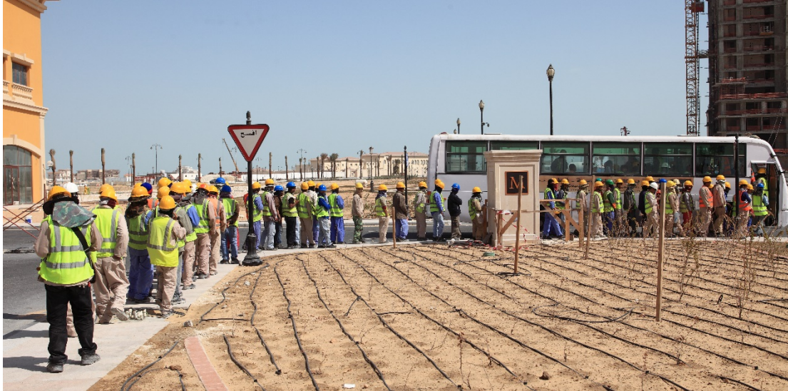
Migrant workers queue to board a bus that will return them to their labour camps which are usually located outside of the city centre.

In 2019 and 2020, the Ministry of Labour and the ILO launched initiatives to promote workers' voices, 77 including pilot projects to form workers' committees in companies and organizations, 20 of which have now been established, representing almost 17,000 employees. 78 A new decision on regulating the conditions and procedures for electing workers' representatives to joint committees was adopted. 79