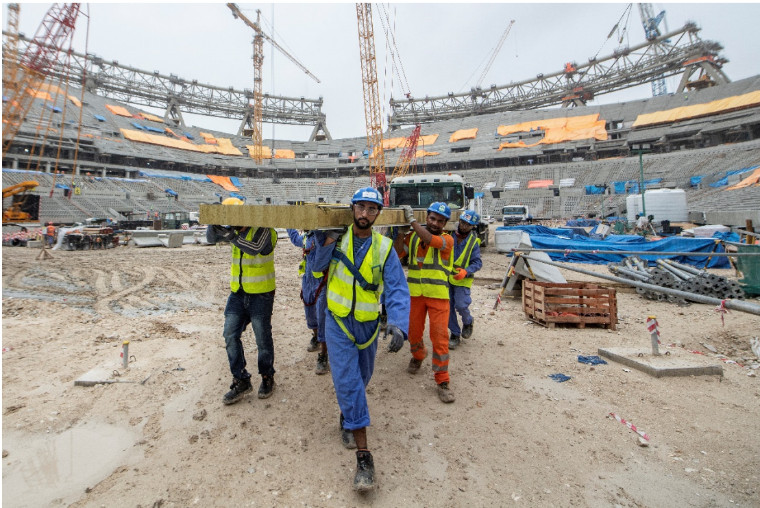
Migrant workers constructing the Lusail Stadium on December 10, 2019 in Doha, Qatar. The Lusail Stadium will host the opening match and the final match of the next FIFA World Cup Qatar 2022.