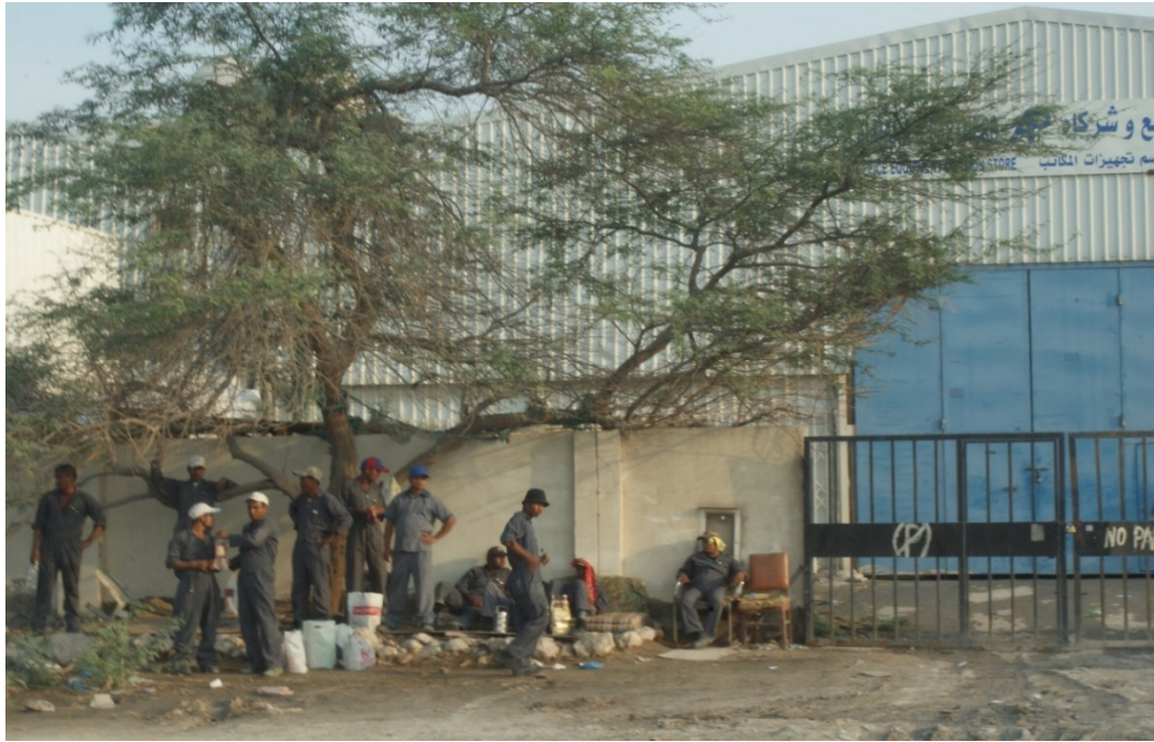
Migrant workers in Doha's industrial area, 2012.

If either the employer or worker terminates the contract without respecting the notice period, they must pay the other party compensation equivalent to the worker's basic wage for the notice period or its remaining time. If workers fail to abide by these provisions, they cannot work in the country for a year after their departure.