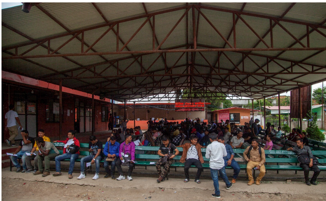
Nepali migrant workers wait outside the Foreign Employment Office at Tribhuvan International Airport, Kathmandu before leaving Nepal © Rajneesh Bhandari/Amnesty International.

Amnesty International continues to document cases of migrant workers who have not received their wages for months. Organizations including Human Rights Watch 42 and Migrant-Rights.org 43 have also documented cases of wage theft, showing that government efforts to improve the situation have largely failed.