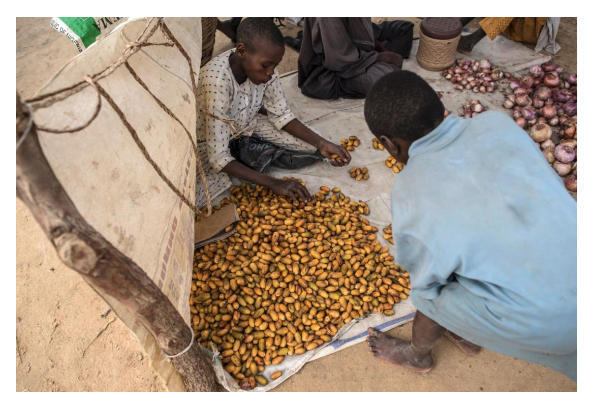
\textit{Boys sort through fruit at a vendor in the Bakasi IDP Camp on 6 July 2017, Maiduguri, Borno State.