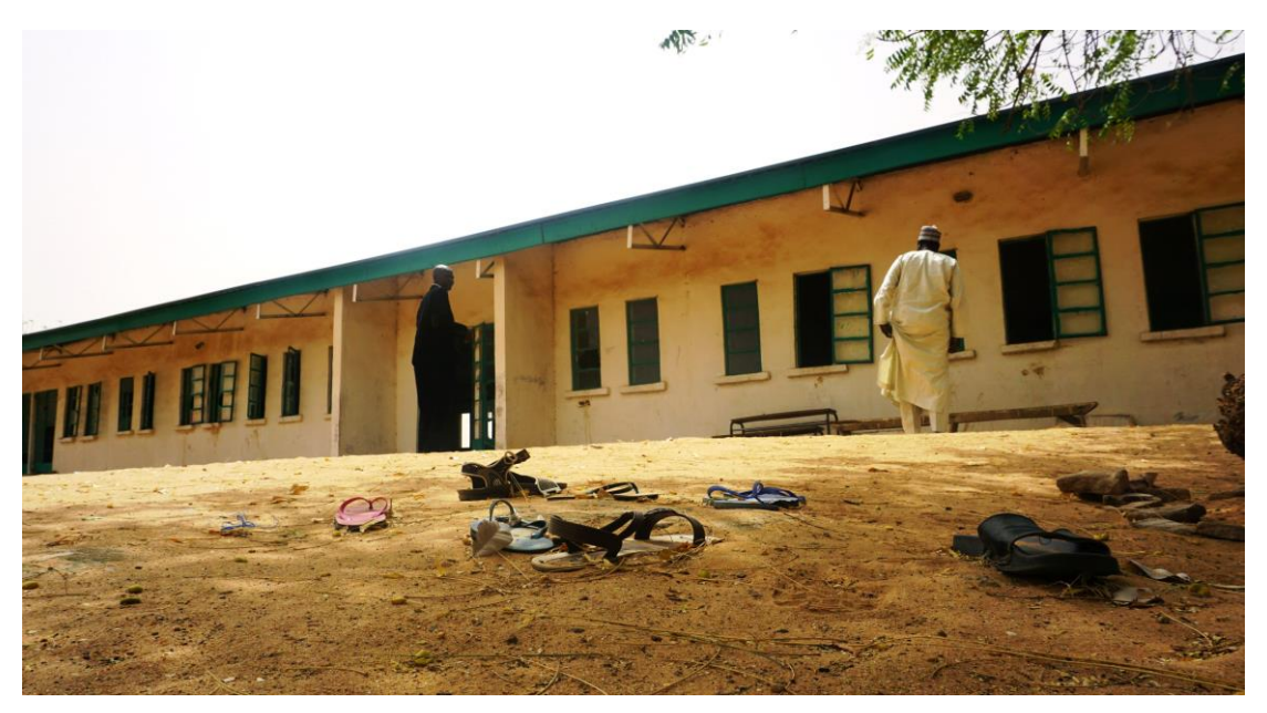
Sandals are strewn in the yard of the Government Girls Science and Technical College staff quarters in Dapchi, Nigeria, on 22 February 2018, after more than 100 girls were abducted by Boko Haram several days earlier.

The abductions have a cascade of negative effects on families, including the pain of not knowing whether the person is alive. "I never saw or heard about my mother or siblings and always wondered what happened to them," said a 16-year-old girl who was abducted with them from a village in Michika LGA, Adamawa State, and then separated from them in Sambisa, which she escaped in late 2018."<sup>64</sup>