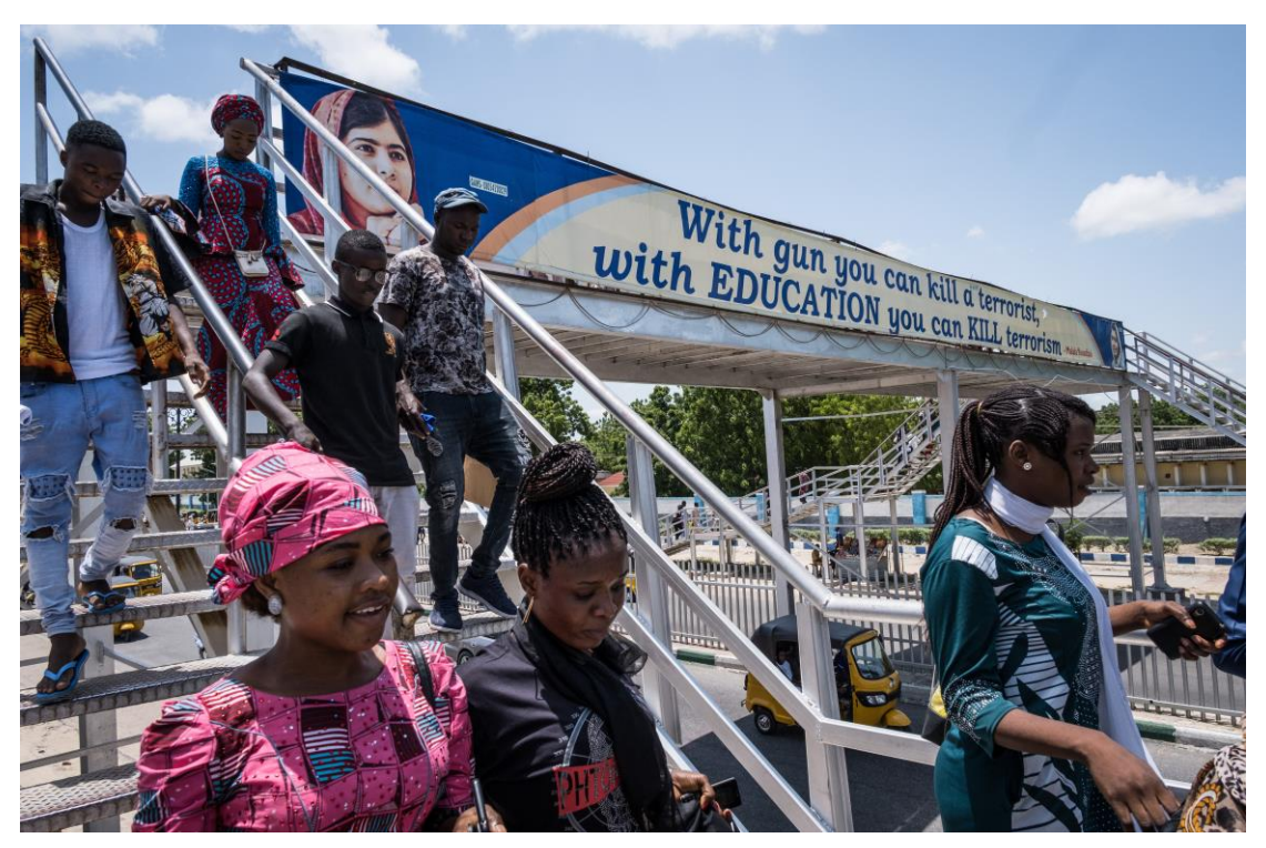
People in Maiduguri cross a pedestrian bridge with a large banner proclaiming the importance of education in the context of the conflict, Borno State, Nigeria, 2019.

Although military use of schools is beyond this report's scope, in March 2019 Nigeria took the important step of formally committing to the Safe Schools Declaration, a political agreement endorsed by 103 states, as of 30 April 2020, with "a set of commitments to strengthen the protection of education from attack and restrict use of schools and universities for military purposes." In light of that action, the federal government has begun the process of revising the Armed Forces Act to protect schools from military occupation and use.