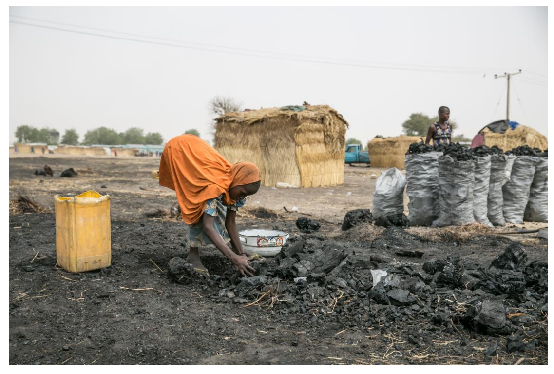
A girl picks up charcoals inside an IDP camp on 21 April 2019 in Maiduguri, Nigeria.