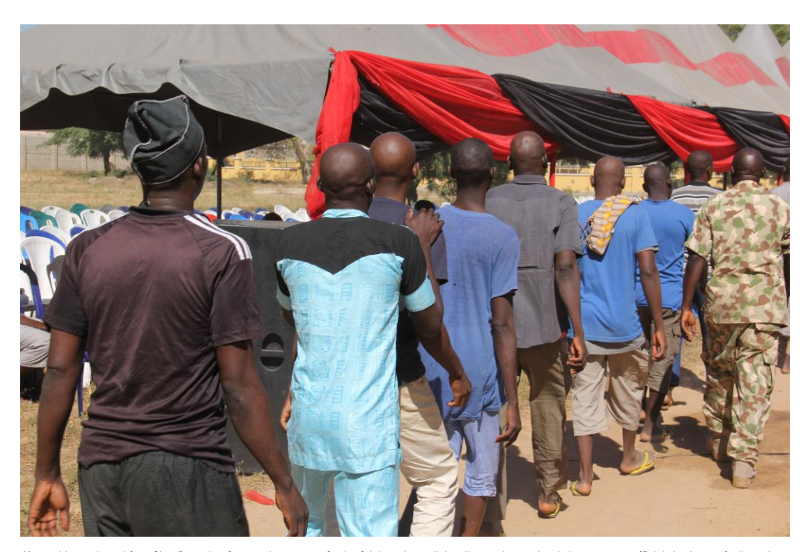
Men and boys released from Giwa Barracks after months or years of unlawful detention walk in a line as they are handed over to state officials in charge of a "transit centre" where they will be held before returning to their communities, 27 November 2019, Maiduguri, Borno State.