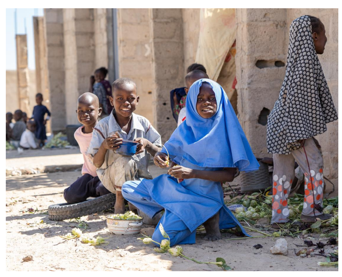
After finishing class in primary school, a girl (in blue uniform) plays with other children who are not in school, before going home, Kaleri, Borno State, Nigeria, 2019. The area, located near Jere, has been attacked several times by Boko Haram.