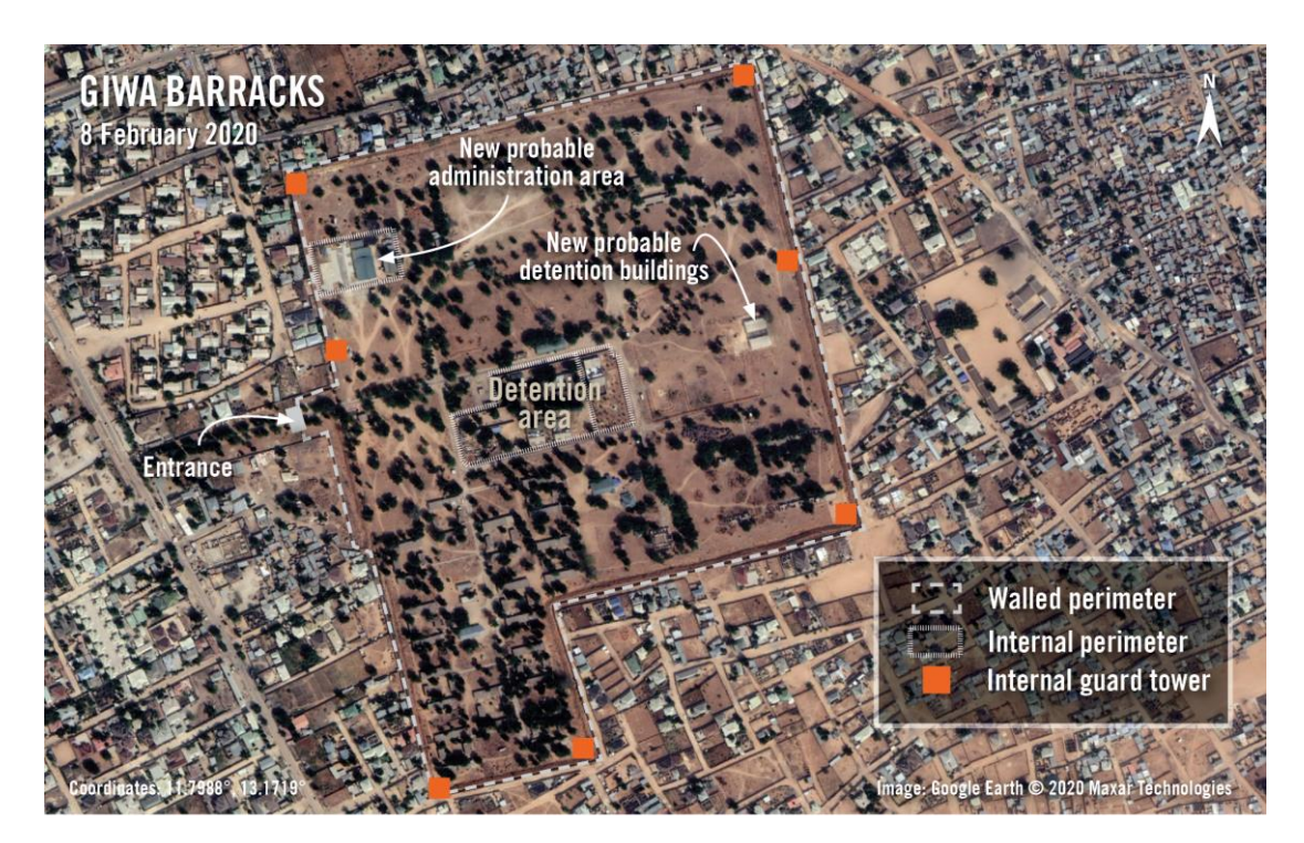
Satellite imagery from 8 February 2020 shows an overview of Giwa Barracks in Maiduguri. The barracks is enclosed with a walled perimeter and a controlled entrance on the west side. Seven guard towers and two areas with walled perimeters are visible within the compound. One perimeter encloses the detention area.