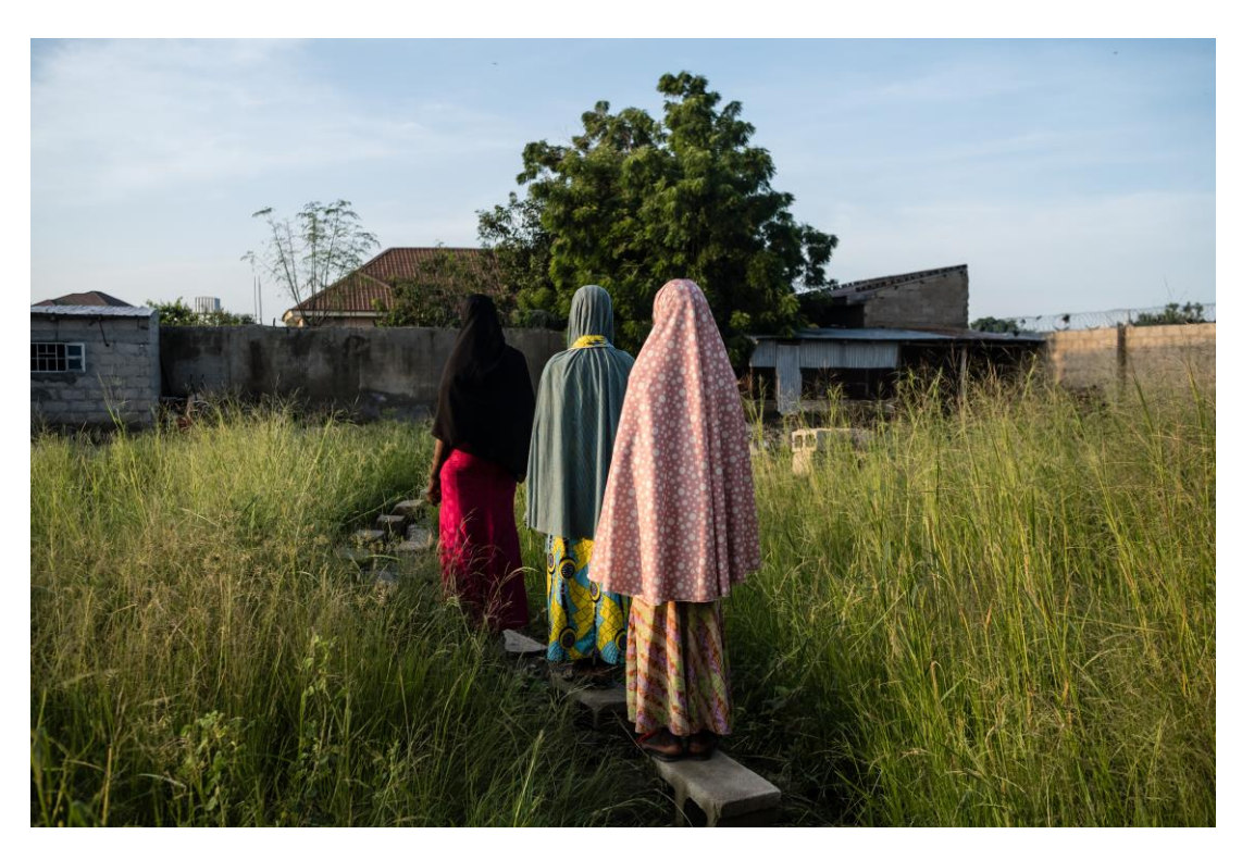
Three women and girls walk home in Maiduguri, Nigeria, on 4 September 2019. One woman had been abducted by Boko Haram as a girl and then detained in Giwa Barracks for 15 months after escaping. Another spent two years in Giwa.