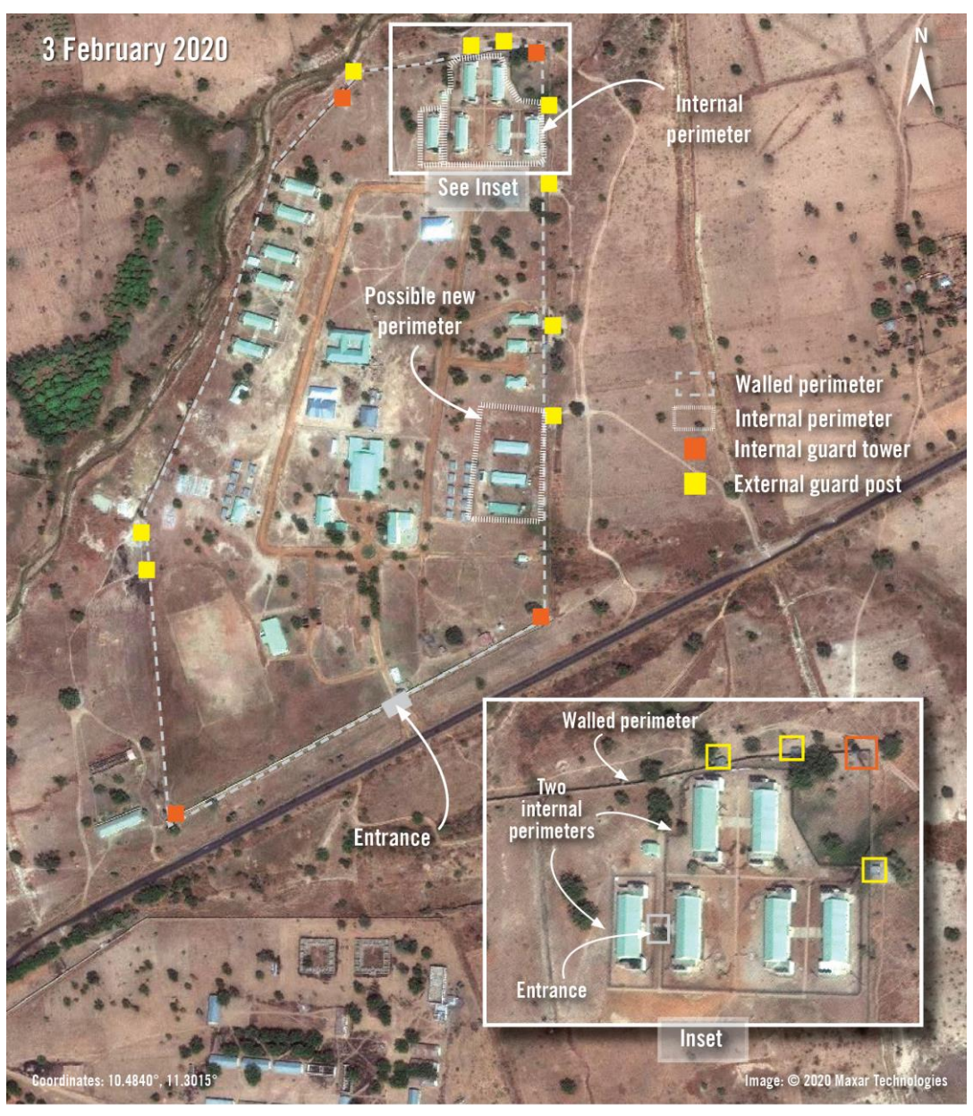
This area is located approximately 33 kilometers north of Gombe town. The entire facility is surrounded by a walled perimeter with one controlled entrance on the south side, next to the main road. There are nine structures along the walls outside the facility which could be guard posts, though the locations of the structures are somewhat erratic. There are also four probable guard towers inside the perimeter, at each corner. There are five buildings in the northeast corner that have a secondary perimeter. There is also a sixth building with a separate perimeter. The secondary perimeter and cluster of guard posts suggest it could be a detention area.

A person with direct knowledge said that with the current batch of more than 600 people, prison officials may now sometimes accompany detainees, rather than army intelligence. But the person said all movements still seem to be accompanied by a guard and that the environment is "highly regimented". 321