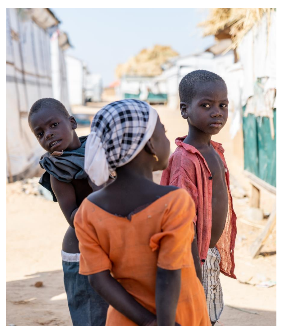
Displaced children unable to access education in Dalori 1 Camp outside Maiduguri, Borno State.

To date, the Nigerian government has fallen well short of that obligation. Instead, as subsequent chapters detail, the military has detained thousands of boys and girls coming out of Boko Haram territory for months and even years; subjected the vast majority of those in detention to torture or other ill-treatment; reached few children with psychosocial support; impeded humanitarian assistance and otherwise failed to respect many displaced children's rights to food and to physical and mental health, exacerbating underlying distress; and failed to ensure children have access to education.