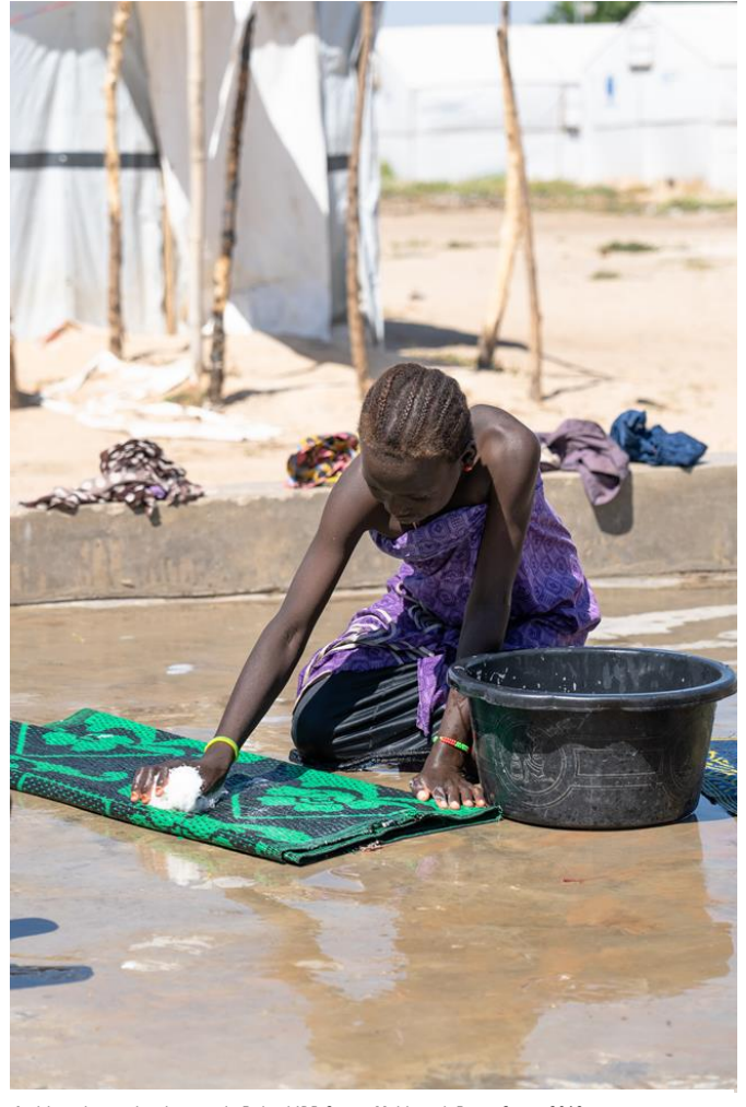
A girl washes a sleeping mat in Bakasi IDP Camp, Maiduguri, Borno State, 2019.

The school is far... From Water Board to the front of the market [near the school] is 50 naira each. For the two of them it's 100, to come back is also 100, so I give them 200 naira (US$0.51) daily for transport... What I do for work is go to the bush and get firewood; I sell it, leaving some for cooking, and out of the money [made], I pay their daily fare. Sometimes I won't even have money to pay for their transport. Those days they come back on foot. If [the school] close[s] at 1pm on days they don't have money, they get home around 3pm. If you're an adult and you're walking very fast, you may get to the camp in 45 minutes, but you know children will want to play on the road. 472