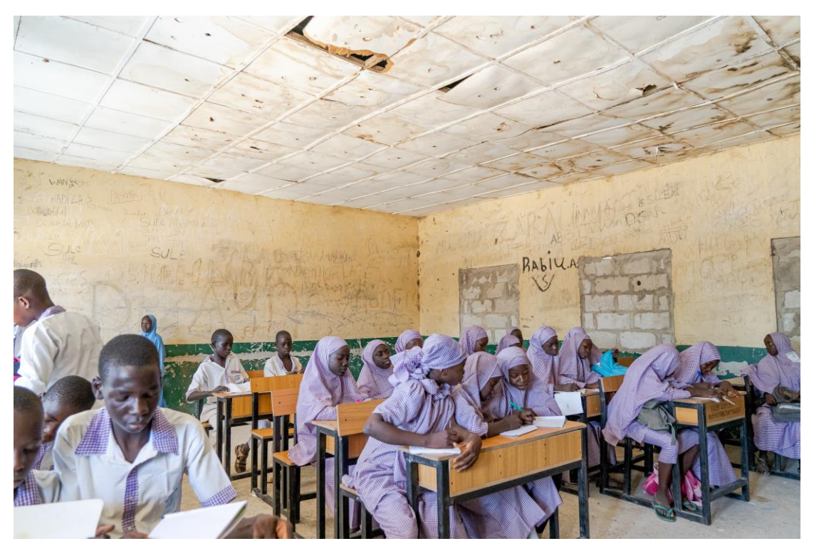
Children sit at their desks in Kaleri primary school, located in the host community, Borno State, 2019. The area has been attacked by Boko Haram several times.

Some parents and other guardians told Amnesty International they had pulled children out of school after hearing how they spent their time; some parents and community leaders had gone to see classes for themselves, before removing children. The father of a 10-year-old girl in Monguno's Water Board Camp said he registered his daughter for the school in town for displaced children and ensured she went every day, even providing money from the family's food distribution for the girl to take a keke tricycle taxi. However, the girl consistently returned and "told me they don't teach them anything in school, that they only go there to play. She told me they just go and sit on the bench every day, [often] no teacher comes into the class." <sup>534</sup> The father eventually decided to remove the girl from the school.