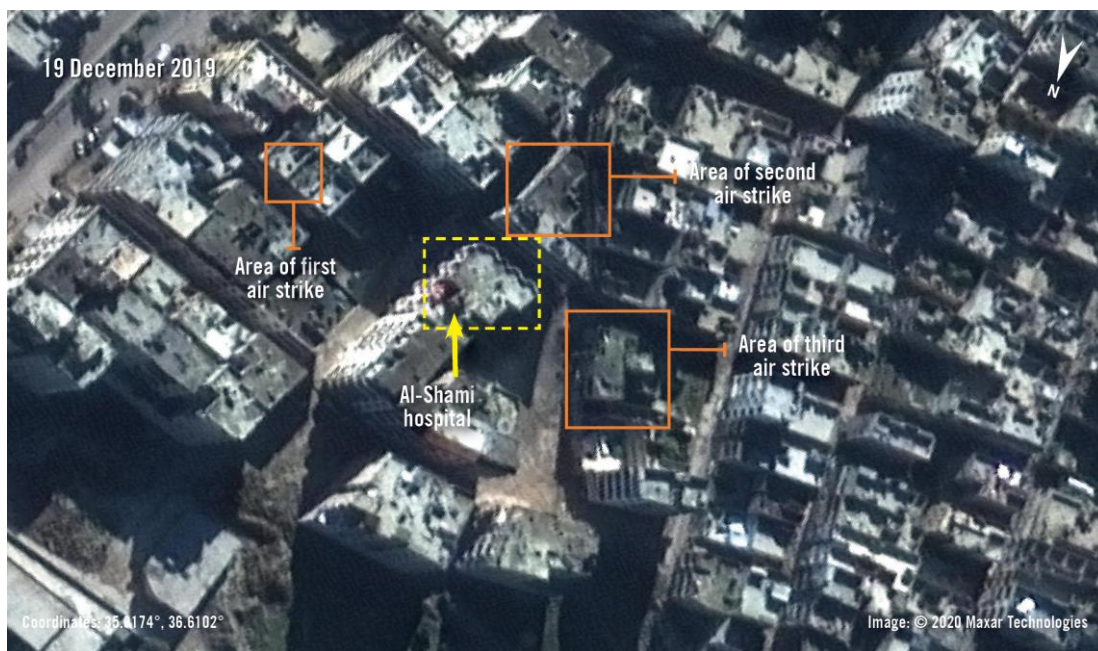
Satellite imagery taken on 19 December 2019 showing al-Shami hospital and its environs before the three air strikes that took place on 29 January 2020.

Al-Shami hospital closed after the attack due to the damage to equipment in it and the advance of government forces into Ariha.