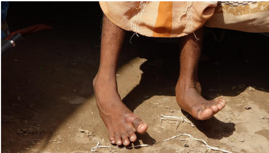
The Convention on the Rights of Persons with Disabilities recognizes disability as “an evolving concept” adding that it “results from the interaction between persons with impairments and attitudinal and environmental barriers that hinders their full and effective participation in society on an equal basis with others.” Mishqafa Camp, Lahj, 11 June 2019.

In June 2019, the UN Security Council unanimously adopted the first stand-alone resolution on the protection of persons with disabilities in armed conflict. 10 This belated endorsement of the protection of persons with disabilities in crisis situations has been heralded as a landmark resolution, especially in light of the relative neglect of the issue in the work of international humanitarian and human rights organizations alike, including Amnesty International.