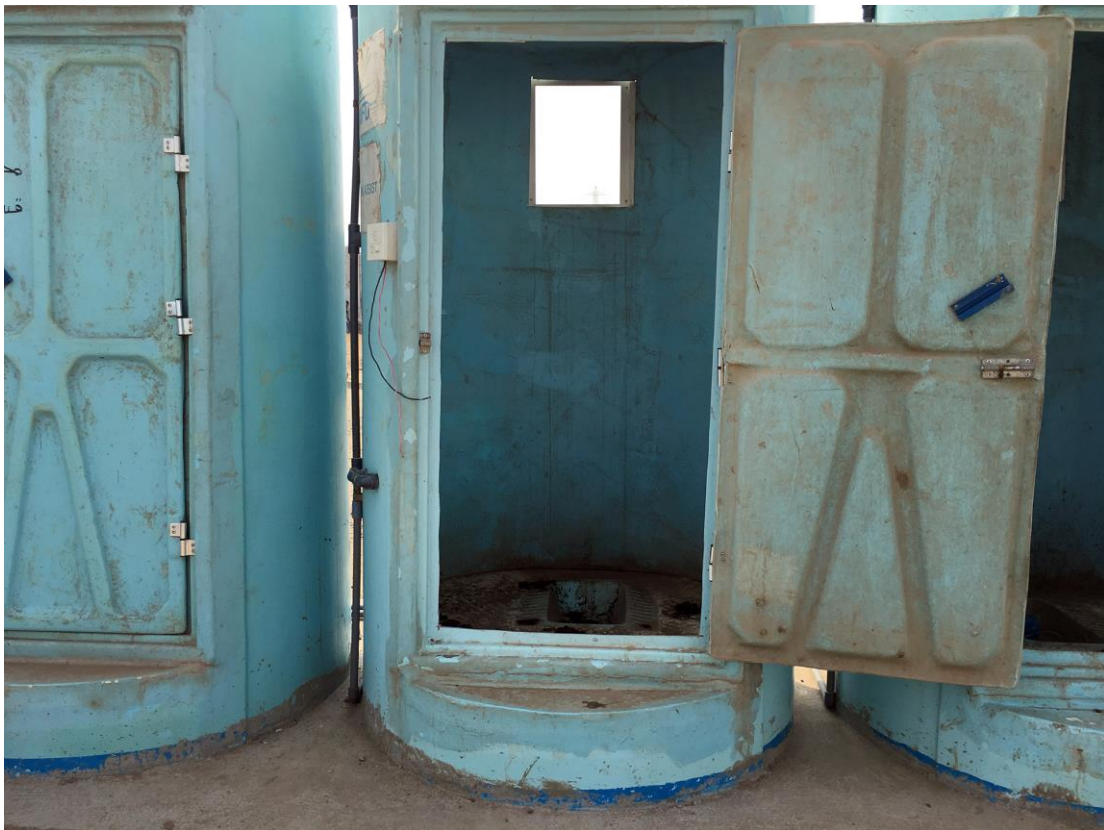
During a visit to Sabr Camp in Lahj, 12 June 2019, Amnesty International observed how latrines were inaccessible for persons with disabilities. These conditions, also observed in other camps visited by the organization, have an impact on persons with disabilities’ capacity to practise self-care and undermine their autonomy, privacy and inherent dignity.

She got so sick, it was like she was dying. I ran to the hospital. I didn’t even have my headscarf on – the doctor gave me his thing [his jacket] to cover up... Her face and lips had turned black... The doctor said it was because of the poor ventilation in the tent. My daughter needs good ventilation and oxygen... The doctor said the tent is no good for her and that she needs to get out of here. 67