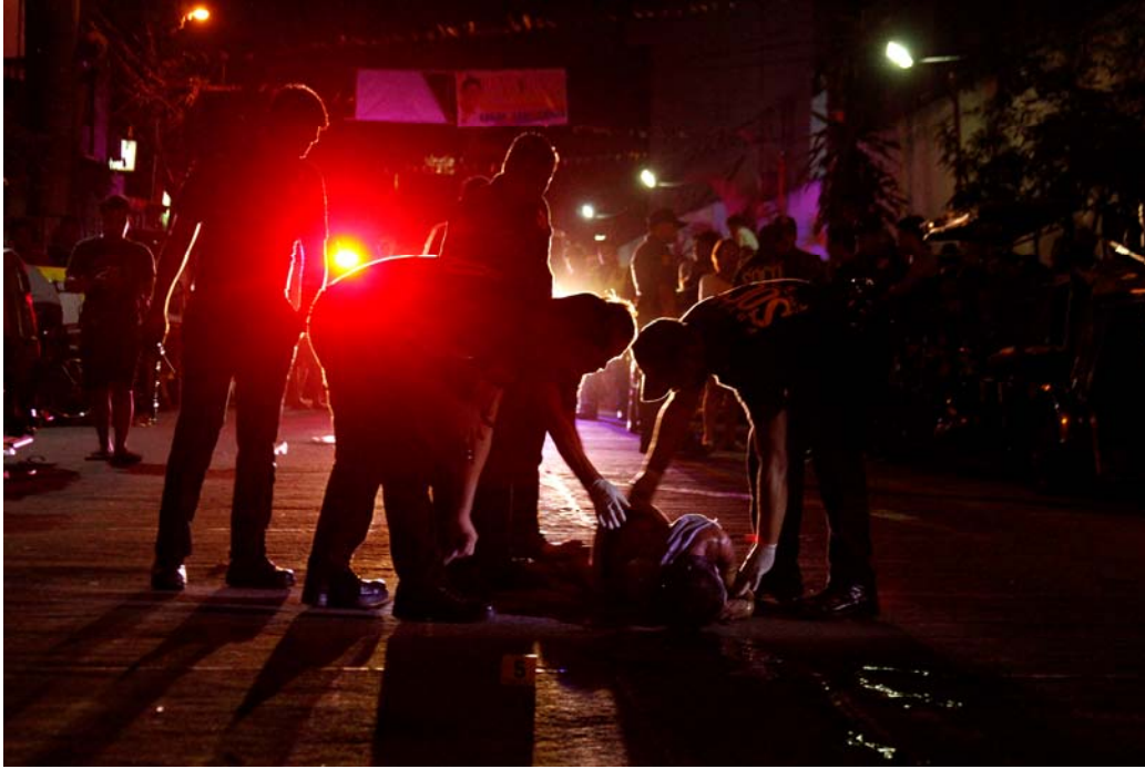
Crime scene investigators handle the body of a man killed by unknown armed persons, 11 May 2018, Caloocan City, Metro Manila. Local officials said the man was on a “drug watch list.”

A former public safety officer who had served in various security roles in their community for more than a decade told Amnesty International that in their experience, “drug personalities” with connections do not end up on these lists. “I know a big-time pusher [in our area], but his name is not on the list,” they said. 117 Documentation by Amnesty International and others, as well as extensive media reports suggest that this is not unusual and that the vast majority of those on the lists are poorer, more marginalised members of the community.