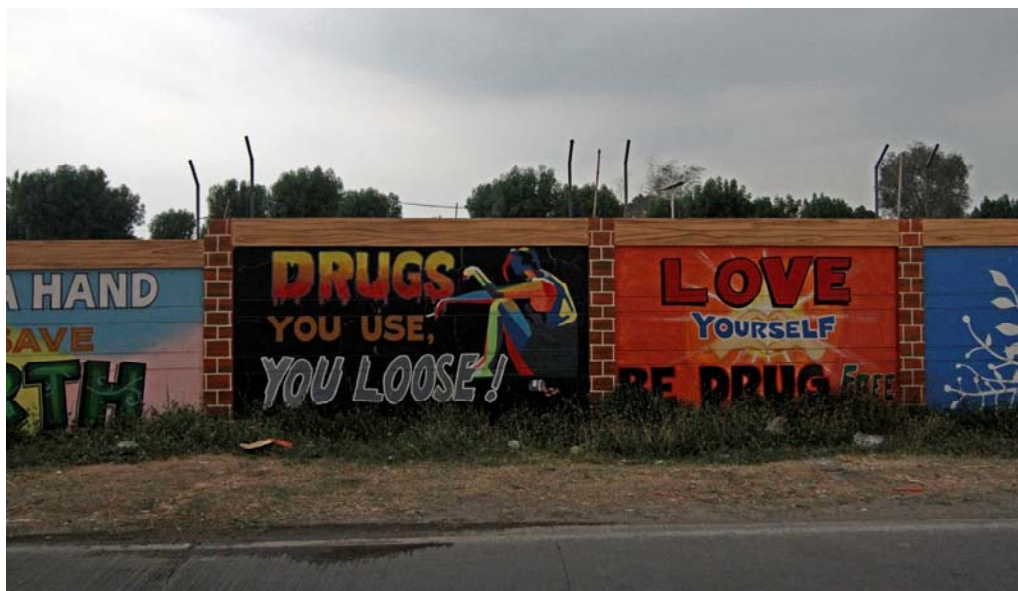
In this photo taken 18 April 2019, murals supporting the government's anti-drug campaign can be seen in Bocaue, Bulacan.

Mandatory drug testing is an arbitrary interference with an individual's privacy and is counterproductive from a right to health perspective, since it deters people from seeking the help they may need. Moreover, the consequences of having a positive result after a drug test can be deadly, as Feria attested. Far from allowing people using drugs to seek help, the requirement for them to expose themselves to local authorities and others so publicly has increased stigma and demonisation of people using drugs further.