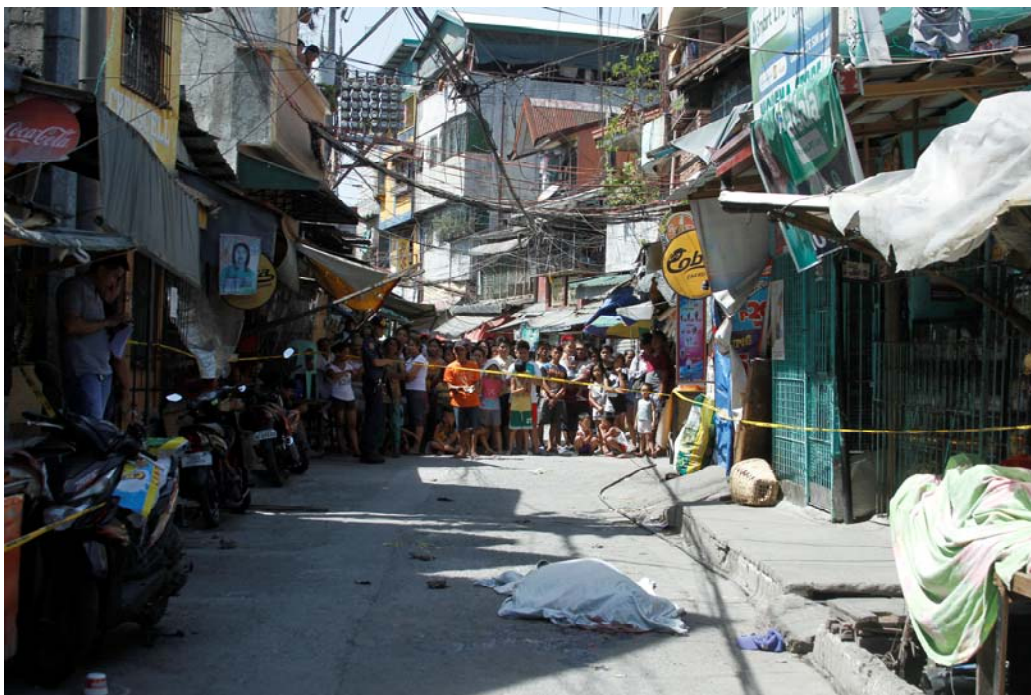
Onlookers gather behind police crime scene tape at the site of the killing of a man who was shot by unknown armed persons, 21 March 2019, Malabon City, Metro Manila. A sign reading "Don't emulate me, I'm a [drug] pusher" was left on the body.