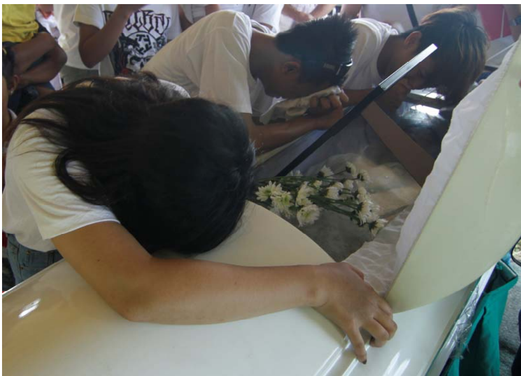
Family members and friends of a man killed by the police mourn over his casket during the funeral, December 2018, location withheld. The father of three was killed by the police a month prior in the province of Bulacan in an alleged "buy-bust" operation, the circumstances of which are disputed by family members.

In a survey conducted in December 2018 by a leading Philippine independent research institution, 78% of Filipinos said they worried that they or someone they know would become the victims of extrajudicial executions. 77 Commenting on the findings of the survey, a presidential spokesman was quoted as saying, "If they (Filipinos) are not involved [in drugs], they do not have to be afraid." 78