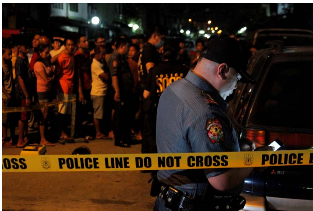
A policeman waits at the scene of an anti-drug police operation, 17 August 2017, Manila.