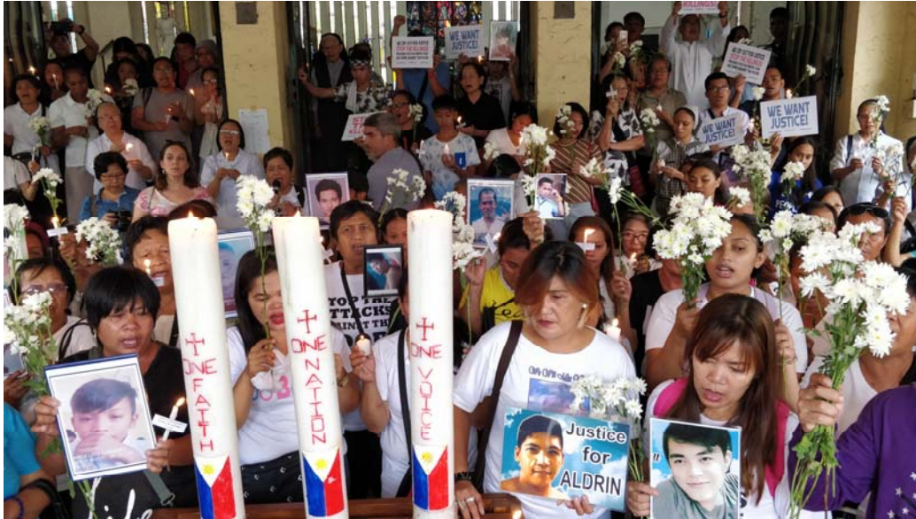
Families of victims of extrajudicial executions gather at the Shrine of Jesus Parish, 15 March 2019, Quezon City, Metro Manila. They were holding a prayer and rally demanding justice for the victims.