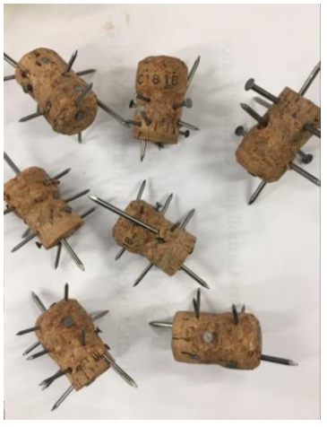
Left: slashed tyre of Secours Catholique van, November 2018, right: corks spiked with nails, collected outside Secours Catholique's Calais office, July 2018.

Some humanitarian workers and volunteers have decided to stop talking about their work to avoid conflict or retaliation. For example, a worker with a medical charity told Amnesty International "I've stopped telling people that I work with [a medical charity] in Calais. We regularly receive insults and threats on Twitter. For the volunteers it's very difficult. They are scared. We brief them on security and the context and they get scared. We struggle to recruit new volunteers." <sup>69</sup>