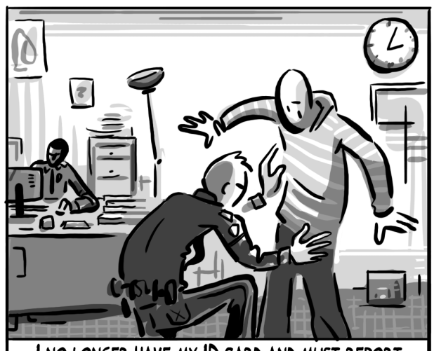
I NO LONGER HAVE MY ID CARD AND MUST REPORT TO MY LOCAL POLICE STATION EVERY DAY AT THE SAME TIME. EVERY DAY, THE POLICE PAT SEARCH ME. WITHOUT EXCEPTION, EVEN SUNDAYS.