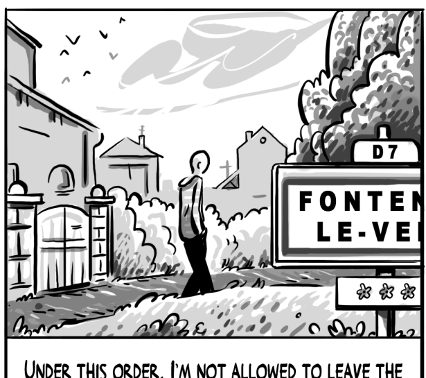
Under this order, I'm not allowed to leave the town where I live. A small town of only 8km².