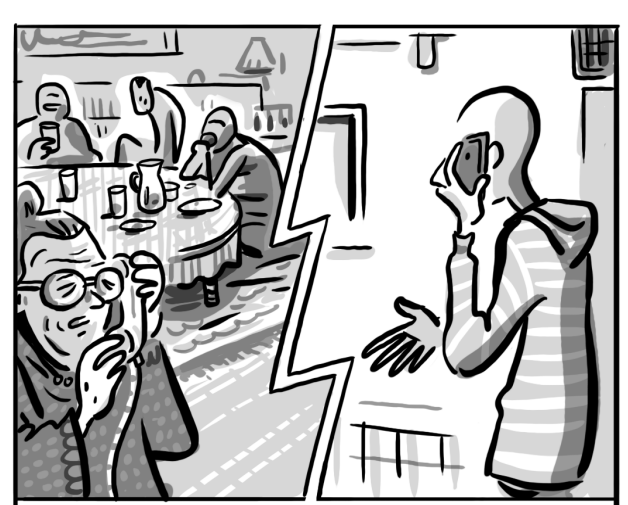
I USED TO SPEND SUNDAYS WITH MY FAMILY AT MY MOTHER'S HOUSE. BUT SHE LIVES IN A NEARBY VILLAGE... BEYOND THE BORDERS OF MY TOWN. I HAVEN'T HAD A FAMILY MEAL AT HER HOUSE FOR OVER A YEAR.