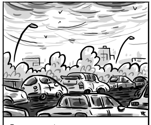
THE OTHER DAY, I WAS ON MY WAY TO REPORT TO THE POLICE STATION WHEN I GOT STUCK IN TRAFFIC.