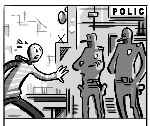
" YOU'RE LATE. WE'RE GOING TO HAVE TO SEND THIS UP TO THE PROSECUTOR."