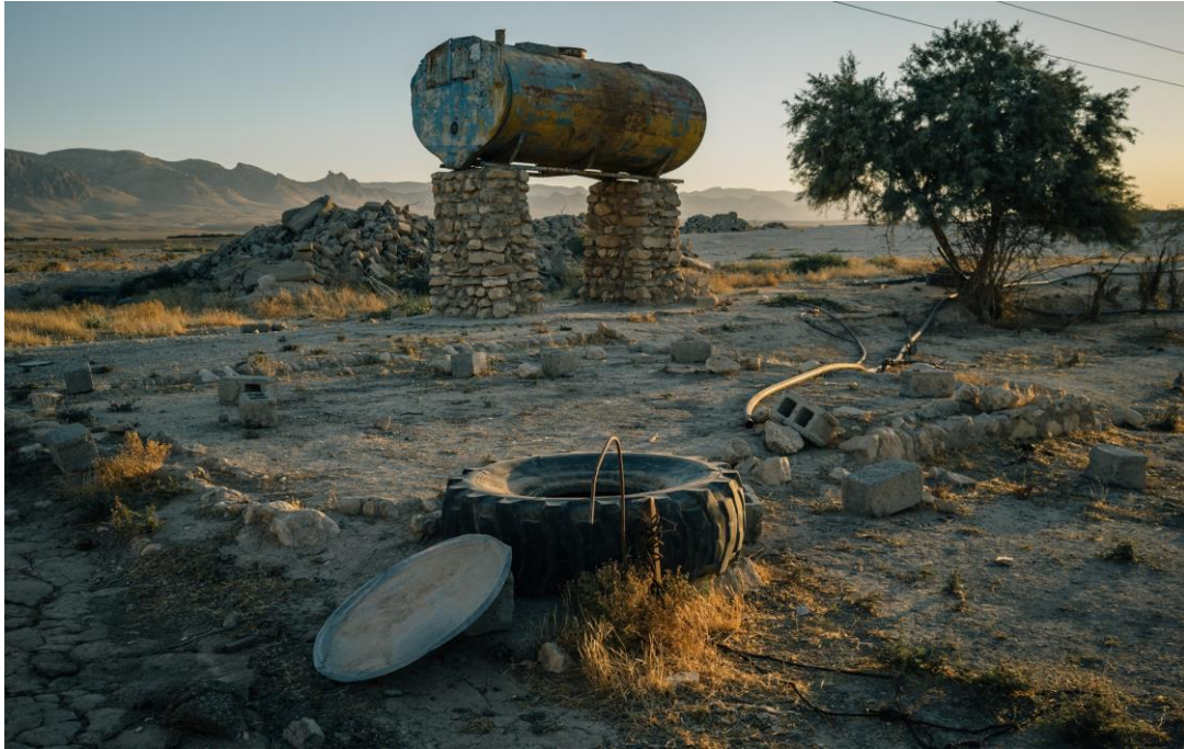
An empty water tank and a sabotaged irrigation well on an abandoned farm near Sinune town north of Sinjar mountain. A farmer from a neighbouring farm told Amnesty International that only five of the 10 families who used to live in the village pre-IS had returned.

Amnesty International visited an abandoned house in a small village just outside Sinune town to the north of Sinjar mountain. The nearby fields were barren. The entrance to the well was stained with oil, with oil stains also visible in and around ruptures in the black plastic irrigation pipe leading from the well. A large water tank near the well was empty and lengths of plastic irrigation pipes were nearby, broken and scattered. Another well on the same property was also destroyed, with rubble visible in the tube.