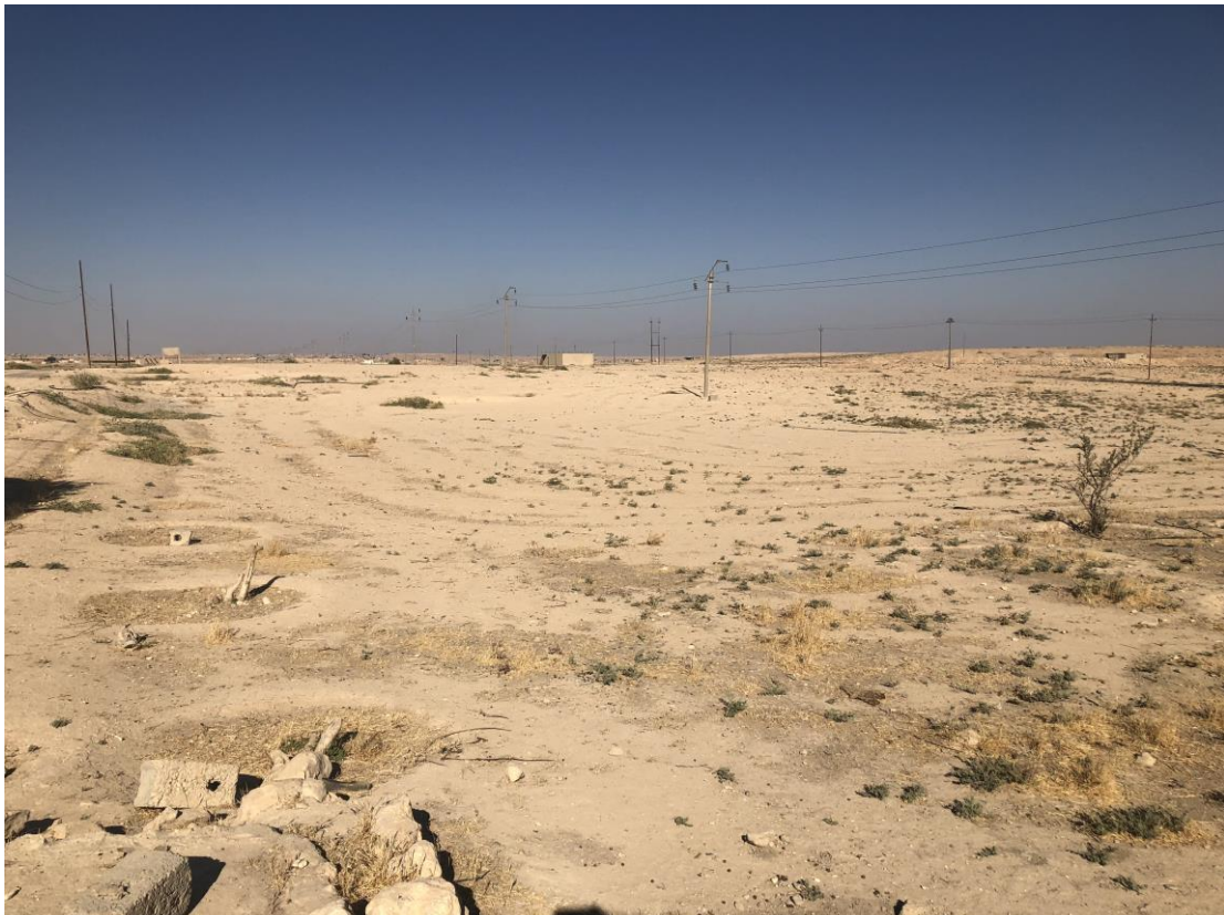
An abandoned farm just outside Sinune town north of Sinjar mountain. Before IS, farmers in the area grew olives, vegetables such as okra, tomatoes, onions, and cucumbers, as well as wheat.

To date, Iraq’s government has not begun to meaningfully address the full scale of destruction of agricultural livelihoods or implement plans to assist farmers to rebuild Iraq’s shattered land and the livelihoods it enables. As long as these areas lie in ruins, many hundreds of thousands of internally displaced people will be unable to return home. Even more will live in poverty. Given that some of these regions have been areas of discontent since 2003, there’s a real limit to how far Iraq’s recovery can sustainably progress without them.