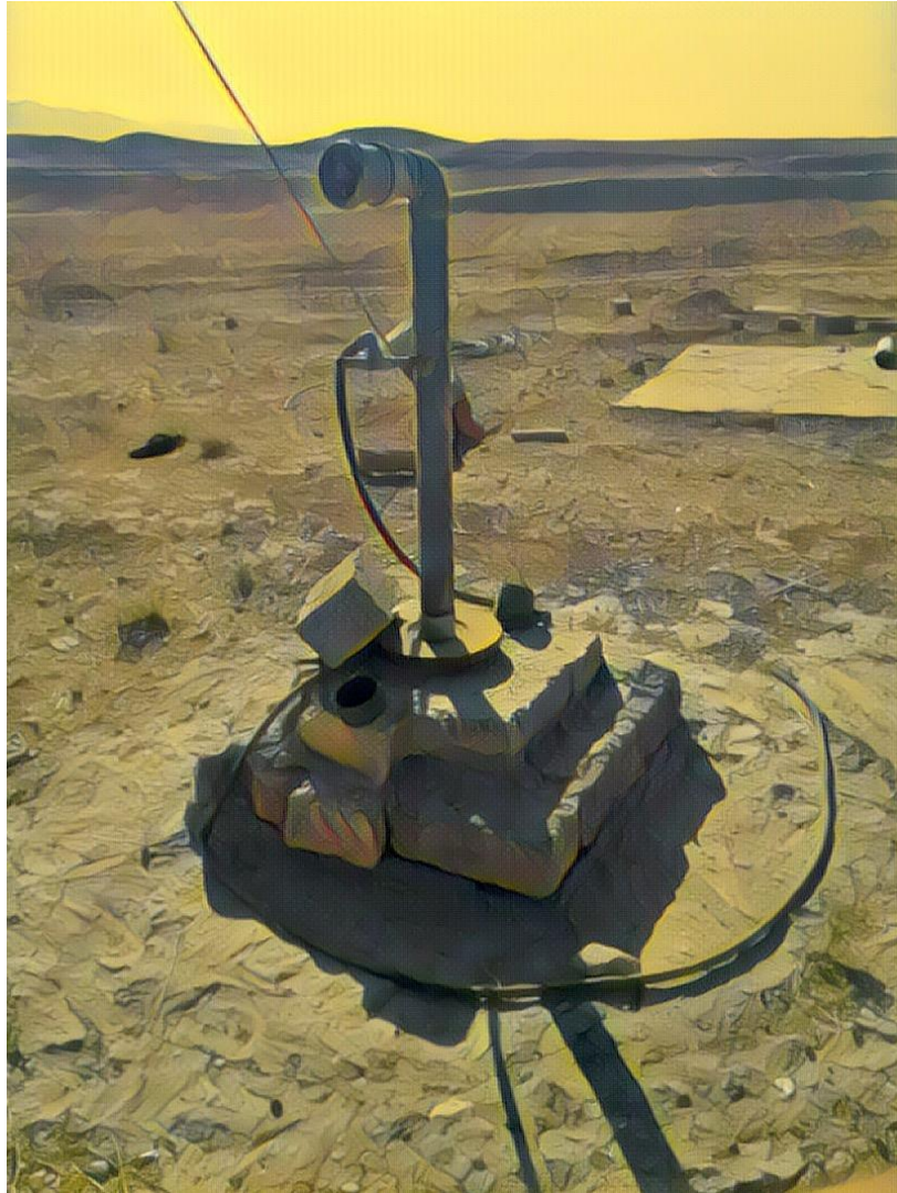
A typical irrigation well in Sinjar district in northern Iraq's Ninewa governorate - hundreds of these were sabotaged by IS fighters.

Iraq has experienced severe droughts in recent decades, particularly in 1998-1999 and 2007-2008. 35 It's gripped by one in 2018, so severe that the area under cultivation in 2018 is estimated by the Ministry of Agriculture at half what it was in 2017. 36 Over the long term, the situation is likely to deteriorate further. Scientific modelling of the effects of climate change on Iraq shows most regions of the country are likely to suffer a reduction in annual precipitation, especially by the end of the 21 st century. 37