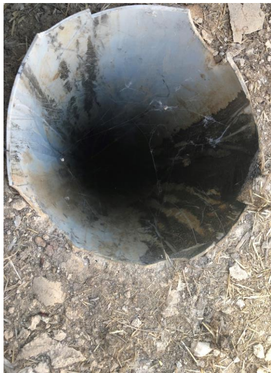
On the left: a sabotaged irrigation well on an abandoned farm just outside Sinune town north of Sinjar mountain. On the right: detail of a sabotaged irrigation well on an abandoned farm just outside Sinune town. The entrance to the well is stained with oil.