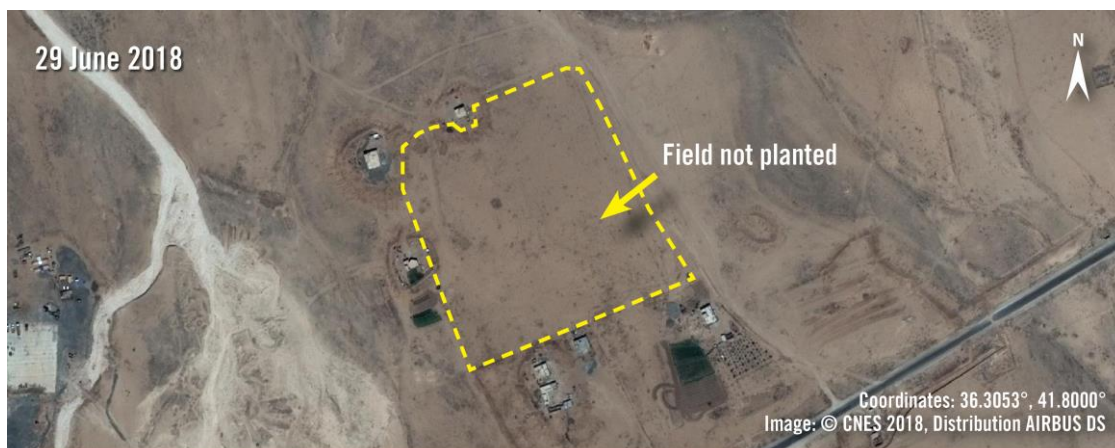
Imagery from 31 August 2014, 18 November 2015 and 29 June 2018, shows a farm approximately four km west of Sinjar. On 31 August 2014, IS had just entered the area. A pile of crop residue from a recent harvest is visible in the field. On 18 November 2015, imagery shows the field during the time when IS left the area. The lack of distinctive lines and a new road suggests the field had likely not been planted. On 29 June 2018, the field does not appear planted as typical in years before IS arrived.