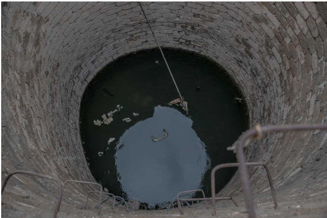
A sabotaged dug well from a small village south of Sinjar mountain. It used to belong to the cousin of Elias; when Elias returned concrete blocks and tyres were visible in the well.

When we left Sinjar [in August 2014] everything was ok and our water well was good. But when we liberated Sinjar and kicked out IS, we saw that all these wells were like this.