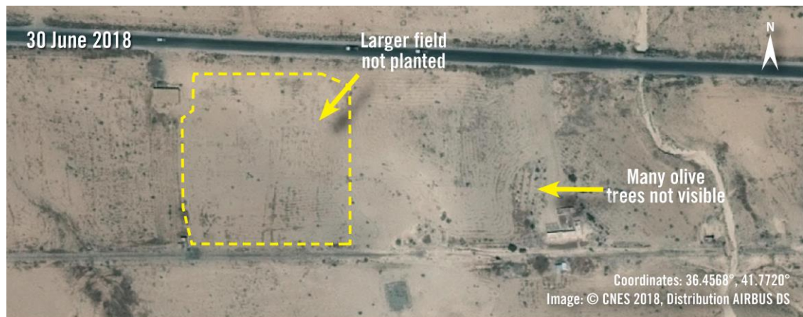
A farm north of Sinjar mountain is visible in imagery from 30 August 2014 and 30 June 2018. On 30 August 2014, after IS had taken over the area, crop lines are visible in fields around the farm. Though IS left this area in December 2014, on 30 June 2018, the entire area appears dry and there is no evidence of recent planting. Many of the olive trees are no longer visible.