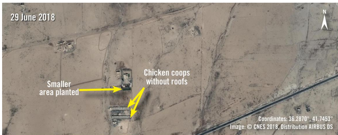
A farm approximately nine km west of Sinjar town can be seen in imagery from 31 August 2014, and 29 June 2018. On 31 August 2014, imagery shows the farm just after IS entered the area. Roofs are visible on the two chicken coops. The fields north of the chicken coops have crops visibly growing. In imagery from 29 June 2018, a small area of the field appears planted and the chicken coops are still without roofs.