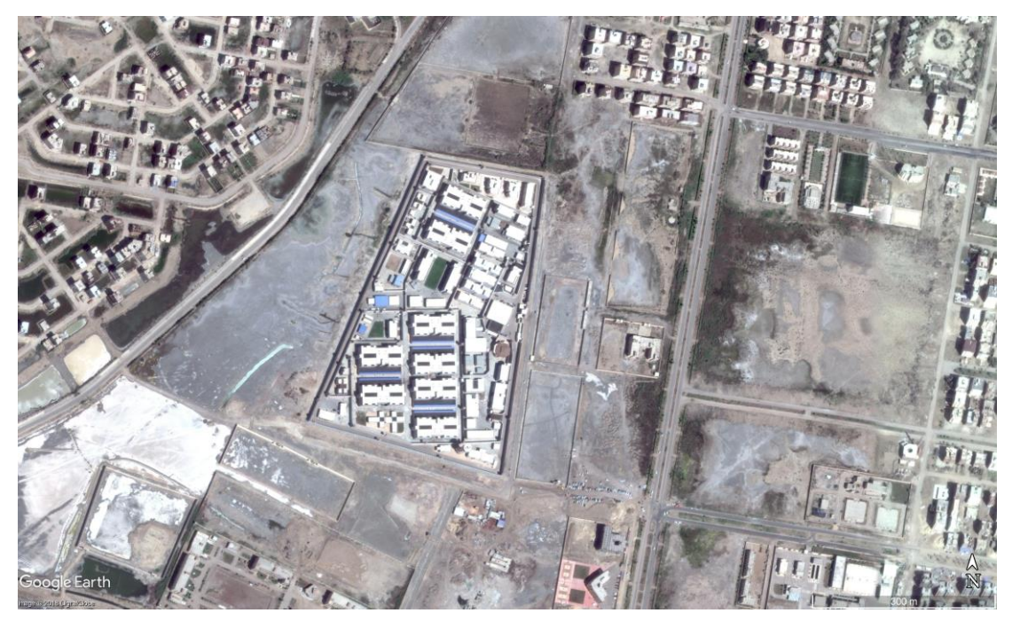
Gamasa Prison -© 2018 DigitalGlobe, Inc. Source: GoogleEarth