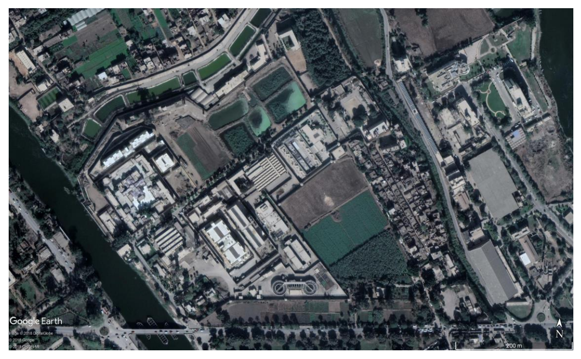
Al-Qanater Prison

the charges against them of belonging to the Muslim Brotherhood, led to their placement in solitary cells." ^{\rm 30}