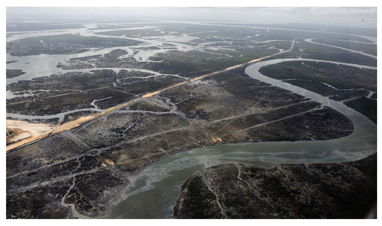
↑ Creeks and vegetation in the Niger Delta devastated as a result of oil pollution, March 2013 (∞)