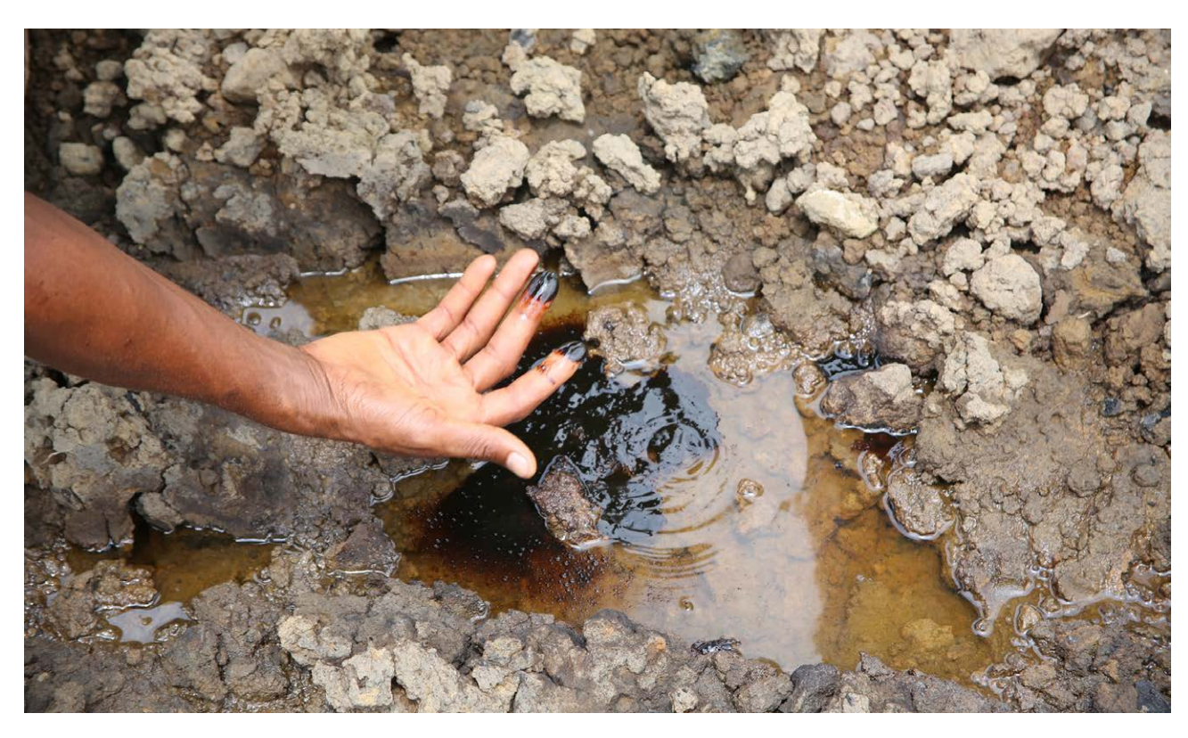
↑ Oil pollution around the Bomu Manifold, a Shell facility in Ogoniland, August 2015 (∞)