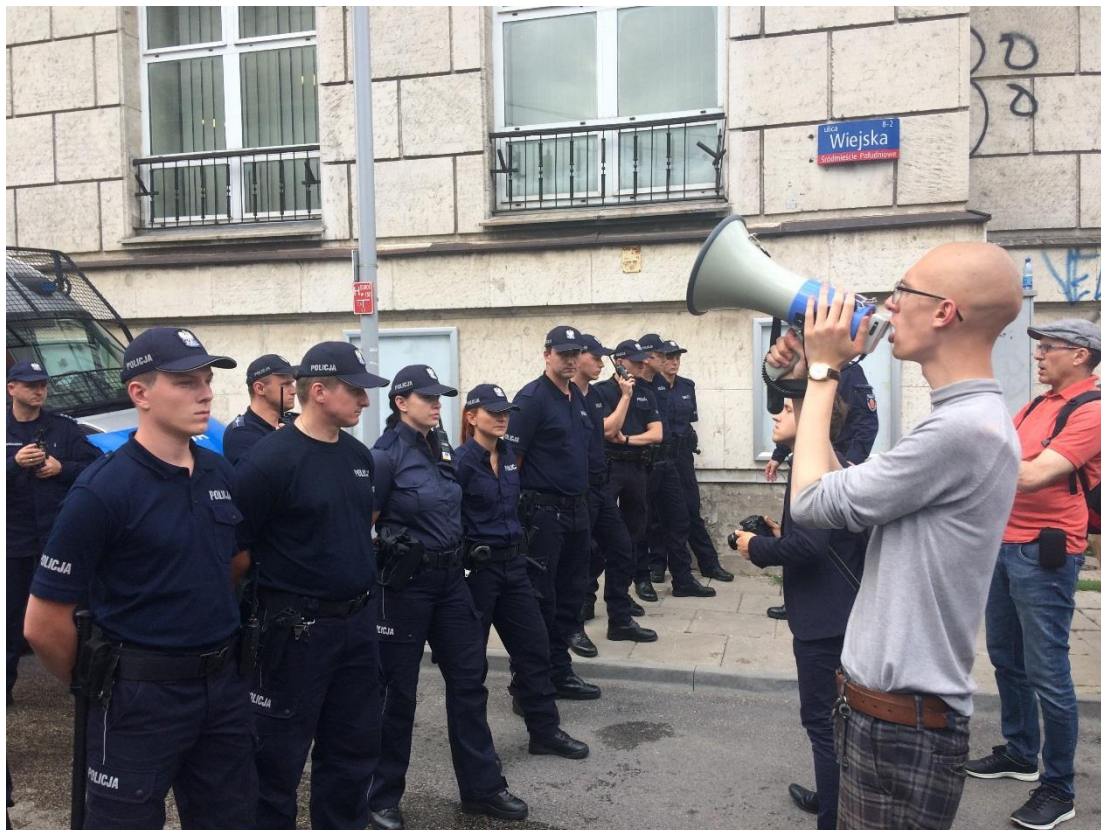
Police cordoned off an access road to the Parliament, Wiejska Street, at one end on 20 July 2017. Activists called on the police to release the protesters who were apprehended after they climbed through the fences separating the street from the area around Parliament.

An activist who did not participate in the protest and was standing on one of the exit roads taking pictures stated that the police physically assaulted her: “I was just standing there and one police officer grabbed me without any warning and pushed me against a traffic light post. He hit me in the face. I wasn’t resisting... After that, more police officers came to the site, they completely blocked Górnośląska Street and kettled me there.” 17 The police subsequently told the media that the activist did not have any evidence to support her allegations of police abuse. 18