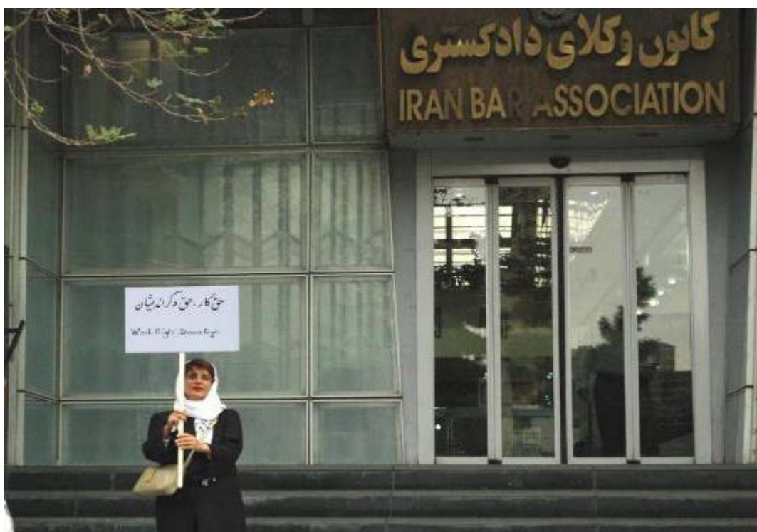
Human rights lawyer Nasrin Sotoudeh protesting outside the Iranian Bar Association