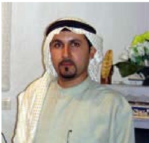
Rahman Asakereh, a minority rights activist from Iran's Ahwazi Arab minority