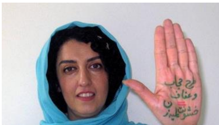
Narges Mohammadi with "compulsory hijab policy equals violence against women" written on her palm

The crackdown on women human rights defenders has also included harsh responses to women who oppose compulsory veiling ( hijab ), claiming women’s rights to freedom of belief and religion and freedom of expression. State media regularly use derogatory terms such as “sluts”, “deviant” and “corrupt” to demean and degrade these women.