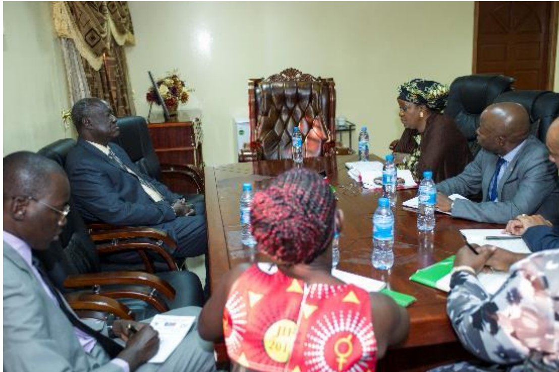
Zainab Hawa Bangura (top right), Special Representative of the Secretary-General on Sexual Violence in Conflict, meets with Kuol Manyang Juuk (top left), Minister of Defence of the Republic of South Sudan. Juba, South Sudan, 2014.