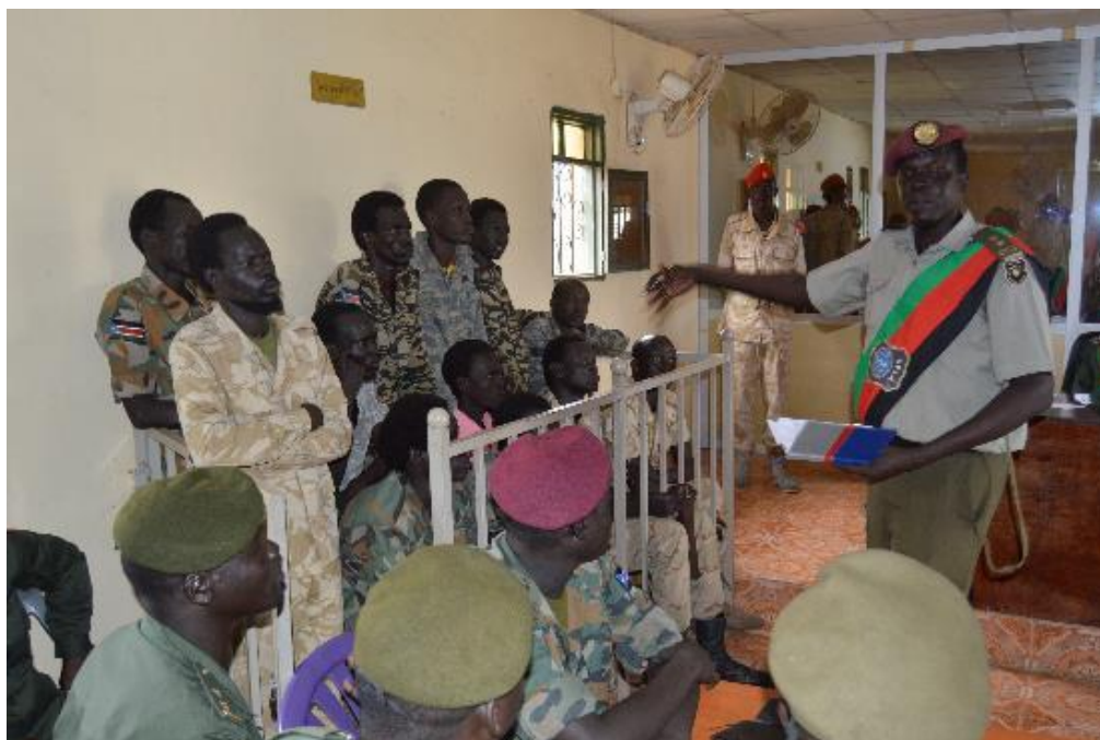
Preliminary hearing in a military court trial of government soldiers accused of rape, murder, and looting at the Terrain hotel in Juba, in July 2016. Juba, South Sudan, 30 May 2017.