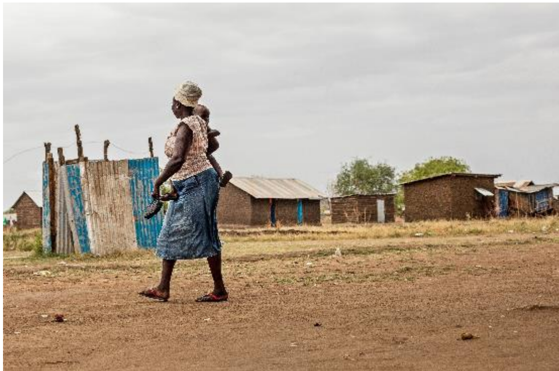
A woman walks with her baby in the Gudele area of Juba, South Sudan.

"... I am the same age as their mothers, but they still raped me... I feel humiliated and it has decreased my respect in the community because culturally in Nuer, a woman of my age can't have sex...I should be taking care of my grandsons and granddaughters." 290