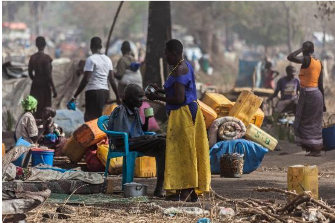
Palorinya refugee settlement in Moyo district, Uganda, 2017.

The conflict has taken an enormous toll on civilians, costing the lives of an unknown number of people. 22 Approximately 1.9 million South Sudanese are internally displaced, with over 200,000 living in camps – called Protection of Civilians (PoC) sites – protected by UN peacekeepers and on UNMISS bases. 23 Another 1.6 million people have fled their homes and sought safety in neighbouring countries as refugees. 24 An estimated 4.9 million people – more than 40% of the total population – are food insecure, and in February 2017, famine was declared in Leer and Mayandit counties. 25 Civilian access to humanitarian assistance is constrained by the ongoing fighting and by intentional obstruction of humanitarian access by parties to the conflict, particularly the government. 26