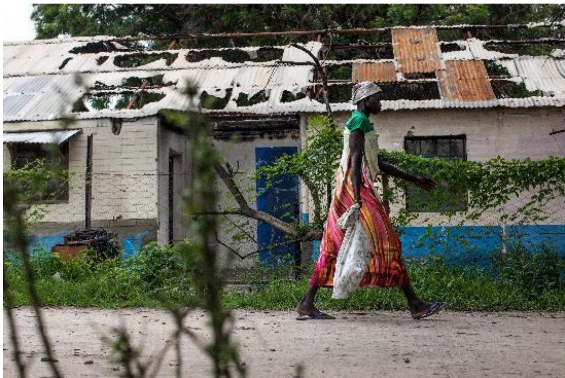
A woman walks on 7 July 2014 past one of the buildings of the Leer Hospital that was burned during the fighting. Hundreds of thousands of people were cut off from critical, lifesaving medical care after the Leer Hospital, run by Médecins Sans Frontières (MSF-Doctors Without Borders), was ransacked and destroyed between the final days of January and early February.

South Sudan, with support from international donors, must take steps to increase the availability, accessibility and quality of mental health services for survivors of sexual violence.