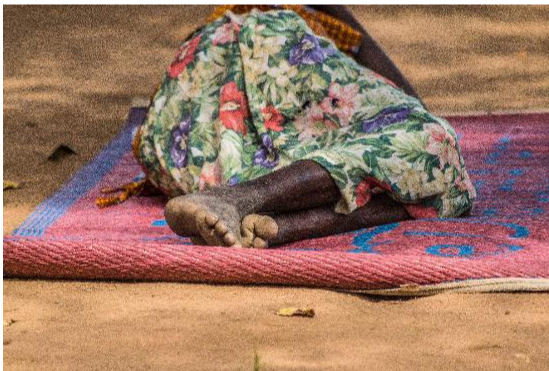
An elderly woman sleeps outside a health centre in Bidibidi refugee settlement, Yumbe district, Uganda, 2016.