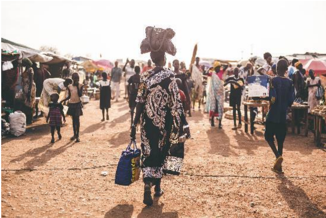
A woman carrying luggage on her head walks through the Protection of Civilians site in Juba, South Sudan.

Most of the cases investigated for this report involved rape or gang rape of women and girls, which often lasted for hours and left victims with serious injuries – both physical and psychological. Some rapists aggravated their crimes by other acts of cruelty, such as mutilating victims with knives or raping them with objects such as sticks. Some killed their victims outright while others left them bleeding, seemingly indifferent to whether they lived or died. Elderly women, young girls, and pregnant women have not been spared.