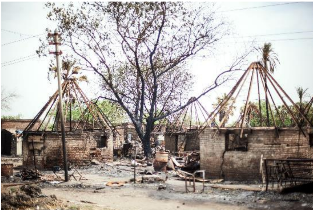
Burned down houses behind Malakal Teaching Hospital, South Sudan, 2014.

Fighting first erupted in Malakal on 24 December 2013. Following heavy clashes, SPLA-IO forces, including members of the White Army, took control by the next day. Malakal town subsequently changed hands another five times, before falling under government control on 19 March. As elsewhere, the early fighting in Malakal was brutal, and involved killings of civilians, extensive looting and destruction of civilian property, as well as sexual violence, particularly gang rape. 91 The examples of sexual violence below all took place before the end of December 2013.