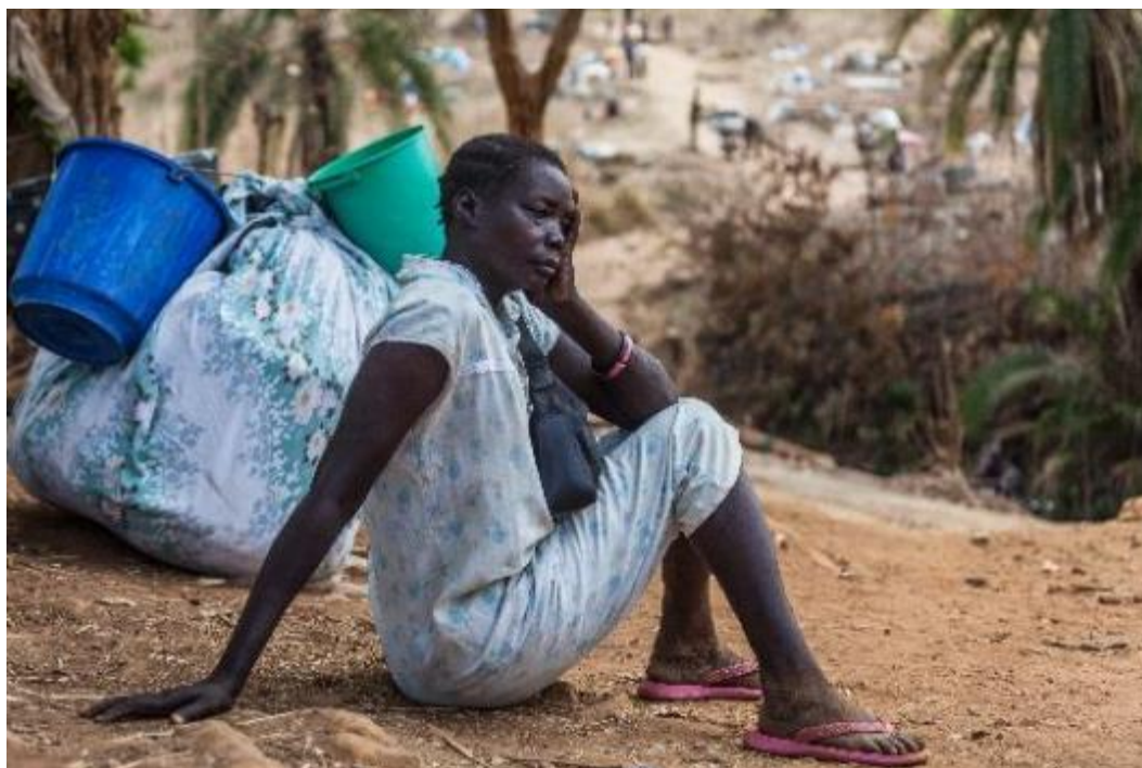
A woman rests next to her luggage before crossing Kaya stream near Afoji town, Moyo district, northern Uganda.

Attacks between government and opposition forces have resulted in the mass displacement of civilians and emptied entire towns and villages in Yei, Lainya, Kajo Keji, Morobo and other towns close to the Uganda and Democratic Republic of Congo border. 162 In December 2016, the Commission for Human Rights in South Sudan said that there was already a steady process of ethnic cleansing under way 163 and that the Equatoria region had become the epicentre of conflict. 164 Uganda is hosting over 900,000 South Sudanese refugees, out of the 1.5 million being hosted within the region. Thousands of refugees continue to cross the border into Uganda each day – in March 2017, the average number of new arrivals was 2,800 per day. 165 Refugees in northern Uganda who had fled Central Equatoria described to researchers for this report acts of sexual violence perpetrated both by government forces as well as by the opposition.