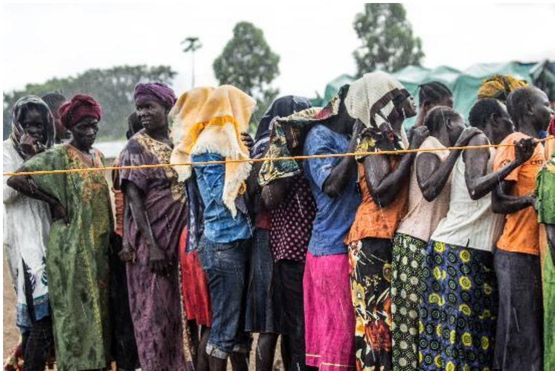
A group of women stand in the rain waiting to be registered and receive their refugee status at Kuluba collection point, Arua district, northern Uganda.

Both the incidents that occurred during the second civil war and the endemic levels of sexual violence during the current conflict can only be fully understood when placed in the longer-term context of gender dynamics within South Sudanese society. Sexual violence is facilitated by the overall status of women and girls in South Sudanese society as subordinate to men, and the resulting discrimination that they experience in their everyday lives. It is also motivated by patriarchal structures and gendered concepts of power which position men as “protectors” of women.