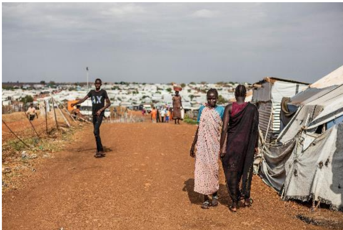
Women on arrival at the Protection of Civilians site 3 in Juba, South Sudan.

“We went together with the peacekeepers in a UN vehicle to pick her up. She died after four days as a result of her injuries while undergoing treatment in the IMC hospital.” 145