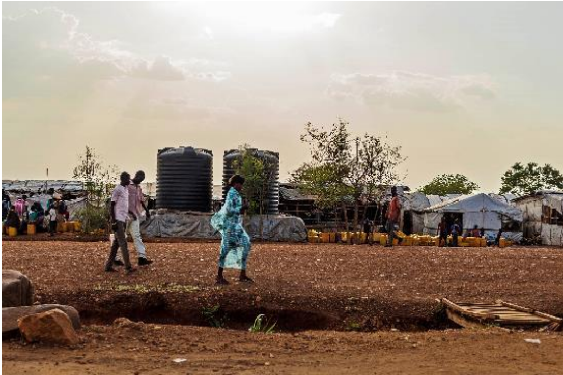
People walk through the Protection of Civilians site 3 in Juba, South Sudan.

The fighting that occurred between government and SPLA-IO forces in Juba between 8 and 11 July was marked by serious violations and abuses of international human rights law and international humanitarian law. Government soldiers deliberately killed civilians, fired indiscriminately in civilian neighbourhoods and around UN bases and PoC sites, and engaged in a massive campaign of looting civilian and humanitarian property. During the July 2016 violence in Juba, the government and SPLA-IO forces committed acts of sexual violence against women and girls. Most cases of sexual violence were committed by government soldiers, police officers and members of the National Security Services (NSS), particularly at checkpoints and during house-to-house searches. 135 In one highly publicized case, government soldiers raped and gang raped at least seven women, including foreign humanitarian workers, during an 11 July attack on the Terrain hotel in the Jebel neighbourhood. 136