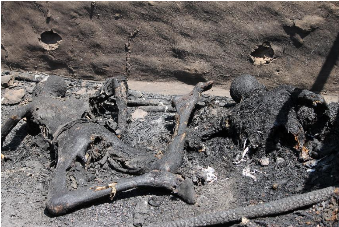
Burned bodies of civilians killed outside Yei, South Sudan, November 2016

that the soldiers would catch me and do the same to me. The following morning, I went to his burnt-out home and found his bones. Three other neighbours were also shot dead. The soldiers also took some animals with them, several goats and other animals.” 15