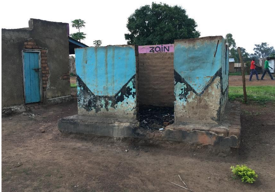
Burnt house in the Gigomoni neighborhood of Yei, June 2017

The violence and insecurity – with residents at risk of attacks in their homes, in their fields, in markets, on roads - have forcibly displaced close to a million people from their homes in the Equatoria region and disrupted food cultivation and trade to such an extent that, in the space of a year, the food-rich region which could feed millions has become a place where even the small percentage of inhabitants who remain are facing acute hunger and malnutrition.