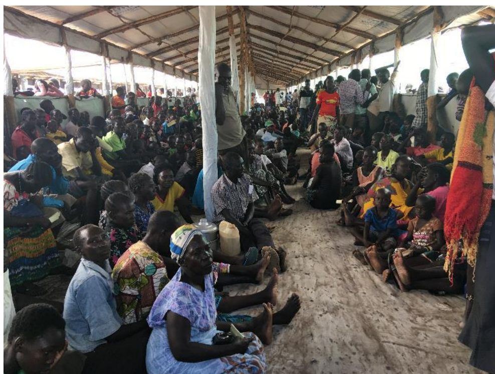
Recently arrived refugees from the Equatoria region waiting to be registered at a refugee centre in northern Uganda, June 2017

Government and opposition forces in South Sudan's Equatoria region, have committed war crimes and widespread and serious human rights abuses against civilians. 1 Men, women and children have been shot, hacked to death with machetes and burned alive in their homes. Women and girls have been gang-raped, some after having been abducted. Homes, schools, medical facilities and humanitarian organizations' compounds have been looted, vandalized and burned down. 2 Such atrocities have already forcibly displaced hundreds of thousands of the region's inhabitants, and are continuing. Many of the displaced have fled the country and are now living as refugees in neighbouring Uganda and the Democratic Republic of the Congo (DRC). Others are internally displaced within the region, living in fear of the ongoing violence and in dire humanitarian conditions. Both government and opposition forces have used food as a weapon of war, denying civilians access to food as a means to control their movement or force them out of their homes and off their land. As a result, in a region previously considered as South Sudan's breadbasket, the remaining population faces acute food shortages and increasing malnutrition.