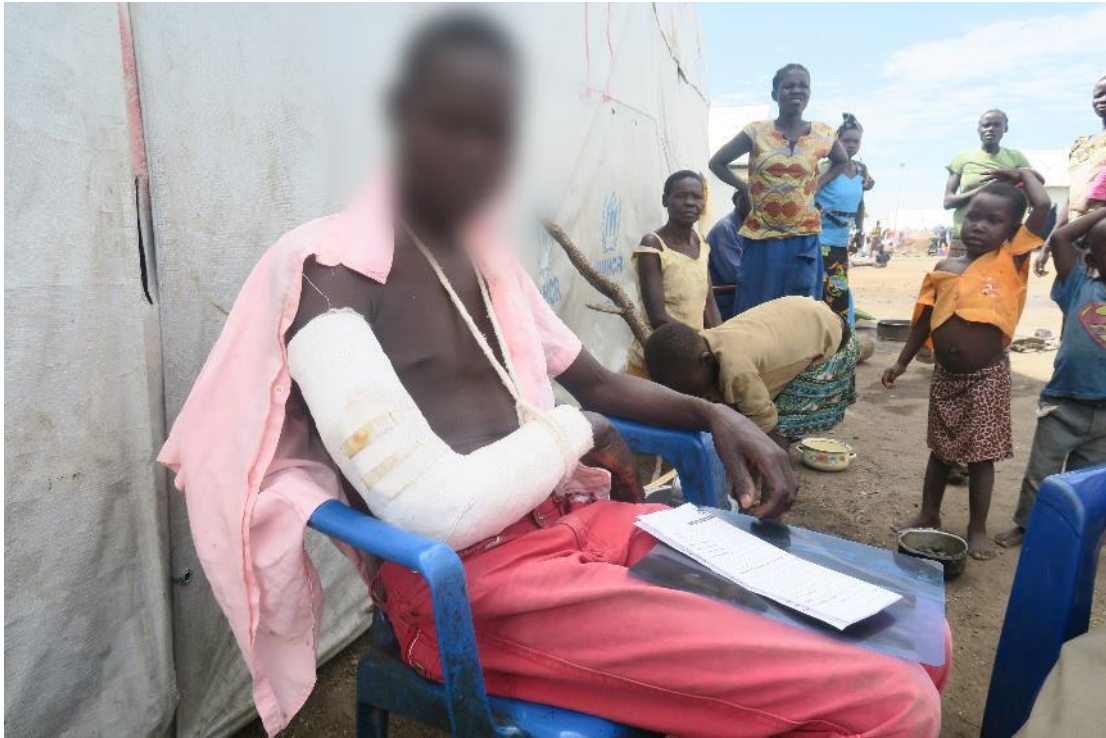
Man wounded in a market shooting on the 15 of May 2017 in Payawa, south-east of Yei