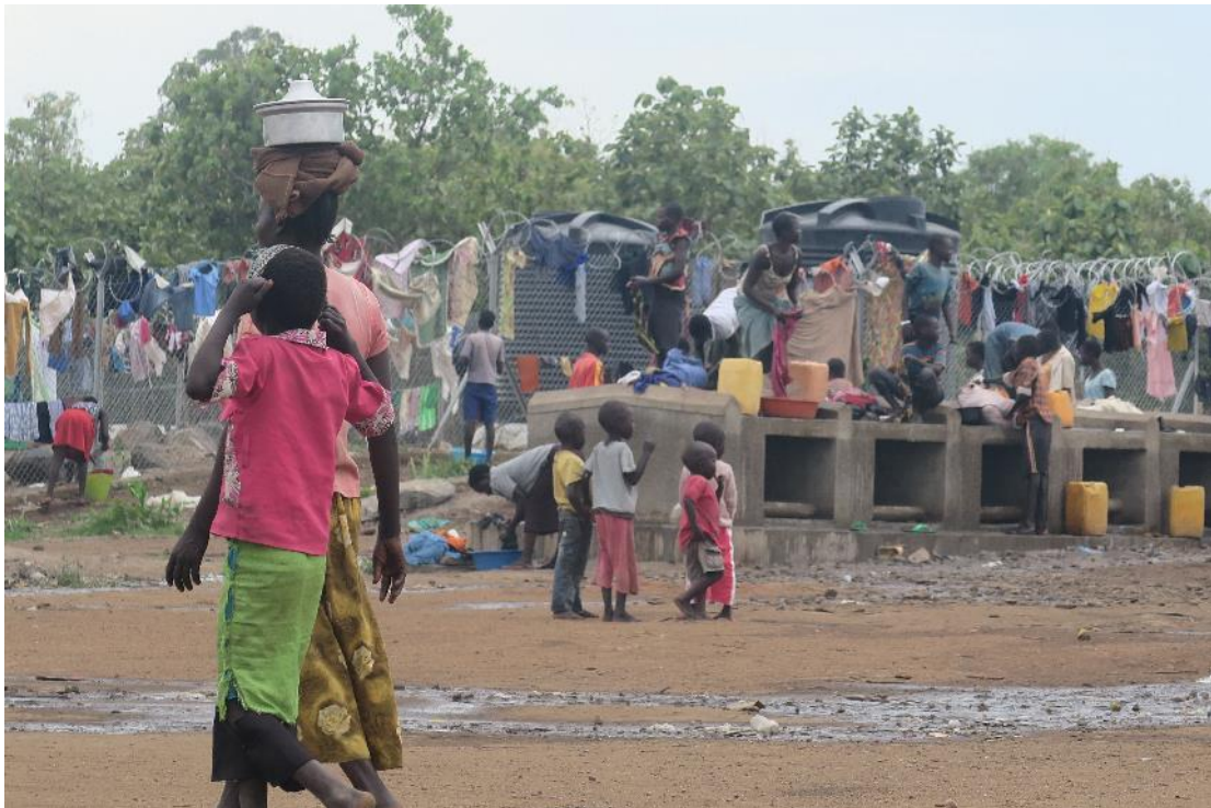
Refugees from Equatoria region of South Sudan in northern Uganda, June 2017