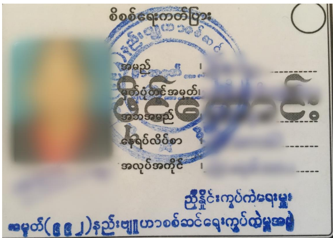
☺↑ A special identification card issued by Myanmar authorities in early 2017 to residents of villages between Pang Hseng and Monekoe towns. Anyone caught outside a camp or home without the identification card faced arrest and detention by the Myanmar security forces.

A Myanmar expert said that the ordered or de facto clearance of villages, and the pressure on local communities more generally, represented a continuation of abusive counterinsurgency tactics that the Myanmar Army has deployed for decades. 173 The impact these tactics have in terms of depriving people of their livelihoods are compounded by the restrictions on humanitarian access, discussed in detail below, and have dangerous medium- and long-term implications on people’s standard of living, including access to adequate food and their physical and mental health. 174