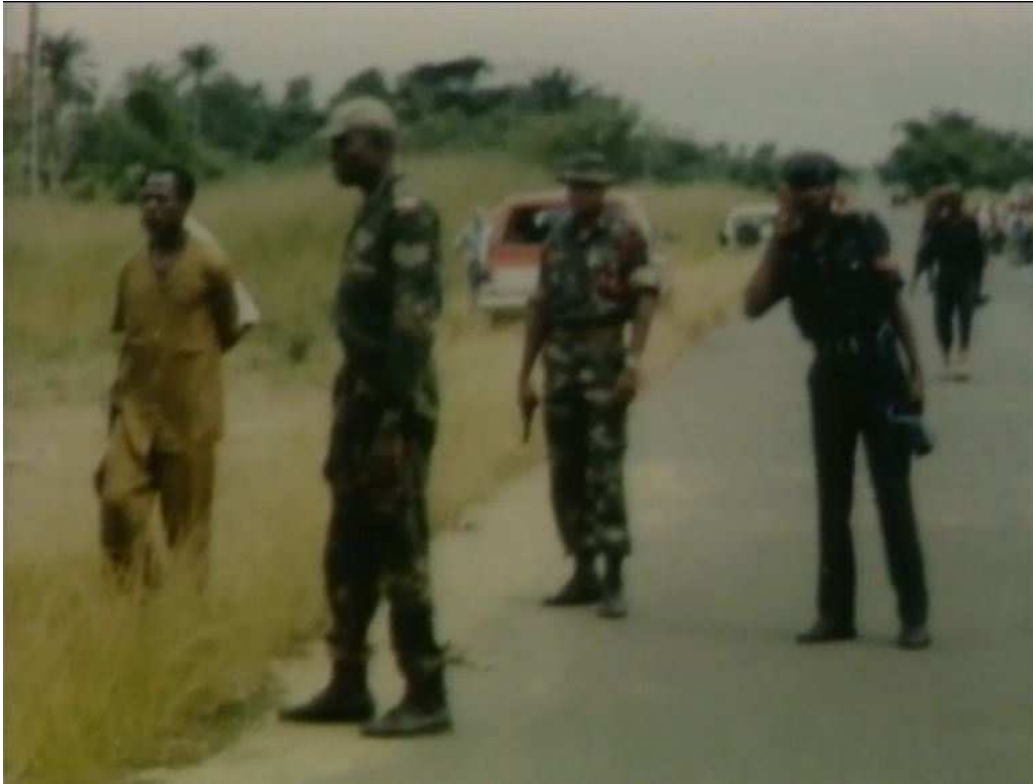
Soldiers in Ogoniland, 1993, ©private.