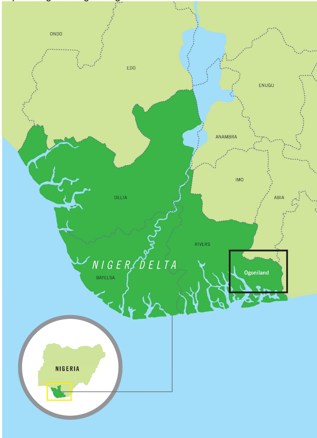
Map of the Niger Delta region in Nigeria