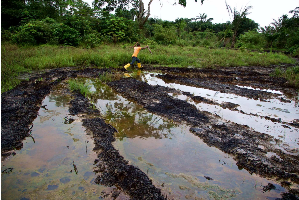
Contaminated waters at the Barabeedom swamp, Ogoniland, September 2015.

MOSOP protested against the environmental damage caused by Shells operations. In 2011 a scientific study carried out by the United Nations Environment Programme (UNEP) exposed an appalling level of pollution, including the contamination of agricultural land and fisheries, the contamination of drinking water, and the exposure of hundreds of thousands of people to serious health risks. 14 Six years on little has been done to address UNEP's recommendations. 15