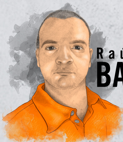
Raúl Emilio BADUEL

This can clearly be seen in the action of the courts and the staff of the Public Prosecutor's Office, such as, for example, temporarily halting the regular activities of the court in charge of the case; detaining people immediately following speeches by senior Venezuelan government officials indicating that a crime has been committed; and the lack of reasons given for some measures such as transfers and pre-trial detention, among others.