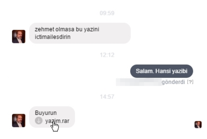
Screnshot of the Facebook Conversation

As a result of this compromise, the attackers had access to Kanal 13's communications for a little over a week. documenting the internal operations of Kanal 13 and the individual's private life. Kanal 13 journalists subsequently faced prosecution over their reporting. Though there is no suggestion that the malware attack and the later prosecution are related, it is interesting to note that this attack also fits the pattern whereby targets of the malware attacks also face legal problems with the authorities.