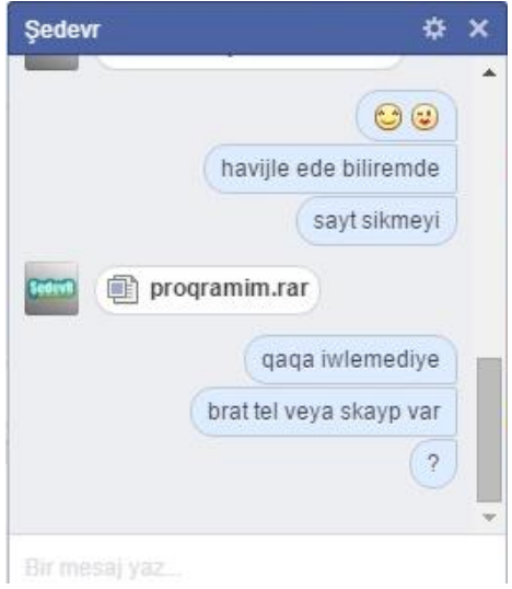
Screnshot of the Facebook Conversation

In two cases, Amnesty International were able to identify the targets of attacks because screenshots of the attackers contacting the targets via Facebook messenger were later dumped in a public location.