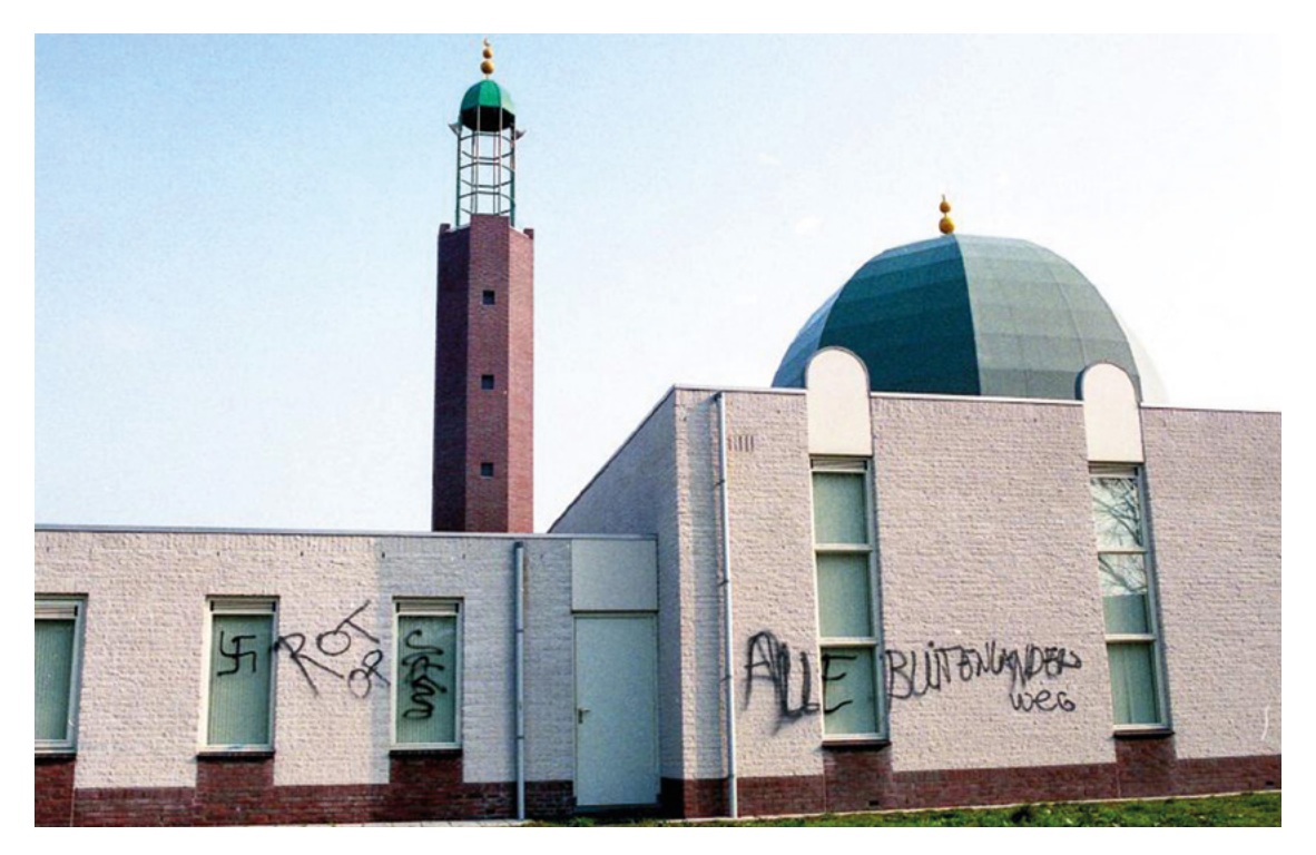
Racist slurs on the walls of a mosque in the Netherlands, 1992.

Any incident with a potential discriminatory motivation should prompt a thorough and effective investigation with a focus on uncovering the underlying motive. In practice, however, hate crimes are often not appropriately recorded and investigated by police. As pointed out by Amnesty International research, for instance on Bulgaria, hate crimes are often not registered and the authorities regularly fail to launch an investigation. When an incident is investigated, the discriminatory motive is often not taken into account, and the incident is processed as the offence of hooliganism instead. Reasons for this might be that the evidence required to establish hooliganism is easier to obtain, and that hate crime laws are relatively new with officials lacking experience and training in the matter.<sup>84</sup> Similarly in Ukraine, police are reluctant to investigate homophobic or transphobic hate crimes as such, and incidents are often processed either as ordinary crimes or as hooliganism without considering the underlying motive.<sup>85</sup> The investigation opened after the 2015 Kyiv Pride, for example, qualified the violence that occurred during the event as hooliganism.<sup>86</sup>