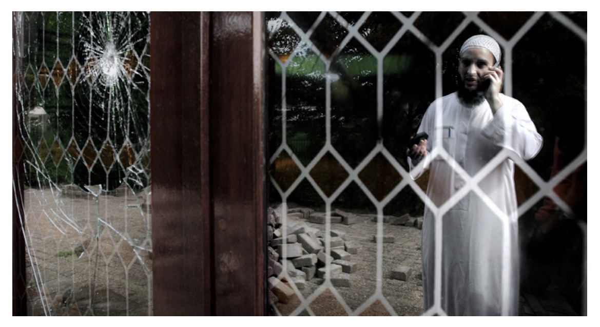
Board member of the Al Muhsinin mosque in Haarlem (The Netherlands) in front of a smashed window at the mosque, 2007.

Once a potential hate crime is reported, the victim should be afforded all necessary information about available support services, as well as regular updates on the status of the investigation and adequate protection if necessary.