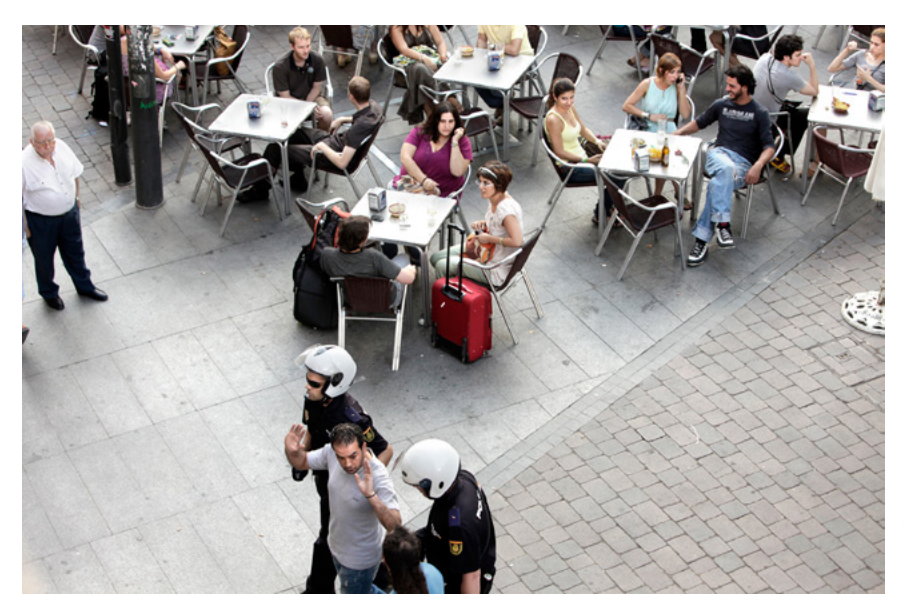
Police arrest a migrant in the square of Tirso de Molina in Madrid (Spain), 2010.

The Swedish Aliens Act, for example, provides that a person cannot be stopped or checked solely on account of his or her skin colour, name, language or other similar characteristic.<sup>112</sup>