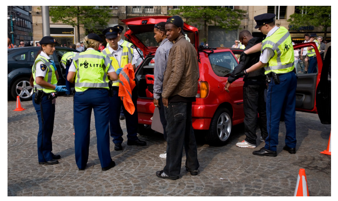
Police stop and search individuals belonging to ethnic minorities in Amsterdam (The Netherlands), 2008.

The "Best Use of Stop and Search Scheme", to which every police agency in England and Wales has committed itself, introduces various measures to increase transparency and community involvement in stops and searches. Besides detailed recording of stops, the scheme also introduces 'lay observation', which provides members of the public with the possibility to accompany police officers to observe stops and searches and provide feedback to the officers. It further requires forces to adopt a complaint policy that requires police to explain to local community scrutiny groups how they use their powers, in case of a large number of complaints and/or of particularly serious complaints.<sup>121</sup>