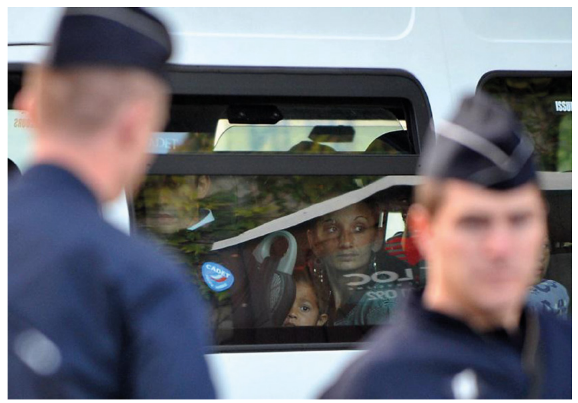
Deportation of Roma from France, 2010.

Discriminatory behaviour by law enforcement officials can be caused by a variety of factors. In some cases, a lack of adequate legislation or procedures certainly plays a role in how the police interact with members of minority groups. However, such legal or procedural gaps cannot justify discriminatory conduct. And often they are not the (sole) reason for police acting in a certain way. In many cases, discriminatory actions can be traced back to a stereotyped attitude or a lack of knowledge of how to interact with certain groups, in particular relating to cultural or linguistic differences, and/or unfamiliarity with their needs or behaviour. It might also be caused by a wrong perception, based on personal experience or prejudice, of certain groups as a threat which leads to a response which has not been consciously thought out. Such biased attitudes are often not unique to individual officers, but are seemingly shared by a large number or sometimes even the majority of officers.