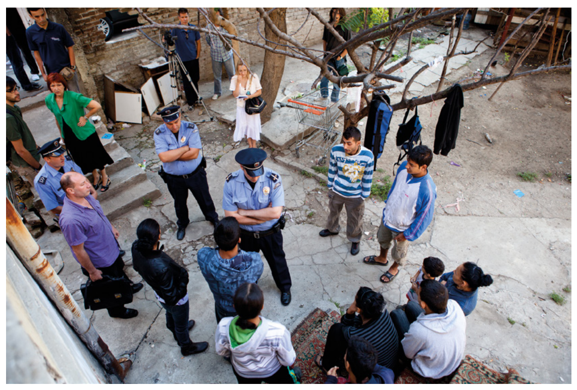
Roma and police during a forced eviction in Belgrade (Serbia), 2011.

The Procedure further includes a "Guide to Gypsy and Traveller Customs" consisting of a list of considerations that police officers should keep in mind during interactions with members of these communities. It should be stressed that all such guidance should be drafted with full and effective participation of community representatives.