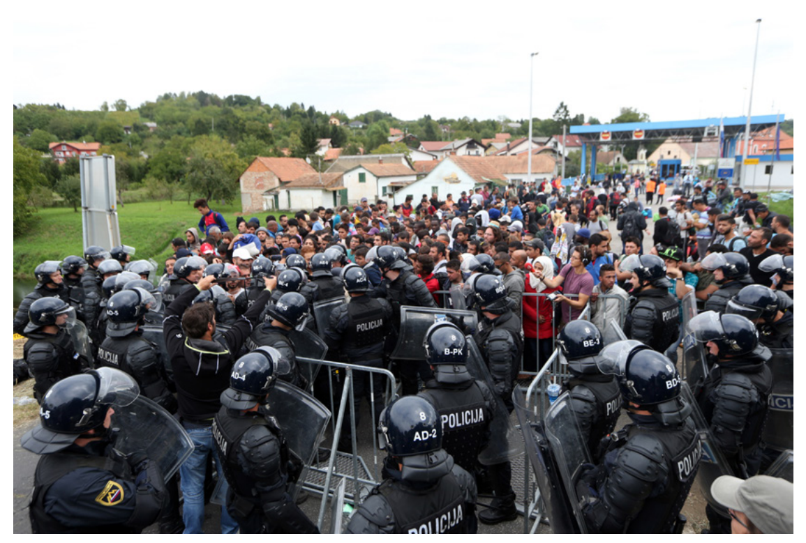
Slovenian police and migrants at the Slovenia-Croatia border in Rigonce (Slovenia), 2015.

Border police, should have clearly established criteria on how and when force can legitimately be used, including during return operations.