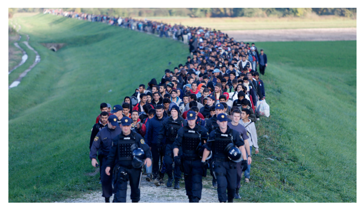
Migrants are escorted by police as they make their way on foot on the outskirts of Brezice, Slovenia, 2015.

As was pointed out by the European Ombudsman, the provisions on the use of coercive measures should further include a requirement that the use of coercive measures should take appropriate account of the individual circumstances of each person such as their vulnerable condition.<sup>147</sup>