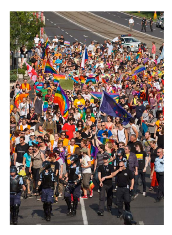
Rainbow Pride Parade Bratislava (Slovakia), 2011.

Pride marches are examples of occasions when police are under the obligation to protect, not only during the march itself, but as well before and after the event. Failure to effectively protect Pride events can sometimes be a result of negative attitudes of police and police management. When a bus with Pride participants was attacked in Moldova in 2008, for example, the police did not interfere, according to the Ministry of Interior to avoid being seen as "gay friendly".<sup>59</sup> In 2014 and 2015, however, Moldovan police were very efficient in protecting the participants from counter protestors with heavy presence, efficient equipment and actions.<sup>60</sup>