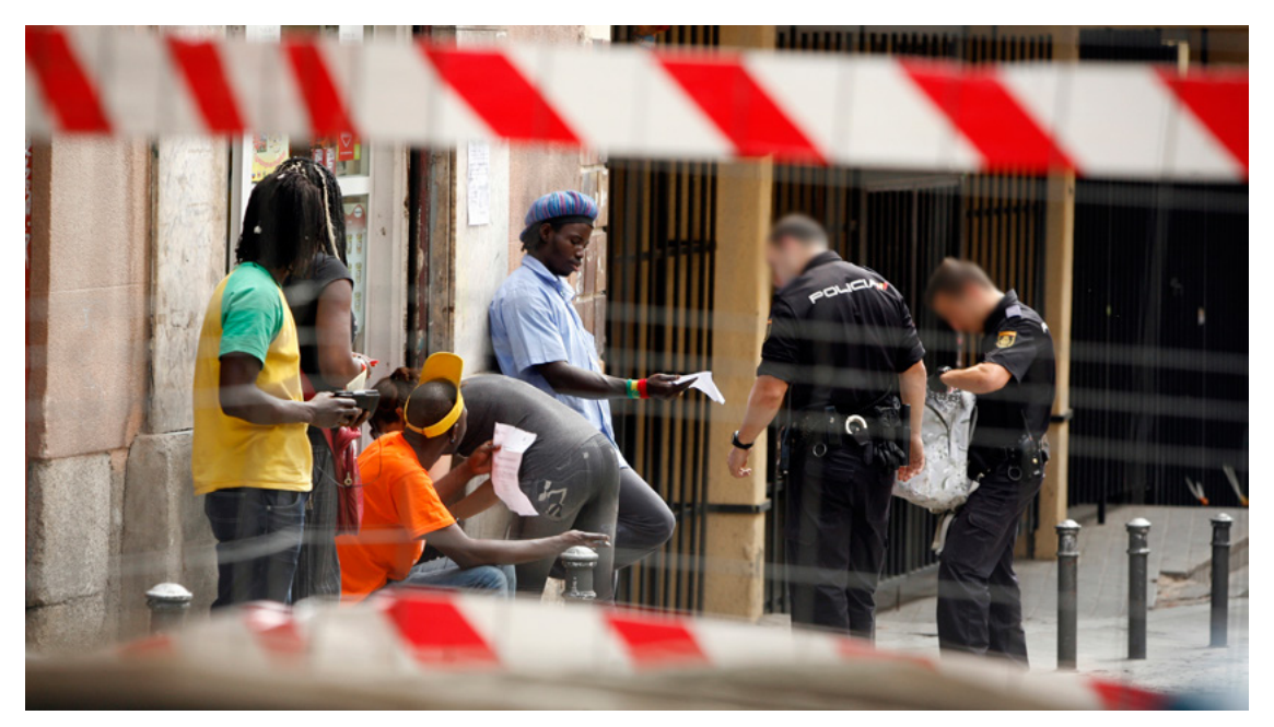
Police officers check documents of men belonging to ethnic minorities in the neighbourhood of Lavapiés, Madrid (Spain), 2010.