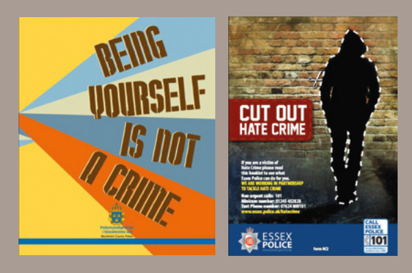
"Cut Out Hate Crime" leaflet of the Essex Police (United Kingdom), Form HC2, 2012, and the "Being yourself is not a Crime" leaflet of Stockholm County Police (Sweden), n.d. Screenshots taken in February 2016.

A number of law enforcement agencies have reached out to victims, by means of leaflets, to encourage reporting.<sup>76</sup>