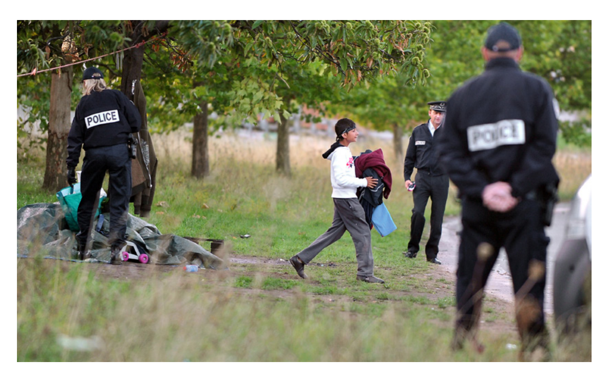
Police and member of the Roma community in France, 2010.

In order to address discriminatory police behaviour effectively and develop targeted measures to counter the problem, it is first necessary to identify what are the issues at hand. In many cases, however, comprehensive data on discriminatory police practices is absent. There are a variety of reasons for this and probably involves a combination of different factors, such as a lack of recording procedures, refusal by police to admit certain practices and the absence of statistical data collection systems. Further, as will be discussed in more detail in the following sections, incidents are commonly underreported as members of minority groups are often reluctant to approach the police or complain about police behaviour. Available data can thus only be considered to be the tip of the iceberg. This can make it difficult to capture and comprehend the full extent of the issues at hand, and might be used by police as an argument that discrimination is not an issue, or is limited to isolated incidents.