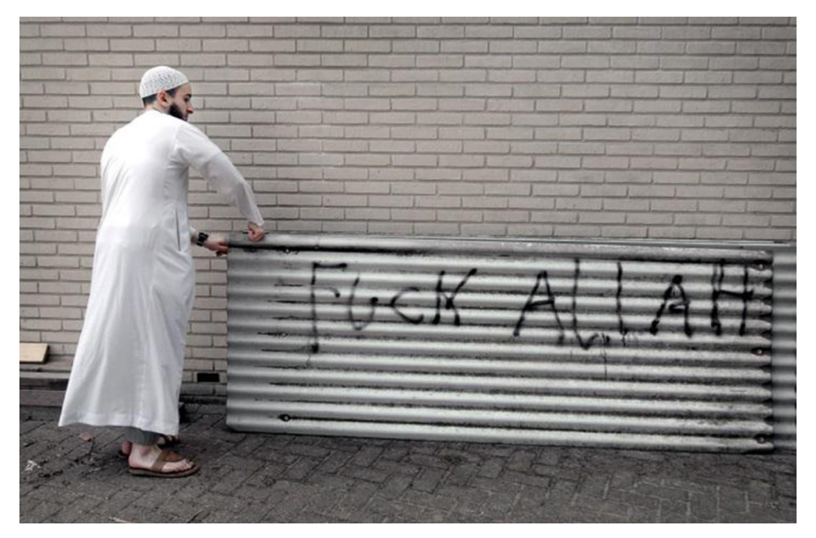
Board member of the Al Muhsinin mosque in Haarlem (The Netherlands) moves a corrugated sheet which has "Fuck Allah" written onto it, 2007.

There is no universally accepted definition of a "hate crime". Amnesty International generally understands the term to apply to acts against people or property, which are crimes under domestic law (and whose criminalization is consistent with international human rights law and standards), where the victim or target of the offence is selected because of their real or perceived connection to or membership in a group defined by a protected ground, including, but not limited to: race, ethnicity, language, national or social origin, sex/gender, indigenous status, descent, religion or belief, immigration status, disability, sexual orientation or gender identity.<sup>50</sup>