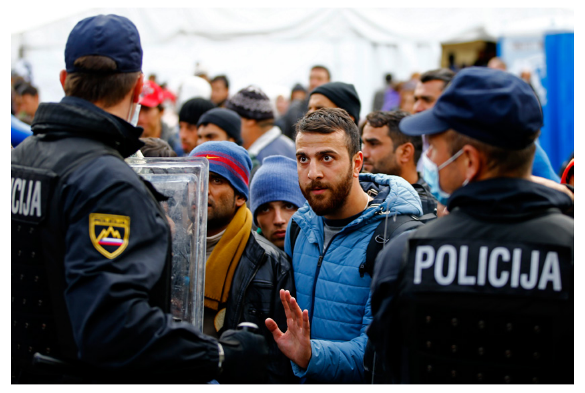
Migrant talking to Slovenian police officers at the exit of a makeshift camp near the Austrian border, 2015.

Besides violating the rights of the individuals at hand in the specific situation, the effect that incidents of heavy handed policing and excessive or unnecessary use of force have on members of minority groups and their communities can be more extensively damaging, by deepening the mistrust in and enmity towards the law enforcement agency that the affected communities may already have as a result of negative experiences in the past.<sup>135</sup>