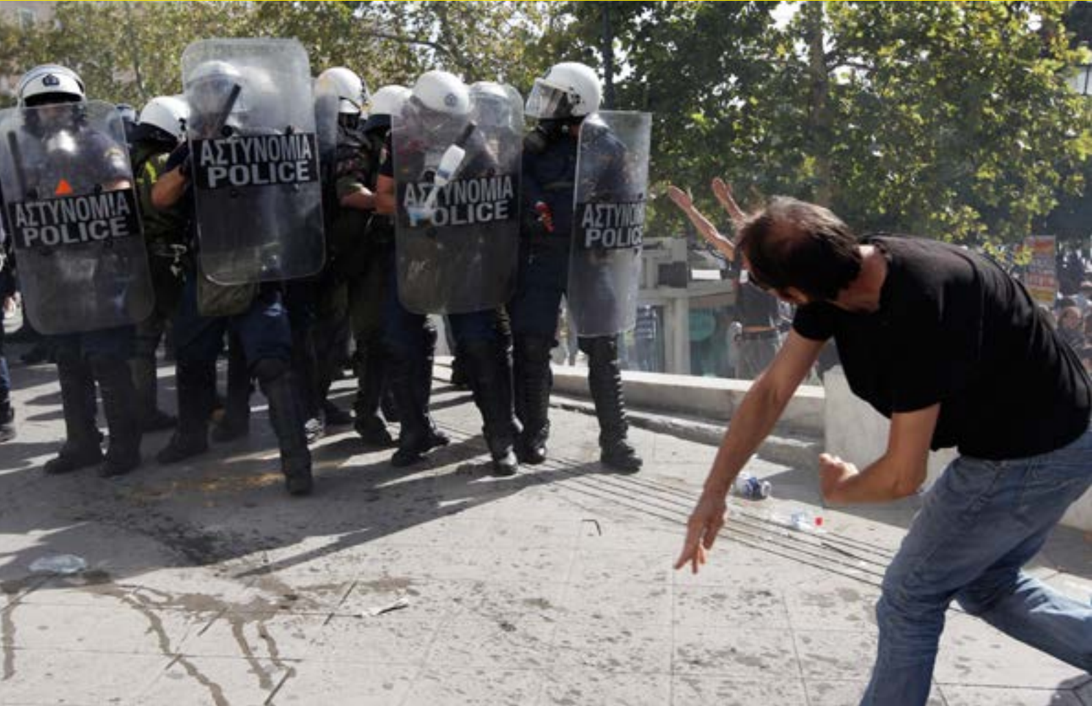
Protestor throwing a bottle at police, Athens, Greece 2012