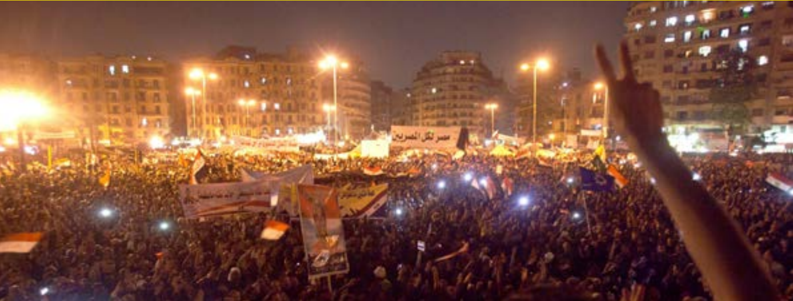
Large demonstration at Tahrir Square, Cairo, Egypt, November 2012

timeframe set by the overall speed of social media, given that police must ensure that their reaction is accurate based on confirmed information.