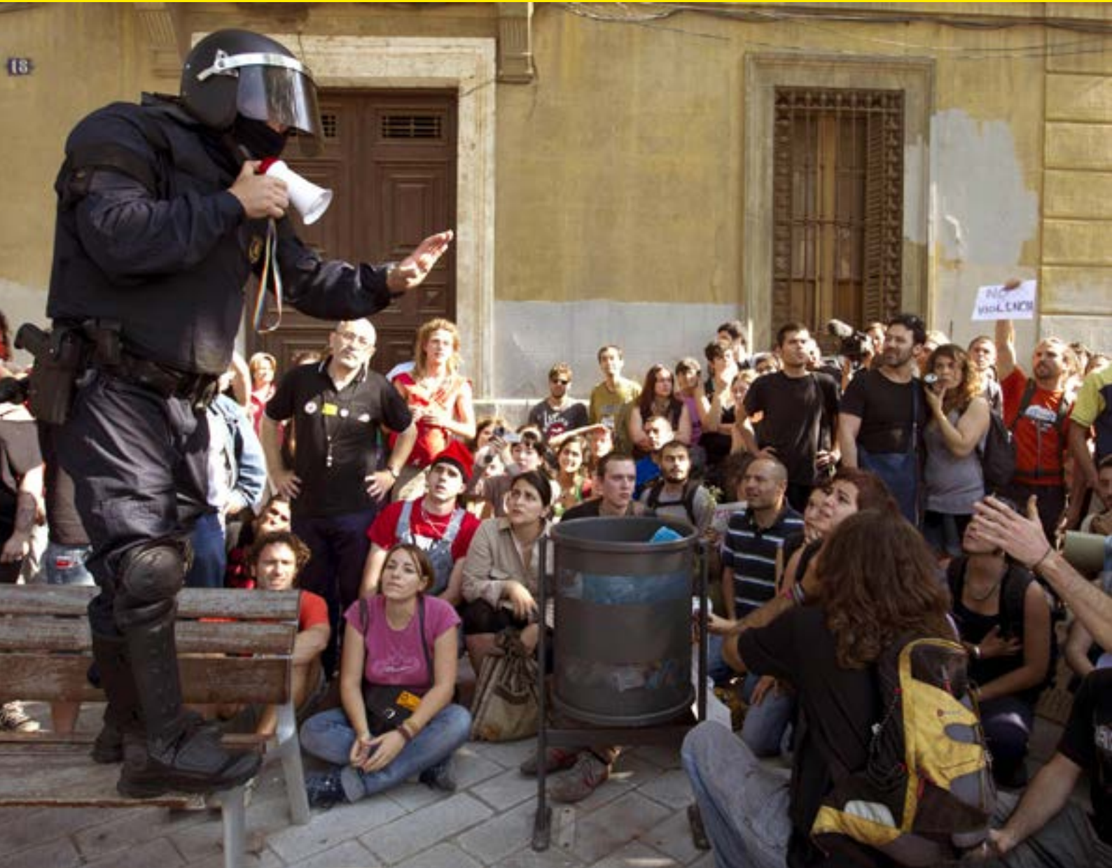
Police officer communicating with demonstrators in front of the Parliament in Catalonia, Barcelona, Spain, June 2011