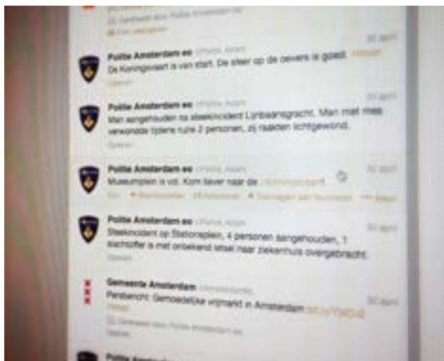
Amsterdam police website informing on a public order situation, Netherlands, April 2013

In some countries police increasingly also use new communication tools to inform the public about relevant issues; many police forces have their own web sites and they often create specific web-sites in relation to large scale public events. They also increasingly make use of social media; we found examples in Belgium, Cyprus, Denmark, Greece, the Netherlands, Poland, UK, and the USA. While important challenges remain to be solved, police officers involved in communication through social media have said that the most important lesson learned is that police cannot afford not to use them, and many of them have started to develop policies on how they can use these media: e.g. for informing the public about assemblies that are going to take place, advising them on traffic and safety issues, dispelling rumours, calling for peaceful conduct etc. Some have even started to have a presence on the web sites of organizers, to ensure that such information is communicated to participants.