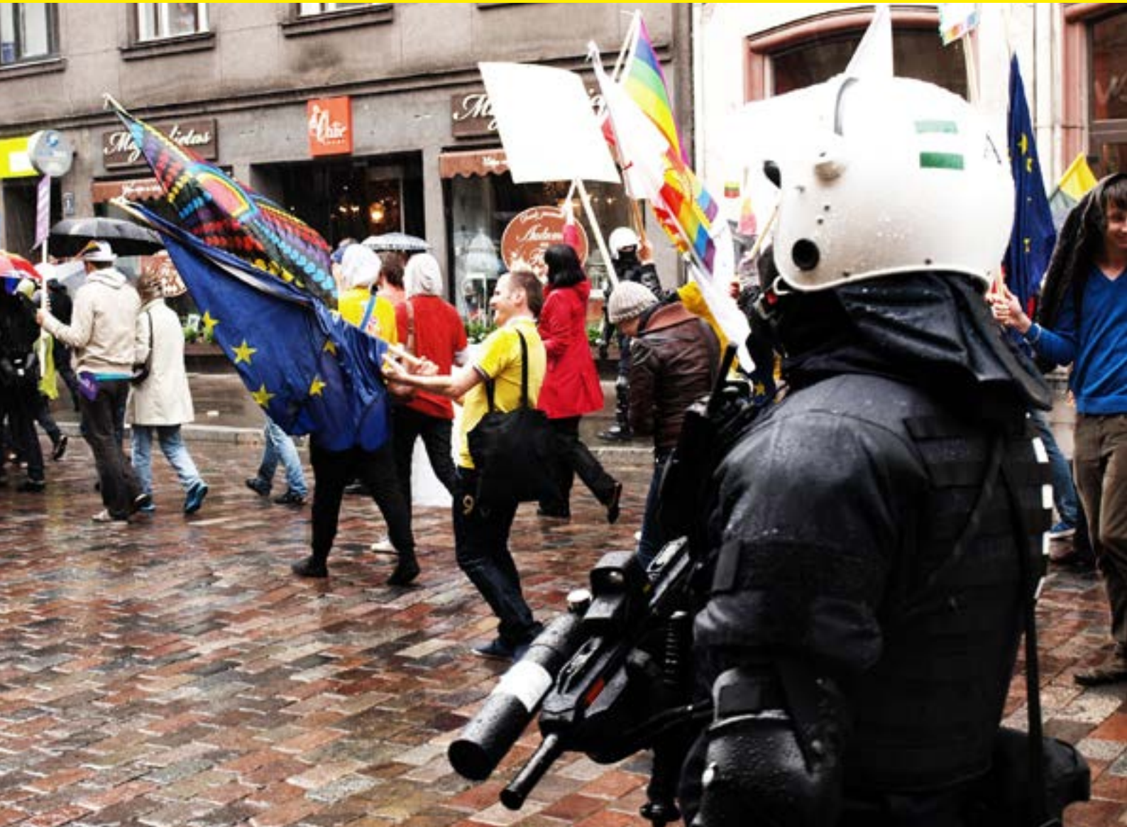
Baltic Price, Riga, Latvia, May 2012