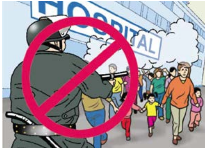
Booklet of the Peruvian National Police on maintenance of public order, p. 15: Use of teargas

According to BPUFF No. 3, the [development and] deployment of non-lethal incapacitating weapons should be carefully evaluated in order to minimize the risk of endangering uninvolved persons, and the use of such weapons should be carefully controlled. This principle needs to be taken into account when authorities are determining what equipment should be used in public assemblies (including for the purpose of dispersing assemblies). The accuracy of weapons or other equipment and the risks for demonstrators as well as uninvolved persons are important considerations to that end: For instance, the Royal Canadian Mounted Police reportedly decided to cease the use of certain acoustic weapons which produce high volume sounds at various frequencies as they were found to be inaccurate and thus to present an unwarranted and uncontrollable risk to uninvolved persons. For the same reason, the Peruvian police decided to prohibit the use of teargas in areas where particular vulnerable persons could be affected, e.g. close to hospitals and schools.