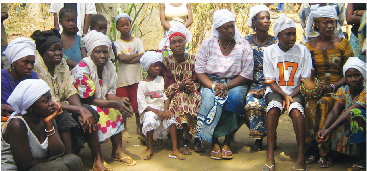
Senior and junior (to be) Soweis take part in a Sowe Dialogue Session discussing the Child Rights Act (2007) in Binkolo, Bombali District, Northern Sierra Leone. Girls as young as seen in the centre of the picture could be predestined to become a Sowe, as the tradition is often passed on from mother to daughter.

This may also suggest that initiation has gone 'underground' or shifted towards those areas where the 'human rights presence' is felt less. Soweis in the north seem to confirm this shift, as they felt 'undermined' by the human rights organisations as well as under pressure to abandon. While 'going underground' may be possible, a shift will still have consequences for the number of girls initiated as well as for the way the rites are performed. Initiation is routinely followed by celebrations, during which the initiated and the 'Bondo-devil' parade through the community. These open celebrations have evidently reduced, as many respondents have stated on several occasions.