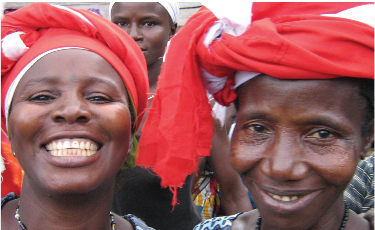
Temne Soweis, recognizable by their red and white head scarves, join in a farewell dance after having participated in a Dialogue Session on the prohibition of underage initiation. Bombali District, 2009.

However, the majority suggested some form of micro credit as to provide an alternative source of income. Soweis from Yamandu said they would abandon the practice if the 'deep mystical powers attached to it are