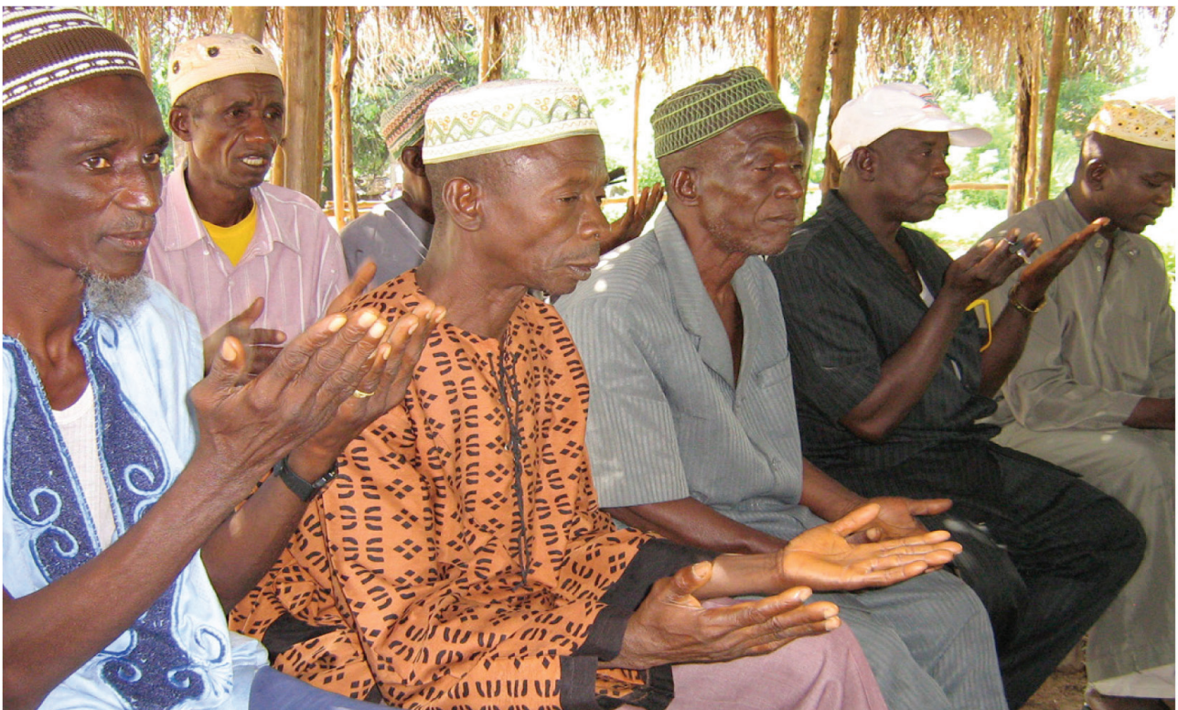
Chiefs praying during a justice workshop in which the new laws on women and children's rights and FGM were openly discussed. During the discussion, various justice cases were addressed that were brought to the attention of the human rights organisation that facilitated this meeting. Makeni, 2007.

In understanding the concept of 'human rights', the responses showed a clear difference between the southern and the northern survey areas. This difference is quite explicit, as the 'don't know' responses were twice as high in the north compared to the south. What could be assumed here is that organisations in the south may have been more successful in disseminating information on human rights. Contributing factors could (partially) relate to the differences in language, ethnicity, or the exposure to education and information in general.