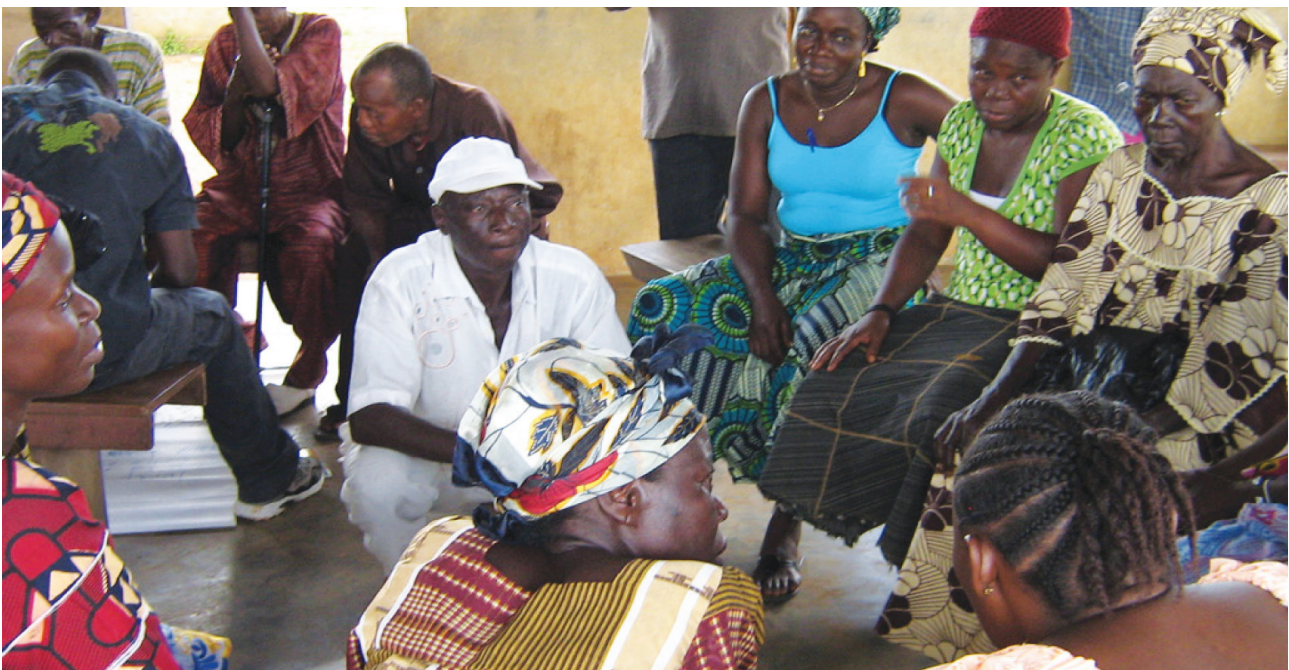
Community Human Rights Volunteers come together in Jendema, Pujehun District, Southern Sierra Leone, to discuss their plans and the issues they encountered during the past two weeks. They come together twice a month and report back to their host organisation monthly.

Staff from one of the northern based partners claimed that the programme's relevance is huge due to its focus on remote areas. He claimed that his organisation shifted