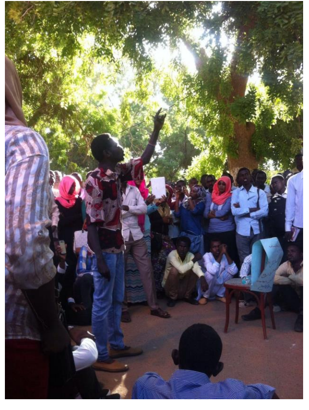
Student forum at the University of Khartoum to address attacks on Darfuri Students, 10 Dec 2015.

However, in its efforts to dominate the political sphere since 1989, the regime of the current ruling party has gradually dismissed thousands of civil servants, including teachers, judges, engineers, medical doctors, university professors and army officers.<sup>48</sup> Sudanese universities were not spared in this quest for domination. Today, all university Vice-Chancellors are appointed by the President.49 assisting in the transformation of these public institutions into political institutions and sacrificing academic independence.Student organizations now mirrors Sudan's political landscape, in particular the ideological divide between Islamists and secular liberals. Violent clashes between student organizationshave taken place intermittently over the past 48 years for a variety of reasons. The first recorded violent clash took place in 1968 between