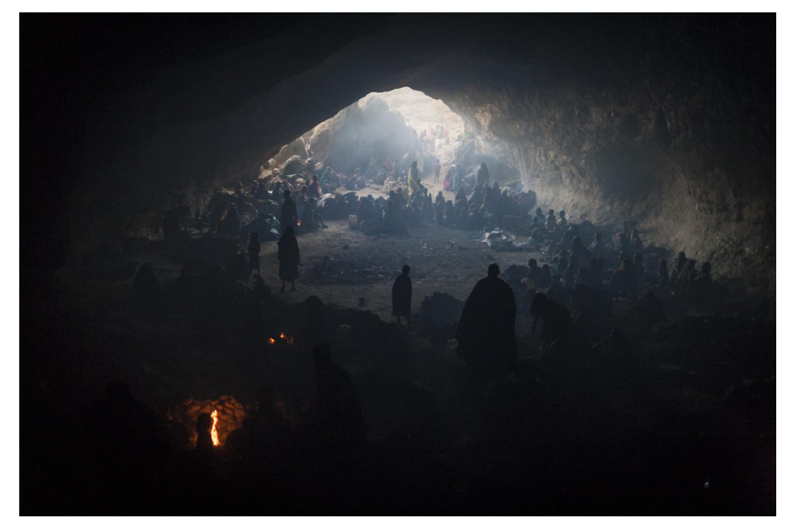
Hundreds of women and children seek shelter in a cave from the bombing by government forces outside of the town of Sarong in Jebel Marra in Central Darfur, Sudan, March, 2015.

The security and humanitarian situation in Darfur remained dire as the armed conflictenteredits fourteenth year in 2017.<sup>1</sup> The government launched a military offensive against the Sudan Liberation Army/AbdulWahid Al Nur (SLA/AW) in the inner Jebel Marra region in Central Darfur in January 2016. The fighting in Jebel Marra caused the displacement of an estimated 195,000 people, according to UN OCHA<sup>2</sup> Hundredsofthousands of civilians have been killed by the violence or by conflict-induced starvation, dehydration and disease.<sup>3</sup>