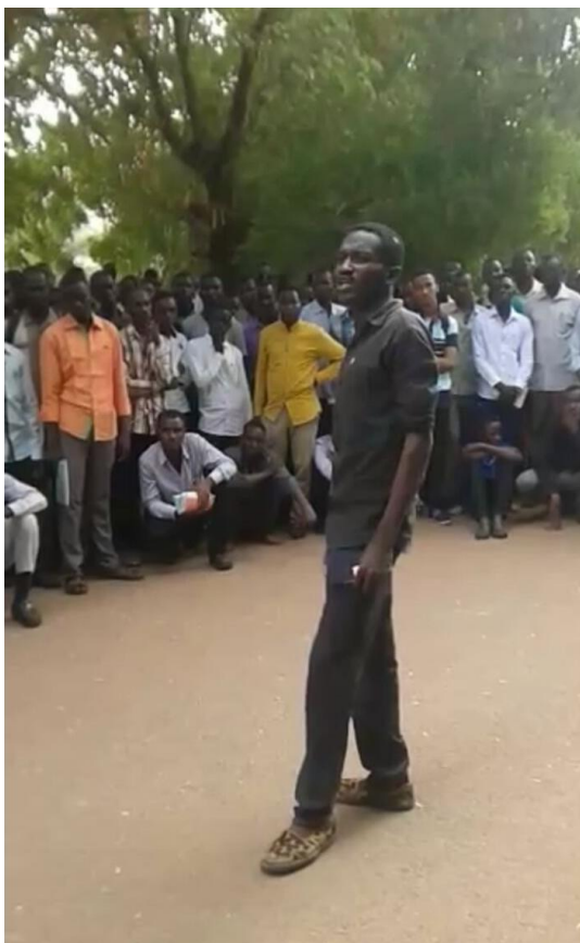
Darfuri Students' Association public forum discussing tuition fees in October 2015 at the Holy Quran University

The Darfur Students' Association issued astatement rejecting the new policy and argued it was a u-turn from the prior commitment made to exempt Darfuri students from paying fees. It also stated it would organize a sit-in protest until the university reinstated the fee waiver. The peaceful sit-in started on 13 October 2015 around 8 am, at the university's Al Thoura Block 1 Campus. About 500 students participated. Members of the Darfur Students' Association distributed a statement and delivered some speeches objecting to the imposition oftuition fees. Around noon, the sit-in was attacked by 70 to 100 individuals composed of ruling party affiliated students, the police and NISS agents.<sup>79</sup> A memberof the Darfur Students' Association told Amnesty International: