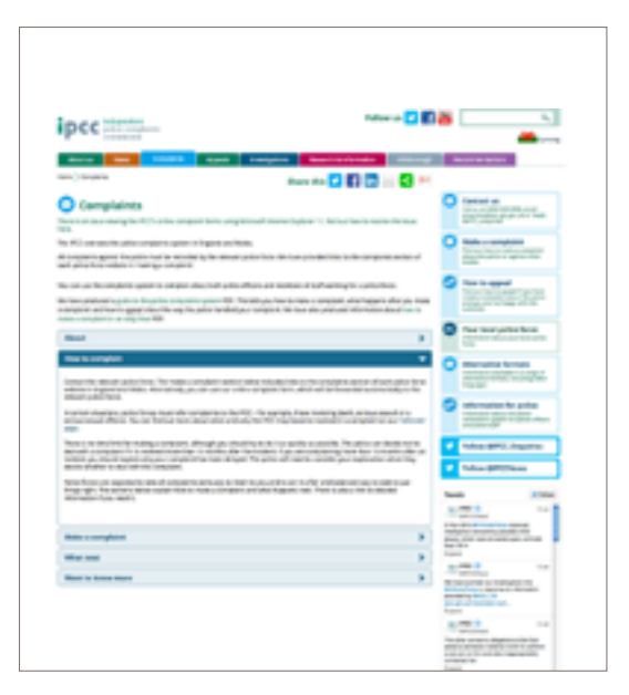
Website of the IPCC for England and Wales, information on how to complain. Screenshot taken in January 2015.

Other mechanisms, such as the IPCC in England and Wales, serve as an appeal instance in case the complainant was not satisfied with how the police has handled a complaint. Whether or not it is possible to appeal to the IPCC is specified in the complaint decision letter, which is issued by the local police force. The appeals that can be lodged are limited to appeals against the local resolution process, the police investigation into the complaint, a decision to disapply, the outcome of a complaint after the decision to disapply, discontinuation of an investigation, or that the original complaint was not recorded. The IPCC, in these cases, will not investigate the original matter, but the way the police handled the complaint. It is not possible to appeal against the IPCC's assessment of an appeal, and decisions made by the IPCC can only be overturned by the courts through the judicial review process.