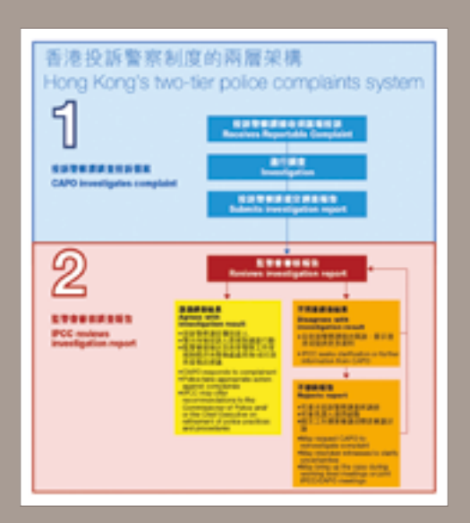
Screenshot from the Annual report 2013/2014 of the IPCC in Hong Kong, illustrating Hong Kong's two-tier Police Complaints System, p. 11. Screenshot taken in January 2015.

One way to prevent such threats, or the perceived possibility thereof, is to not require the complainant to make the complaint in person, or to the local police station to which the alleged offender belongs. Many countries offer the possibility to complain in writing or online, in some cases to dedicated departments that have no direct connection to the officers complained about. This is for instance possible in England and Wales, where complaints can be directed to the Professional Standards Departments of the respective police force. The New Zealand Police offers the option to arrange being interviewed elsewhere, if the complainant is reluctant or unable to make the complaint at a police station.