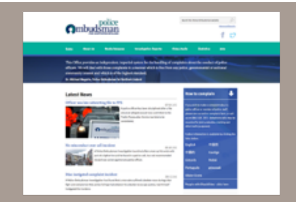
Website of the Police Ombudsman for Northern Ireland. Screenshot taken in January 2015.

Especially in multi-lingual countries, the form should further be available in all common languages. The Northern Irish Police Ombudsman, for instance, offers the form not only in the official languages English and Gaelic, but also in Chinese, Lithuanian, Polish, Portuguese, Russian, and Ulster Scots. As not only the form, but also the complaints procedure, is available in all these languages, it is ensured that potential language barriers do not prevent people from complaining, at least for the most common groups of immigrants.