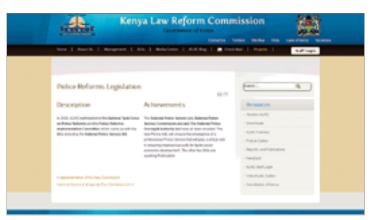
Website of the Kenya Law Reform Commission (KLRC), screenshot taken in January 2015.

research and consultation with various actors, as will be discussed in more detail later in this section, the Task Force identified that low levels of trust in the police, and general considerations of the police as being ineffective and corrupt, was a serious issue that needed addressed. In this light, they suggested the establishment of the Independent Police Oversight Authority.<sup>39</sup>