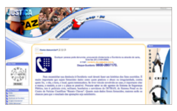
Website of the Ombudsman for the Brazilian State of Pará, Information on how to make a complaint. Screenshot taken in January 2015.

Unfortunately, many country mechanisms are not able to hold their own investigations at all. Their roles are limited to receiving, recording and referring cases to the inspectorates or internal affairs units of the police, or to the public prosecutors. This is, for example, the case in the Brazilian State of Pará, where the Police Ombudsman has no investigative powers and depends on investigations conducted by the Internal Affairs Offices of the respective police force.<sup>22</sup> The Ombudsman receives complaints, requests and tracks the investigation and keeps the complainant