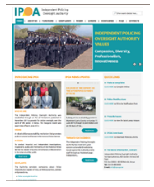
Website of Kenya's IPOA. Screenshot taken in January 2015.

Further, board members may not have been convicted of an offence involving dishonesty, or another offence for which they were imprisoned without the option of a fine, be unable to perform the functions of the office due to mental incapacity, or be an undischarged bankrupt. Surprisingly and unfortunately, these criteria do not extend to the Director of the Authority.