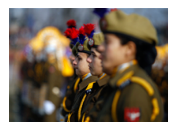
Police women in India.

In the above examples of Kenya and England and Wales, the government was actively involved in the decision to establish an oversight mechanism. India, however, provides an example of other actors initiating reform, after the government failed to do so. The need for police reform in India was long recognised, also by the government, but none of the main recommendations put forward by the National Police Commission (NPC), which was created in 1979, were adopted by the governments. In 1996, two former Director Generals of Police filed a Public Interest Litigation in the Supreme Court, asking the Court to direct governments to implement the recommendations.<sup>42</sup> In its verdict in 2006, the Court then ordered that reform must take place, and issued 7 binding directives to that end.<sup>43</sup> The Directives can be broadly categorised to fulfil two main objectives: to achieve functional autonomy for the police, and to enhance public accountability. Directive Number Six required every state to establish two Police