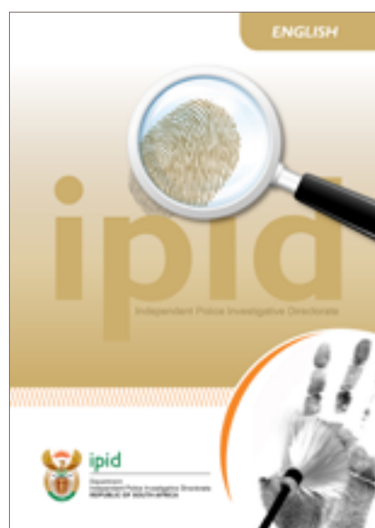
Brochure informing about the mandate and complaints procedure of the South African IPID, p. 1, available for download on the IPID's website. Screenshot taken in January 2015.

In the Czech Republic the relevant authority to which an Ombudsman’s recommendation is issued, is obliged to inform the Ombudsman within 30 days of the corrective measures that have been taken. If the Authority fails to do so, or if the measures are considered insufficient by the Ombudsman, he/she shall inform a superior Authority, or if there is no such Authority, the Government.