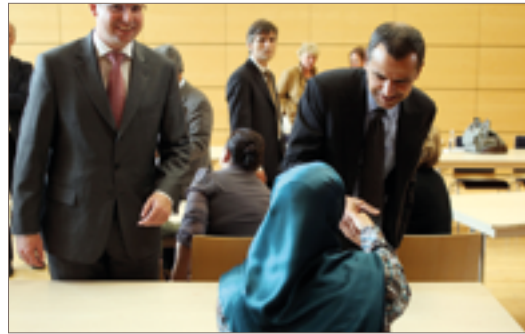
Members of the NSU Committee of Inquiry speaking to a victim.

The Nationalsozialistischer Untergrund (National Socialist Underground, NSU), a German far-right terrorist group, committed at least 10 murders, two bomb attacks and more than a dozen brutal robberies between 1998 and 2011. Though the crimes were investigated at the time, the police failed to establish the connection between them and their underlying racist motivation, and was unable to identify the perpetrators, until the NSU claimed responsibility for the acts in a video in November 2011.