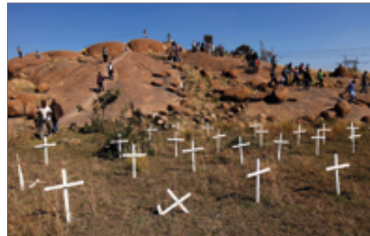
Crosses at the Marikana site near Rustenburg, South Africa.