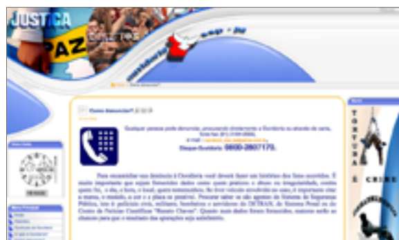
Website of the Ombudsman for the Brazilian State of Pará, Information on how to make a complaint. Screenshot taken in January 2015.

Unfortunately, many country mechanisms are not able to hold their own investigations at all. Their roles are limited to receiving, recording and referring cases to the inspectorates or internal affairs units of the police, or to the public prosecutors. This is, for example, the case in the Brazilian State of Pará, where the Police Ombudsman has no investigative powers and depends on investigations conducted by the Internal Affairs Offices of the respective police force. 22 The Ombudsman receives complaints, requests and tracks the investigation and keeps the complainant informed. Should the Ombudsman consider the initial police investigation insufficient, he/she may request further investigations, however, there is no guarantee that this will actually happen. 23