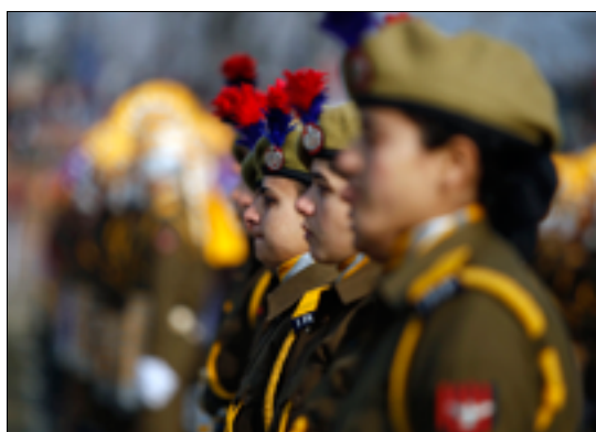
Police women in India.

In the above examples of Kenya and England and Wales, the government was actively involved in the decision to establish an oversight mechanism. India, however, provides an example of other actors initiating reform, after the government failed to do so. The need for police reform in India was long recognised, also by the government, but none of the main recommendations put forward by the National Police Commission (NPC), which was created in 1979, were adopted by the governments. In 1996, two former Director Generals of Police filed a Public Interest Litigation in the Supreme Court, asking the Court to direct governments to implement the recommendations. 42 In its verdict in 2006, the Court then ordered that reform must take place, and issued 7 binding directives to that end. 43 The Directives can be broadly categorised to fulfil two main objectives: to achieve functional autonomy for the police, and to enhance public accountability. Directive Number Six required every state to establish two Police