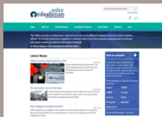
Website of the Police Ombudsman for Northern Ireland. Screenshot taken in January 2015.

Especially in multi-lingual countries, the form should further be available in all common languages. The Northern Irish Police Ombudsman, for instance, offers the form not only in the official languages English and Gaelic, but also in Chinese, Lithuanian, Polish, Portuguese, Russian, and Ulster Scots. As not only the form, but also the complaints procedure, is available in all these languages, it is ensured that potential language barriers do not prevent people from complaining, at least for the most common groups of immigrants.