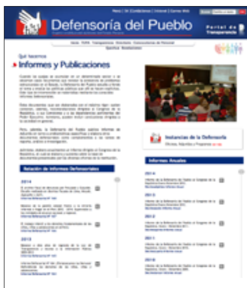
Website of the Peruvian Ombudsman ( Defensoría del Pueblo ), Annual Reports. Screenshot taken in January 2015.

The reports issued should be made publicly available and provide a comprehensive overview on the work of the mechanism, including information on the number and types of complaints received, as well as on the outcome of those complaints. Further, the mechanism should report on its budget and expenses.