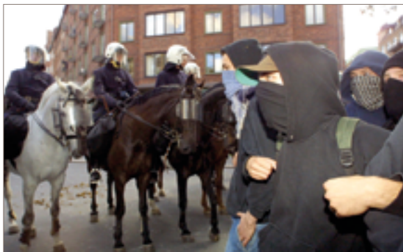
Police officers and protesters during the EU summit in Göteborg in 2001

was tasked with reviewing the events in Göteborg and gather experiences of similar events, “[...] to consider and propose measures that [...] can contribute to preventing and combating serious public disturbances.” 61