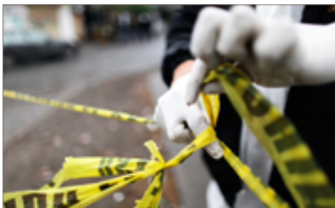
Sealing off a crime scene in Monterrey, Mexico.

External mechanisms should be equipped with sufficient investigative powers to conduct an effective inquiry into a complaint. These powers should include the power to subpoena documents, to obtain search warrants, to summon any witness, to protect them, and to compel police cooperation. 21