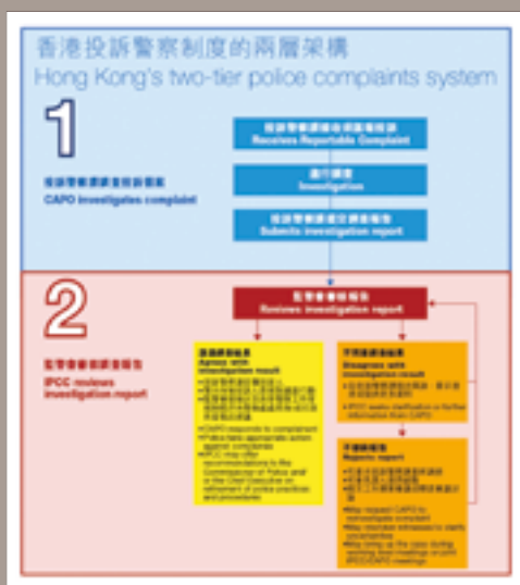
Screenshot from the Annual report 2013/2014 of the IPCC in Hong Kong, illustrating Hong Kong's two-tier Police Complaints System, p. 11. Screenshot taken in January 2015.

One way to prevent such threats, or the perceived possibility thereof, is to not require the complainant to make the complaint in person, or to the local police station to which the alleged offender belongs. Many countries offer the possibility to complain in writing or online, in some cases to dedicated departments that have no direct connection to the officers complained about. This is for instance possible in England and Wales, where complaints can be directed to the Professional Standards Departments of the respective police force. The New Zealand Police offers the option to arrange being interviewed elsewhere, if the complainant is reluctant or unable to make the complaint at a police station.