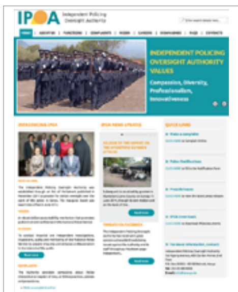
Website of Kenya's IPOA. Screenshot taken in January 2015.

Further, board members may not have been convicted of an offence involving dishonesty, or another offence for which they were imprisoned without the option of a fine, be unable to perform the functions of the office due to mental incapacity, or be an undischarged bankrupt. Surprisingly and unfortunately, these criteria do not extend to the Director of the Authority.