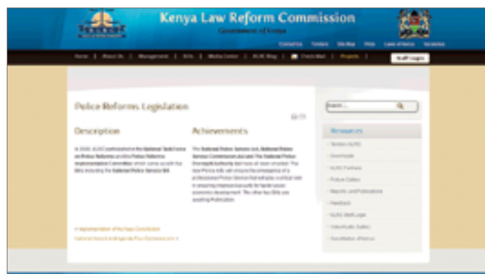
Website of the Kenya Law Reform Commission (KLRC), screenshot taken in January 2015.

The process of deciding on the establishment of the Kenyan IPOA serves as an example of this. Following the post-election violence in 2007, the two main contenders for political power signed the Kenyan National Dialogue and Reconciliation Agreement which identified 4 agenda items on the resolution of the political crisis and its root causes. Agenda Item 4, covering long term issues and solutions, stressed among other things the need for institutional reform and the need to address transparency, accountability and impunity. 37 The Commission of Inquiry into Post-Election Violence (CIPEV), which was established in response to Agenda Item 4, consequently recommended comprehensive reform of the Kenya Police Service. 38 As a result, the National Task Force on Police Reform was established by the President in 2009. After extensive research and consultation with various actors, as will be discussed in more detail later in this section, the Task Force identified that low levels of trust in the police, and general considerations of the police as being ineffective and corrupt, was a serious issue that needed addressed. In this light, they suggested the establishment of the Independent Police Oversight Authority. 39