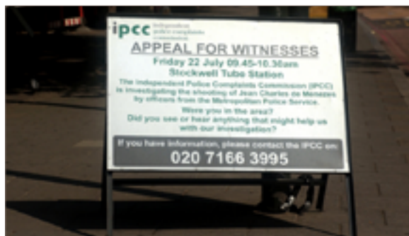
IPCC in England and Wales appeals for witnesses in the investigation of the shooting of Jean Charles de Menezes by officers from the Metropolitan Police Service.

In England and Wales, the Police (Complaints and Conduct) Act 2012 introduced the obligation for serving officers of the police and police bodies to attend interviews as witnesses for investigations carried out or managed by the IPCC. While this is certainly an improvement to the previous absence of a power to compel witnesses, the provisions unfortunately do not extend to retired police officers, who can be equally relevant for the investigation.