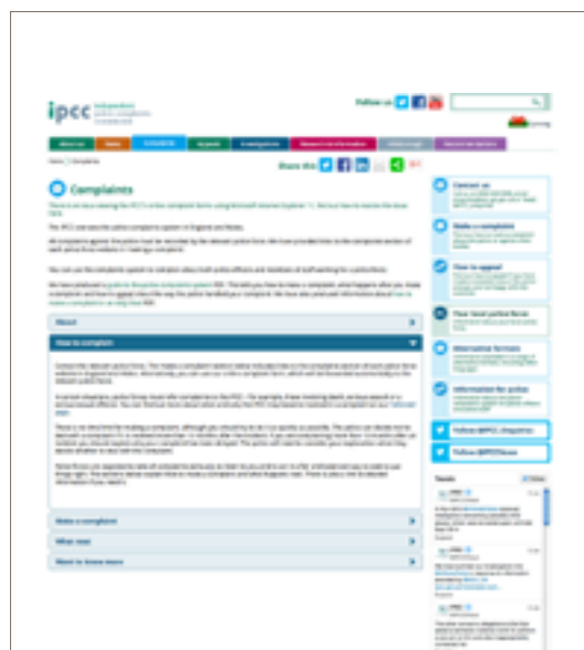
Website of the IPCC for England and Wales, information on how to complain. Screenshot taken in January 2015.

Other mechanisms, such as the IPCC in England and Wales, serve as an appeal instance in case the complainant was not satisfied with how the police has handled a complaint. Whether or not it is possible to appeal to the IPCC is specified in the complaint decision letter, which is issued by the local police force. The appeals that can be lodged are limited to appeals against the local resolution process, the police investigation into the complaint, a decision to disapply, the outcome of a complaint after the decision to disapply, discontinuation of an investigation, or that the original complaint was not recorded. The IPCC, in these cases, will not investigate the original matter, but the way the police handled the complaint. It is not possible to appeal against the IPCC's assessment of an appeal, and decisions made by the IPCC can only be overturned by the courts through the judicial review process.