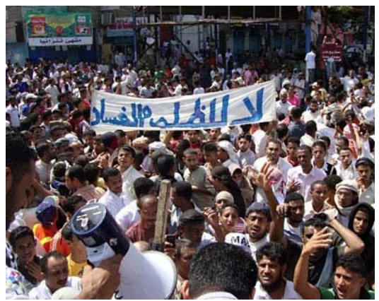
Protest in Crater, Aden in February 2011

On 25 February, security forces reportedly fired on protesters in the al-Mu'alla district of Aden from armoured vehicles, as well as attacking houses where protesters were believed to have been seeking shelter. Two men were said to have been killed in their houses during a period of intensive gunfire, both of them shot in the head.23 One of the most disturbing reports is that security forces refused to allow residents to take the injured to hospital after Central Security forces fired on protesters and bystanders. About 10 people were