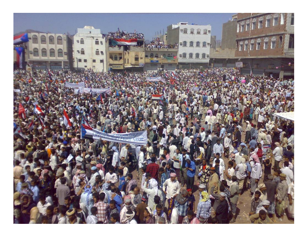
Southern Movement mass demonstration, 2009