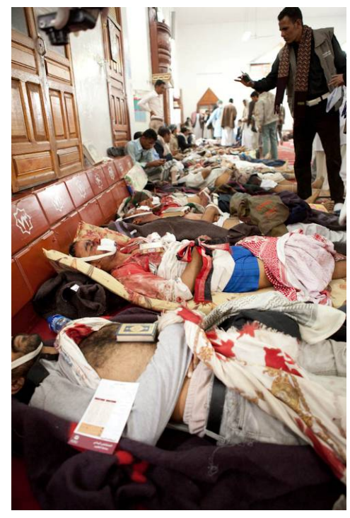
A row of dead bodies following a protest in Sana'a on 18 March 2011

Hundreds of protesters are reported to have been arrested in relation to the protests. In Aden, for instance, scores of protesters were reported to have been arrested on 16 February 2011 and detained incommunicado in al-Mansurah Prison for one to two weeks, raising concern that they could be at risk of torture and other ill-treatment.31 Many appear to have been released shortly afterwards. Amnesty International has not been able to follow their cases in detail, but is concerned that some may have been detained incommunicado for varying periods of time, raising concern that they were exposed to an increased risk of torture and other illtreatment.32