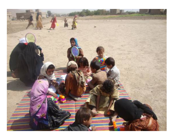
Children playing in an IDP camp in Amran governorate, Yemen, February 2010. The camp was home to people who had fled the conflict in Sa'dah

Despite the new agreement, over 350,000 people from Sa'dah remain internally displaced, according to UNHCR, the UN's refugee agency.66 Only a fraction of them found refuge in specially constructed camps. The scale of the destruction and the prevalence of unexploded ordnance and land mines in the area continue to hamper the return of displaced families. In July 2010, the authorities announced that compensation would be paid to families affected by the destruction,67 but Amnesty International has not been able to confirm whether any mechanisms or processes have been