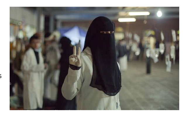
A female doctor at a makeshift hospital in Sana'a on 15 March 2011

However, the shockingly high number of protesters killed and injured in such a short period of time and the fact that violations have affected so seriously ordinary members of the public joining in demonstrations all over the country renders the apparent lack of serious efforts to deliver truth and justice for them and their relatives particularly disturbing.