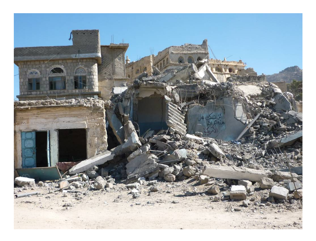
Building destroyed by aerial bombardment, Sa'dah, Yemen, March 2010