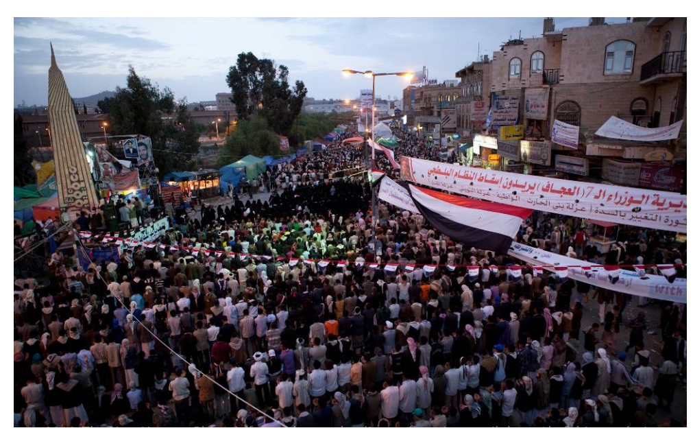
Protesters praying in Sana'a on 13 March 2011

In some instances protesters were killed when security forces attacked them during prayer. Three protesters were reported to have been killed<sup>27</sup> and over 1,000 injured in Sana'a on 12 March when security forces opened fire on the protest camp in what protesters term al-Taghyeer Square, near Sana'a University, during the early morning prayer, while progovernment "thugs" were reported to have attacked ambulances trying to attend to the wounded. One student member of the protest camp said to Amnesty International: