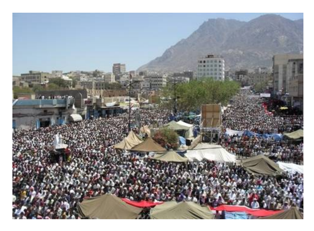
Protest in Ta'izz on 11 March 2011

As the protests have broadened, the response of the security forces has hardened, heightening the protesters' sense of grievance. Security forces – some wearing uniform, others plain clothes - have reportedly used a range of weapons, munitions, armaments and related equipment to violently repress the protesters including US-made tear gas, 10 live firearms ammunition, 11 rubber bullets, 12 US-made rubber grenades, 13 riot guns, 14 and electroshock batons. 15 Security forces have fired on protesters from armoured vehicles. 16 In some cases, it has not been clear whether those wearing plain clothes have been members of the security forces or individuals colluding with them.