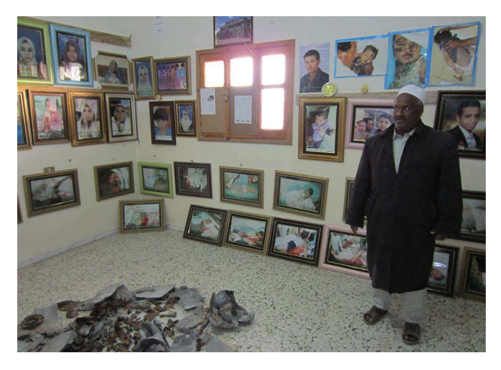
Survivor of NATO airstrikes in Majer on 8 August 2011, which killed 34 civilians

On 19 March 2011 several member states of the North Atlantic Treaty Organization (NATO), including the USA, the UK and France, launched a military campaign with air and naval strikes against Colonel Mu'ammar al-Gaddafi's forces.<sup>1</sup> The strikes were launched pursuant to UN Security Council (UNSC) resolution 1973 (2011) of 17 March 2011, which authorized member states "to take all necessary measures (...) to protect civilians and civilian populated areas under threat of attack in the Libyan Arab Jamahiriya" and introduced a "no fly zone" above Libya.<sup>2</sup> The National Transitional Council (NTC), the emerging new authority which by then controlled eastern Libya, had called for and fully supported the imposition of a no-fly-zone and international military action against al-Gaddafi's forces.