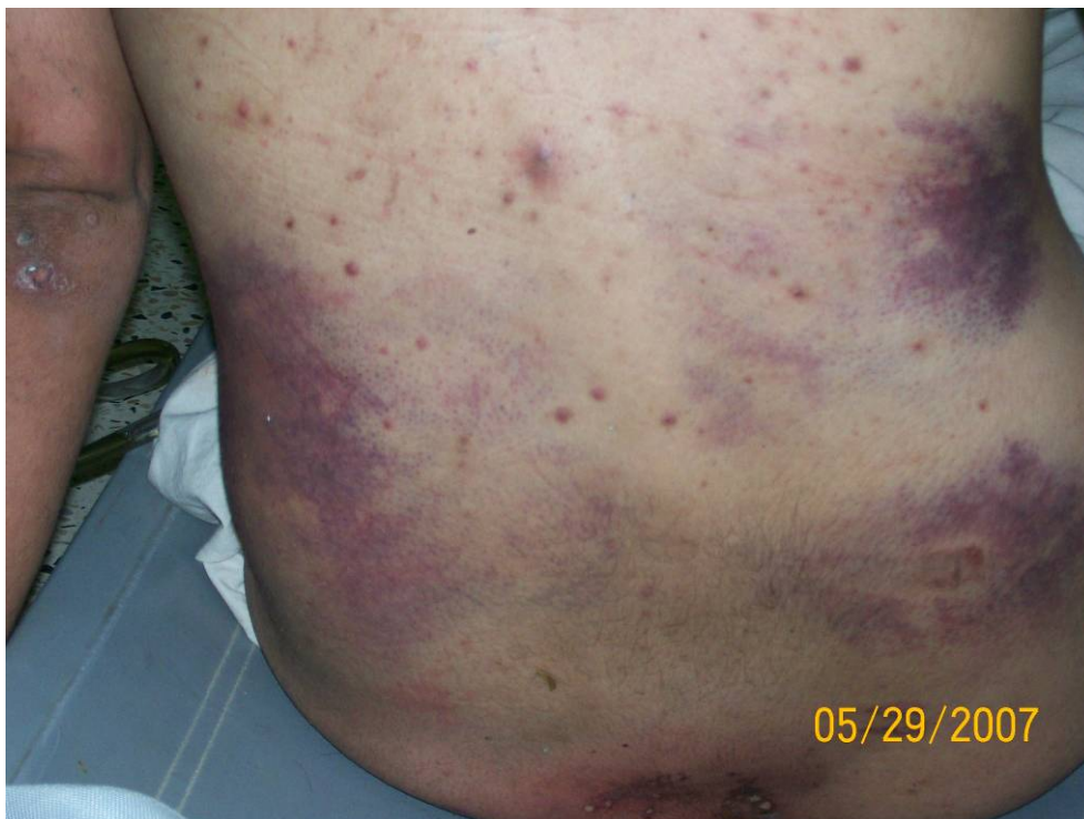
Marks of torture on 'Adnan 'Awad al-Jumaili's body

Some of the most recent deaths in custody happened on 12 May 2010, when seven detainees died while being transferred within Baghdad from Camp Taji to al-Rusafa Prison. Iraqi government officials stated that the cause of death was asphyxiation. The seven were among a group of nearly 100 detainees squeezed into two vans without any windows and which normally only carry about 20 people each. When one of the vans arrived in Baghdad, guards found that 22 detainees had collapsed. They were taken to hospital, but seven died. The government announced that an investigation had been set up. On 15 May the Human Rights Minister was reported as stating that those responsible for the deaths must be brought to justice. 79