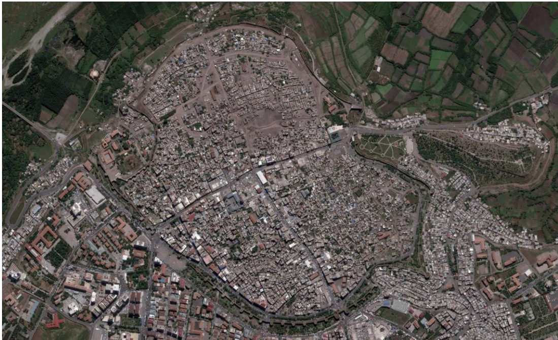
↑ Satellite imagery taken on 10 May 2016, after the end of the armed clashes and “emergency expropriation” order in March, shows that a significant portion of buildings in the eastern half of the city have been damaged or demolished.