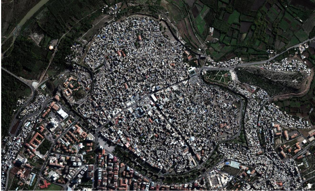
↑ Satellite imagery shows Sur on 8 November 2015 before the major curfew put into effect on 11 December 2015.

briefing paper. The authorities also granted limited access to the area of Sur under curfew in May and June 2016. In June, despite the curfew there having been lifted, Amnesty International delegates were prevented from entering Cizre, on the spurious grounds that written permission was required to enter the city. Amnesty International delegates were due to conduct interviews with returning families in Cizre and families displaced from Şırnak and living in surrounding villages. Amnesty International requested to meet with the Nusaybin District Governor in October but this request was rejected. Amnesty International presented its main findings and requested additional information in a letter to the Minister of the Interior on 28 November.