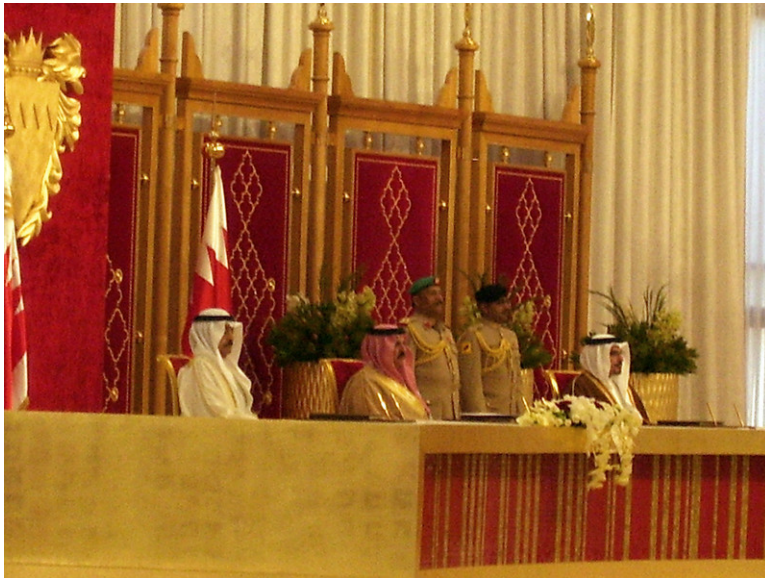
The King, the Prime Minister and the Crown Prince during the Bahrain Independent Commission of Inquiry's ceremony

The human rights crisis in Bahrain is not over. Despite the authorities' claims to the contrary, state violence against those who oppose the Al Khalifa family rule continues, and in practice, not much has changed in the country since the brutal crackdown on anti-government protesters in February and March 2011.