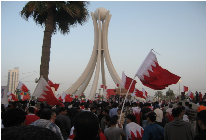
Bahrain demonstration, 22 February 2011

13 March 2011 brought a further escalation in violence when anti-government protesters sealed off the main roads in Manama and occupied the capital's Financial Harbour area, causing considerable disruption. The anti-government protests were by and large peaceful, but there were a few violent incidents. Some anti-government protesters attacked Asian migrant workers, killing two and injuring others.