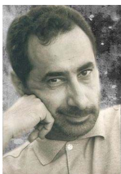
Mahmood Abdulsahab

There is no evidence that Mahdi 'Issa Mahdi Abu Dheeb or Jalila al-Salman used or advocated violence. They were targeted solely for their leadership of the BTS and for peacefully exercising their rights to freedoms of expression, association and assembly, including calling for strikes. The lawyers of the two appealed the verdict and the sentences. The appeal hearing was held in late December 2011, then postponed to 9 February 2012. It was again postponed until 2 April 2012, and then until 2 May 2012.