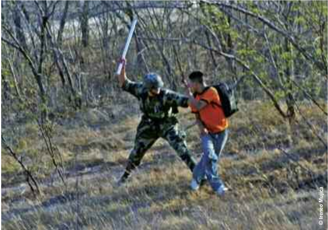
A member of the Mexican Navy wields a baton during an assault on migrants near Las Palmas in Nilotepic municipality, Oaxaca state, 31 March 2008.

how one migrant fled and was chased by an INM official holding a short baton that he placed on the man's neck. Villagers said the man was convulsed by an electric current and fell dazed to the floor. He was then forced to his feet and taken away by the INM agents. The man may already have been effectively in custody when the stun baton was applied and posed no threat to the officials or to bystanders. 38 When villagers complained about the treatment of the migrants, INM officials threatened to arrest one woman for people smuggling because of the humanitarian assistance she and others provided for migrants. CNDH officials arrived the following day to investigate; their findings have yet to be published. The INM has consistently denied that its agents use electric shock batons in any circumstances.