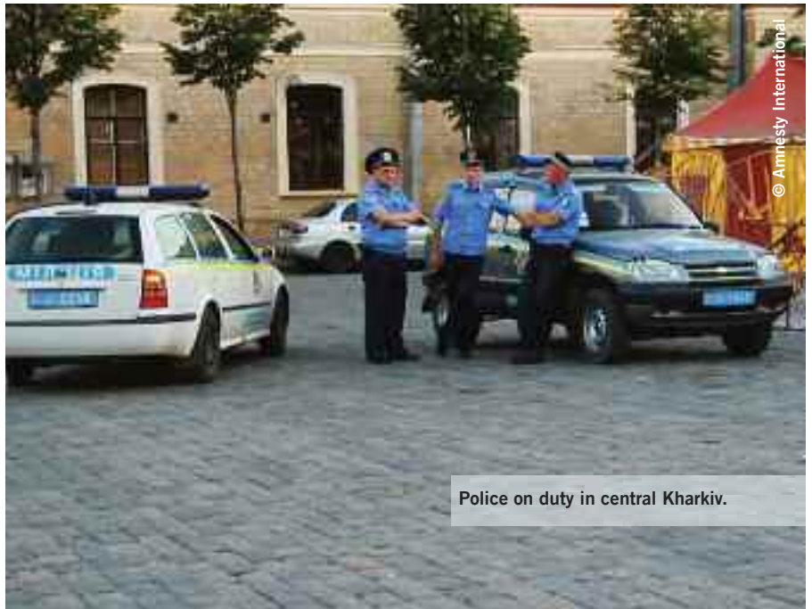
Police on duty in central Kharkiv.

President Viktor Yanukovich Bankovaya Str. 11 01220 Kyiv, Ukraine Fax: +380 44 255 6161 e-mail: press@stpu.gov.ua twitter: @ua_yanukovich Salutation: Dear President