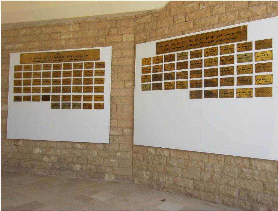
Plaques in memory of scores of judges and prosecutors who have been killed in attacks over the past decade in Iraq, fixed to the wall at the entrance of a judicial building, Baghdad, September 2012.

The executive branch of government, through its actions, has continued to directly undermine key rights, such as the right to fair trial – for example, by allowing terrorism suspects' “confessions” to be broadcast on television even before those suspects come to trial. In some cases, senior government leaders have publicly pronounced individuals' “guilt” to capital charges either before they have been tried or before their trials have concluded.