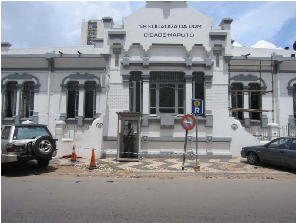
The First Police Station in Maputo City.