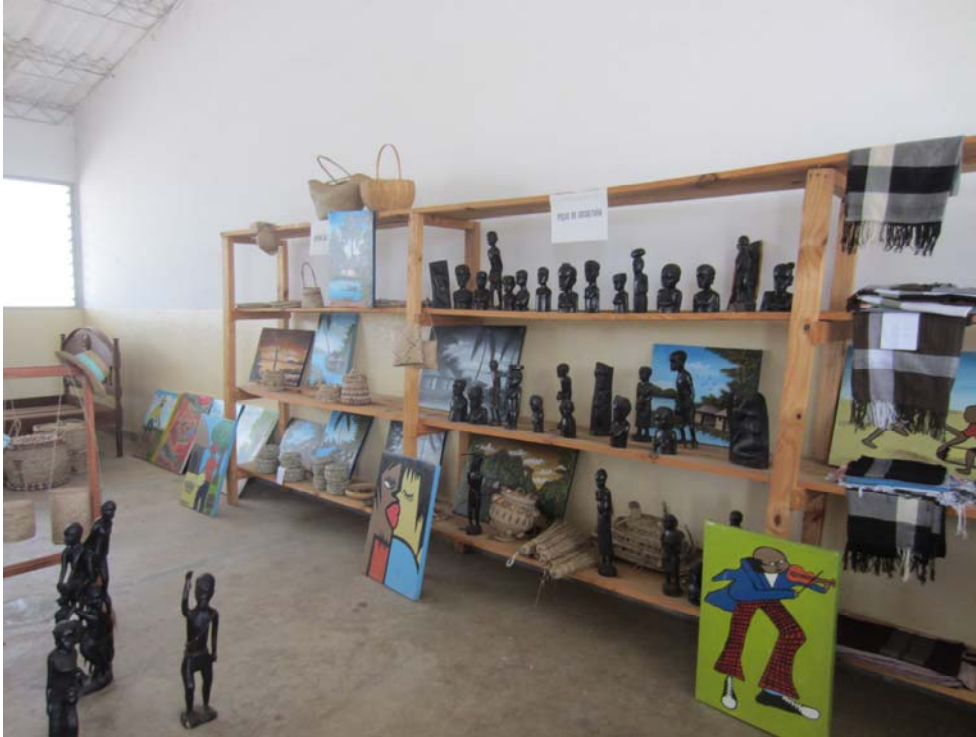
Craftwork made by inmates at the Nampula Penitentiary.