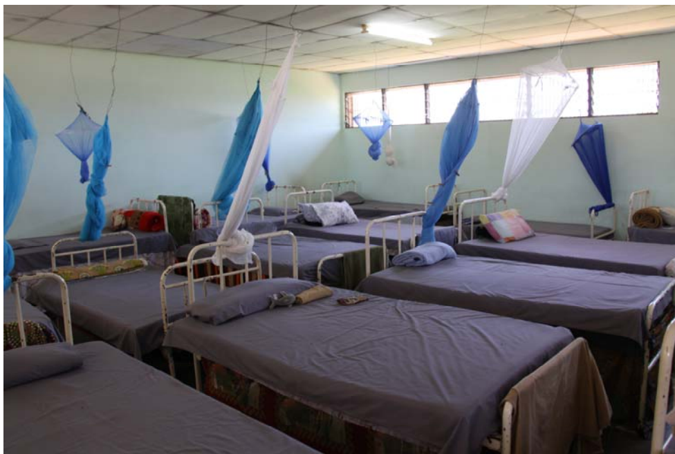
A cell in the Ndhlavela Women's Prison; one of the few prisons visited by the delegates with beds.