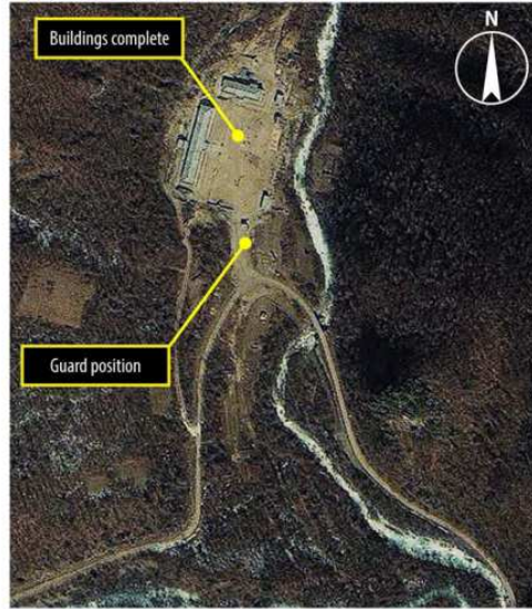
Natural Color Imagery, February 22, 2012, 39.839914°, 126.802832°