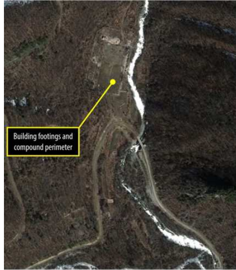
Natural Color Imagery, March 26, 2011, 39.839914°, 126.802832°

The images that are featured below from kwaniso 15 (Yodok kwaniso ) show an administrative compound (located in Area 6 of the overview image on the following page) that was constructed (or reconstructed) between March 2011 and February 2012. Exact functionality of the complex is unclear, but it is likely to be either a guard station or an administrative area to support logging activities.