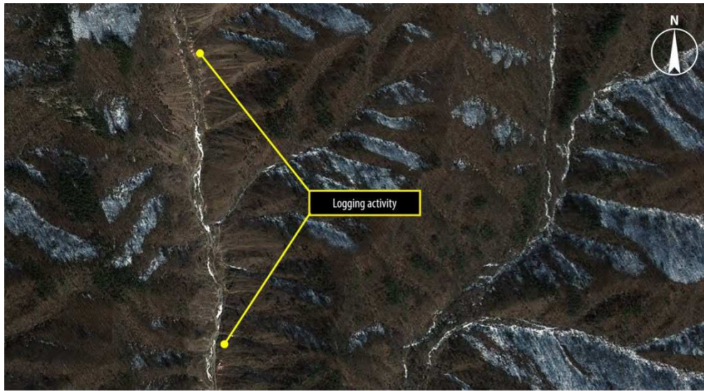
Natural Color Imagery, March 26, 2011, 39.836244°, 126.831452°

Logging is widely visible in both camps. The following images show the on-going logging activities over a two year period (2011 – 2013) within kwaniso 15 (Area 8 of overview image on page 14).