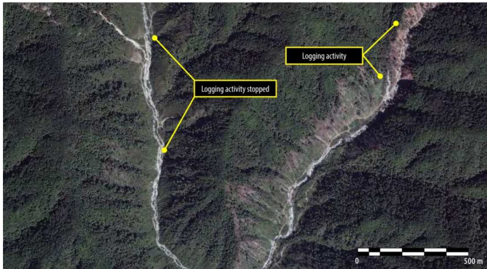
September 27, 2013, 39.836244°, 126.831452°