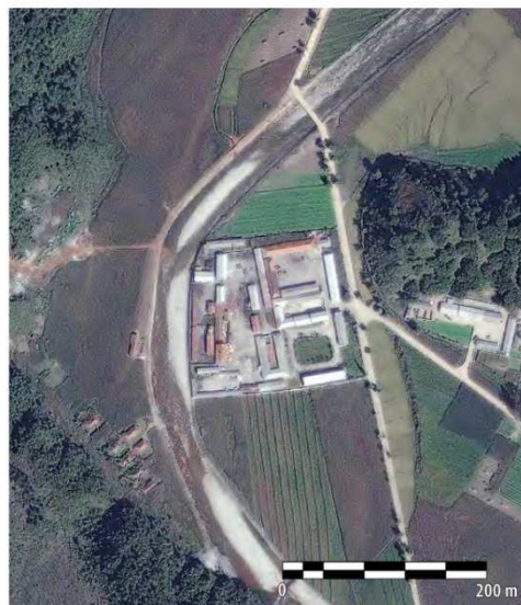
DigitalGlobe Natural Color Imagery, September 27, 2013 , 39.689814°, 126.857436°