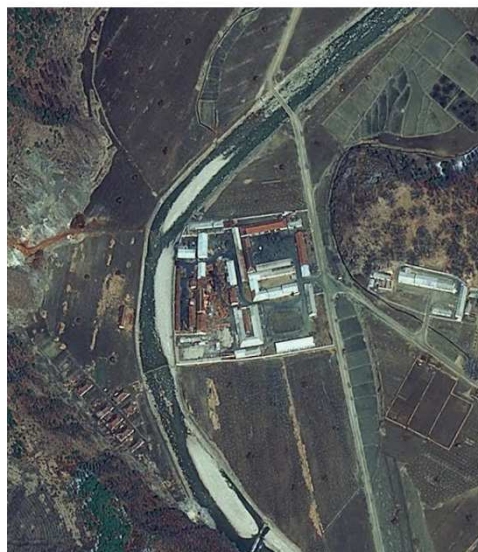
DigitalGlobe Natural Color Imagery, April 7, 2013 , 39.689814°, 126.857436°