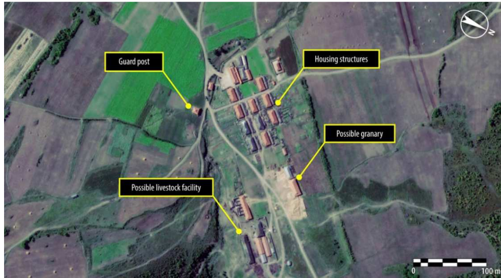
Natural Color Imagery, September 23, 2011, 41.385843°, 129.101535°

The images below, from 2011 and 2013, respectively, show a close up of a village in the northern part of kwanliso 16, with new housing being recently added or being under construction. The guard post in immediate vicinity of the village allows for constant supervision of the prisoners and is indicative of the tight security within the political prison camp.