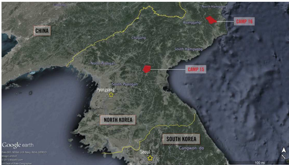
Map of North Korea and neighbouring countries with Camps 15 and 16 highlighted in red. Names and boundary representation do not necessarily constitute endorsement by Amnesty International.

Amnesty International's Science for Human Rights program commissioned satellite image analysis of kwanliso 15 (2011-2013) and kwanliso 16 (2008-2013) in order to assess the current state of these two political prison camps. Kwanliso 15 is located in Yodok, South Hamgyong province around 120km from the capital Pyongyang and kwanliso 16 in Hwaseong, North Hamgyong province is approximately 400 km from Pyongyang.