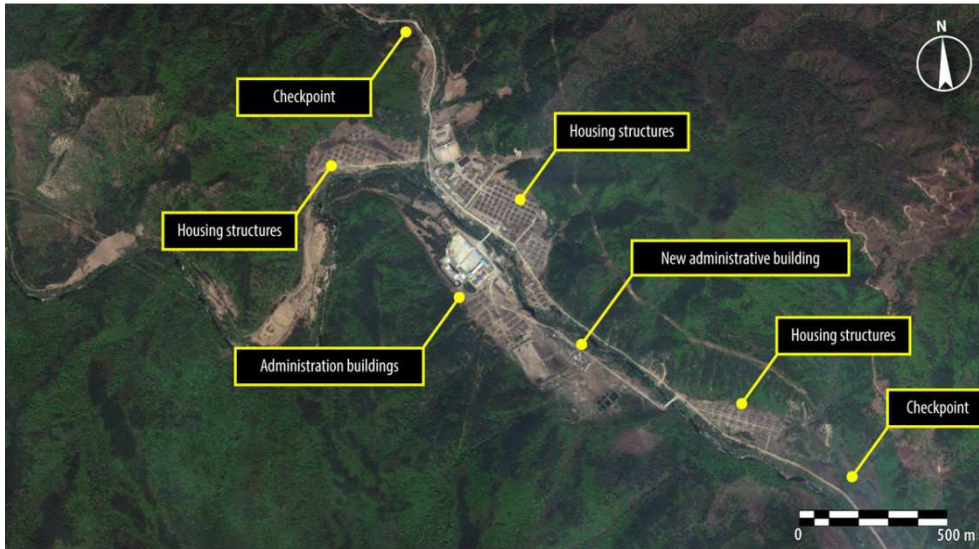
DigitalGlobe Natural Color Imagery, May 18, 2011 , 41.310814°, 129.346097°

The central (administrative) area of kwangiso 16 appears to have undergone the most change in the observation timeframe, including the razing and reconstruction of housing structures. In total, eight new housing structures were added in 2011 and 2012 (see bottom image), and a new administrative building was added in 2010 (see top image).