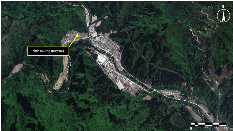
DigitalGlobe Natural Color Imagery, May 26, 2013 , 41.310814°, 129.346097°