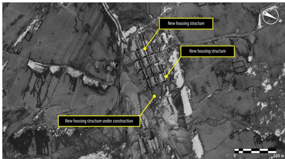
April 4, 2013, 41.385843°, 129.101535°