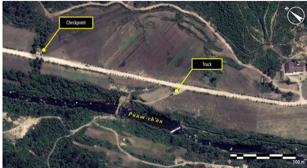
June 11, 2010, 41.301995°, 129.363418°

Movement also appears to be restricted within the camps. The image below, from June 2010, shows a checkpoint on the main road within kwanliso 16.