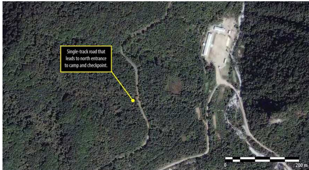
Natural Color Imagery, September 27, 2013, 39.839914°, 126.802832°