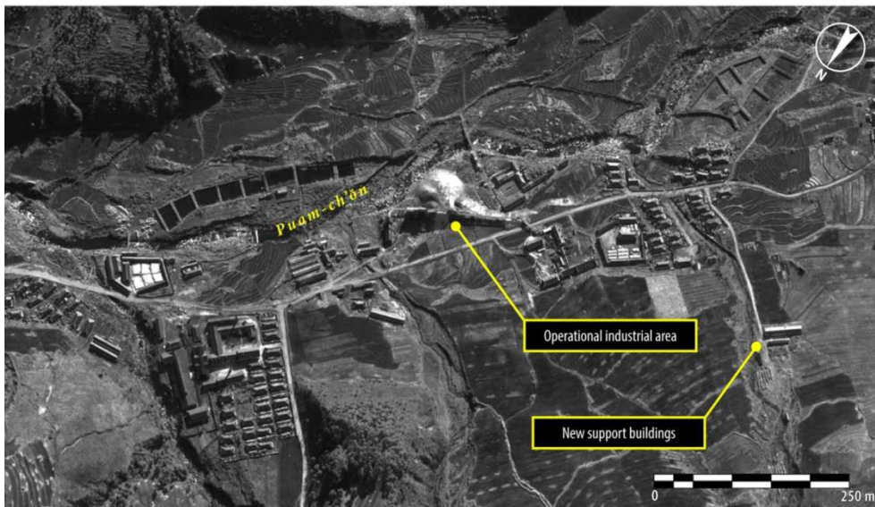
DigitalGlobe Panchromatic Imagery, November 18, 2012 , 41.261302°, 129.375145°