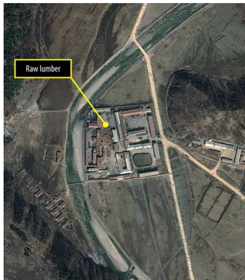
Natural Color Imagery, March 26, 2011, 39.689814°, 126.857436°

This satellite image time series from 2011 to 2013 shows a probable furniture factory within kwanliso 15 (Area 4 of overview image on page 14). The change in lumber piles is indicative of production activity.