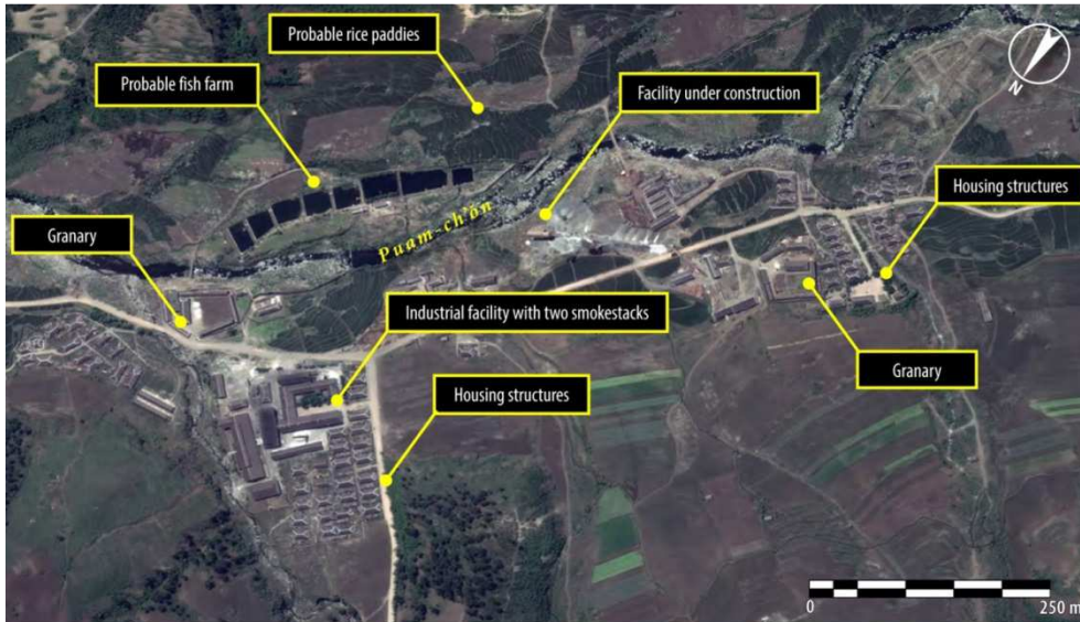
June 11, 2010, 41.261302°, 129.375145°

Satellite images further show investment in and maintenance of production facilities, focused on mining, agriculture and logging. A 2010 satellite image captures the construction of a new facility within kwanliso 16. In the image further below from November 2012, the industrial facility appears to be operational and new support buildings are visible.