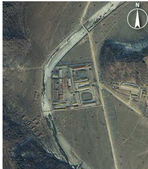
DigitalGlobe Natural Color Imagery, February 22, 2012 , 39.689814°, 126.857436°