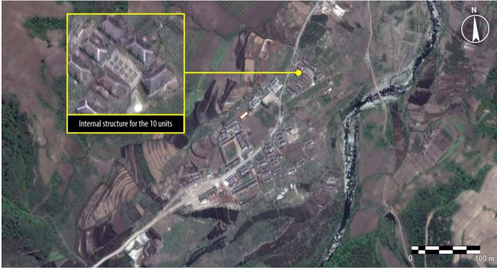
Natural Color Imagery, May 26, 2013, 41.254500°, 129.367523°

A recent image from kwaniso 16 close to the main entrance shows two more housing units under construction, showing ten 4 by 3.5 meter units in each building.