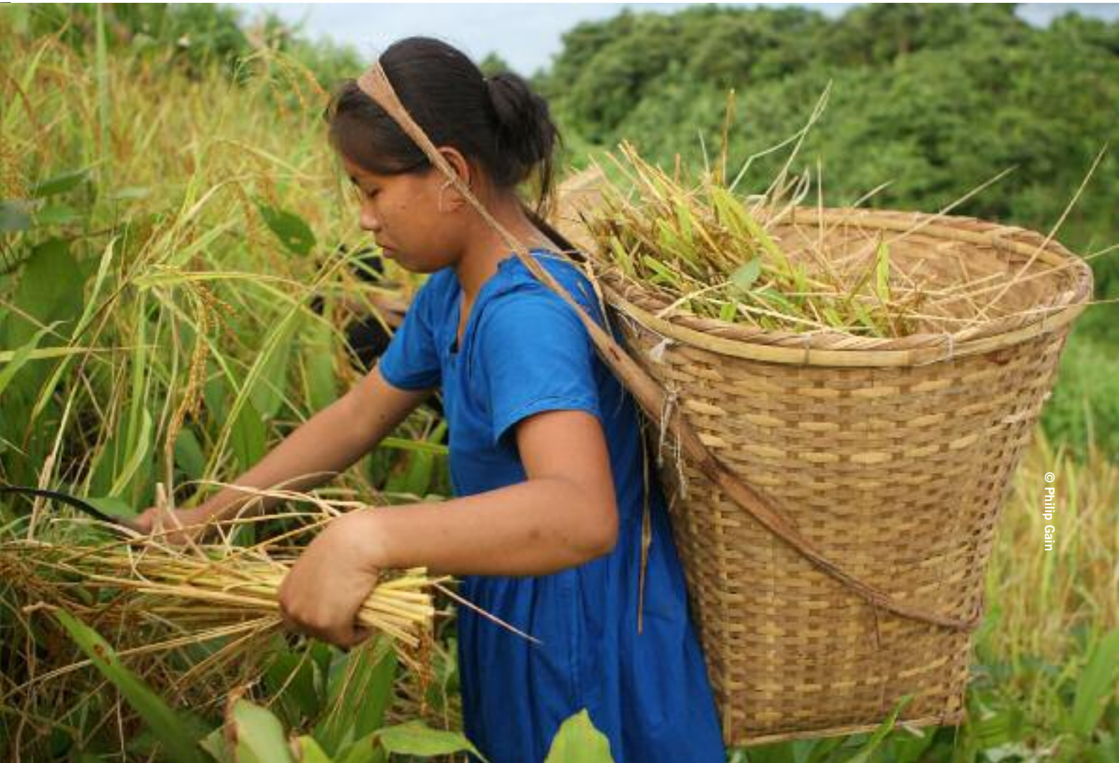
above: A woman engaged in traditional jum cultivation which Pahari rely on for their livelihoods, Rangamati district.