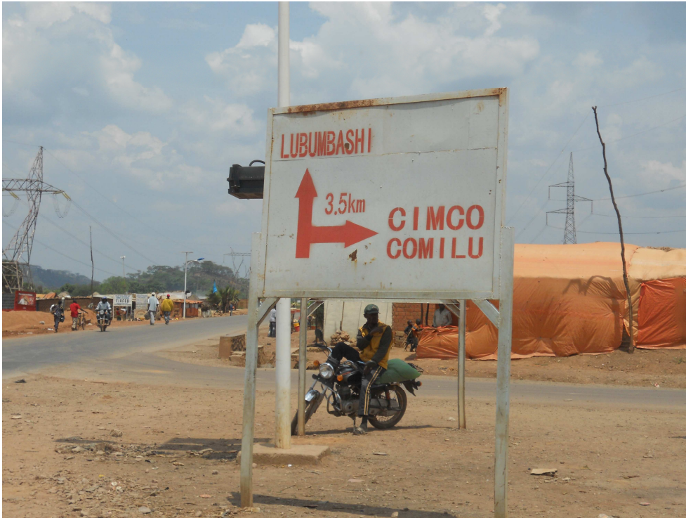
A signpost on the road to Luisha, where the companies Compagnie Minière de Luisha (COMILU) and Congo International Mining Corporation (CIMCO) have operations.