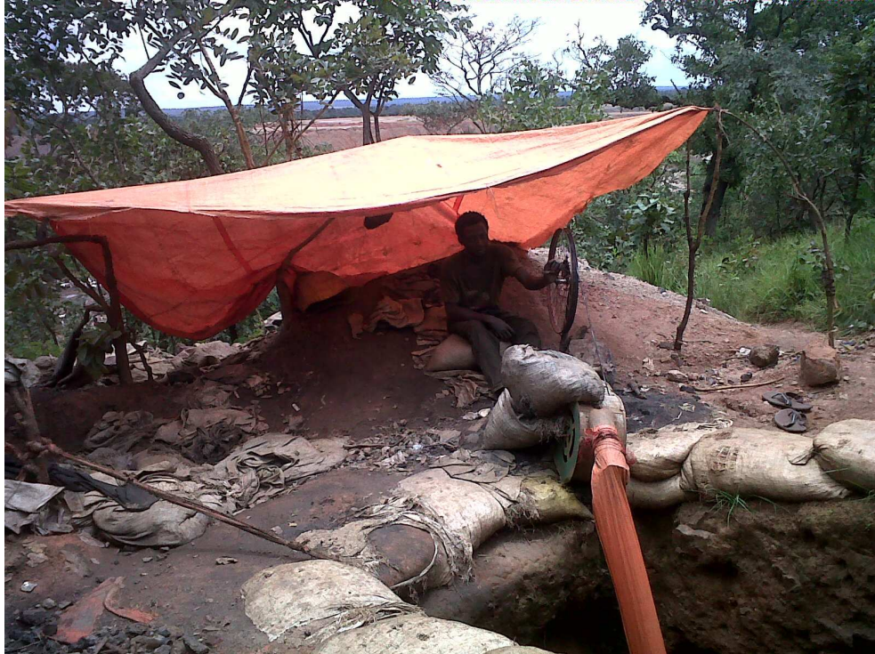
Improvised ventilation for a mine shaft at the Tilwezembe mine site, near Kolwezi, February 2012