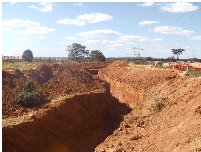
The trench in Luisha dug by Compagnie Minière de Luisha (COMILU), 20 April 2012

Confronted by the trench, local people initially tried to breach it with spades and shovels to create a passage for pedestrians and motorbikes. The police intervened and – according to local reports - fired live ammunition into the air to disperse the angry crowd, killing a 25-year old man, Jean Isuzu, a subsistence farmer who was hit in the head by a stray bullet. 114