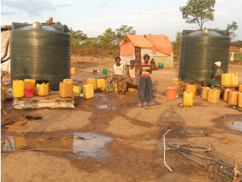
Members of the community that was forcibly evicted from their homes in Luisha in August 2011. The photo was taken in October 2011 at the new site where they were taken following the evictions.