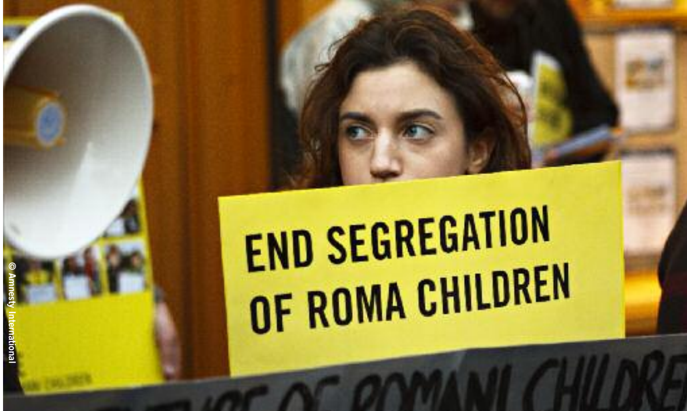
Demonstration in front of the Slovak embassy in London, UK, to end segregation of Romani children, 2010.