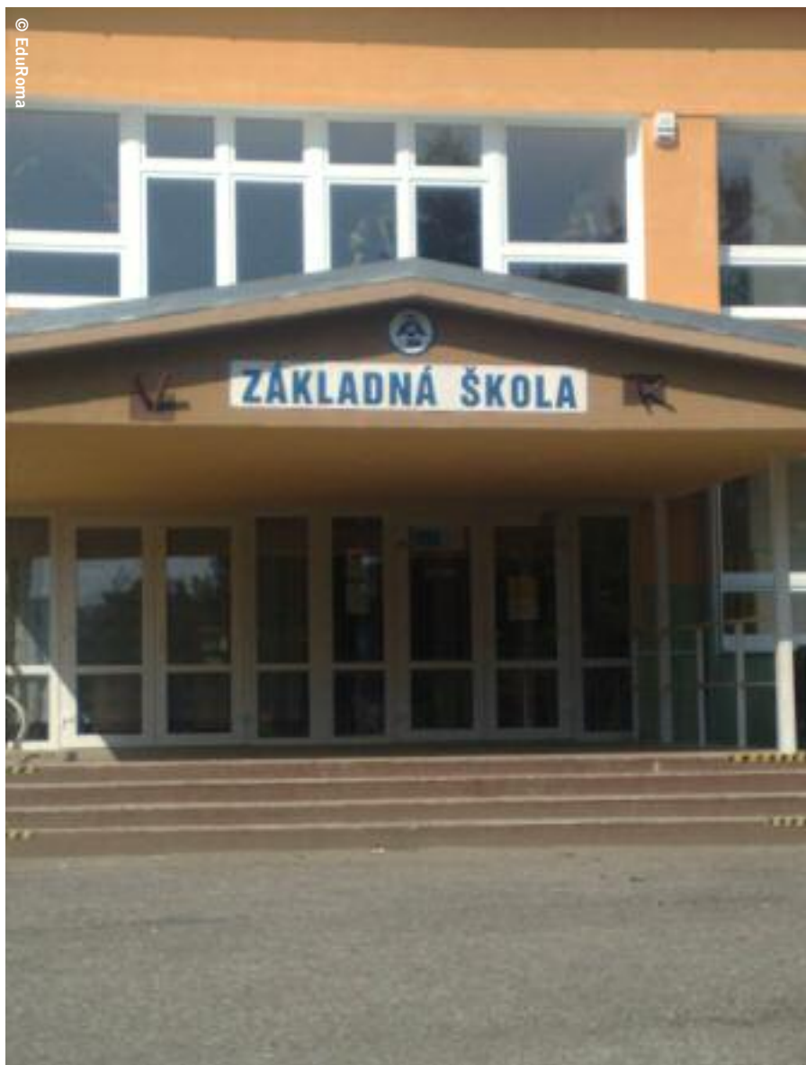
Outside the elementary school in Šarišské Michaľany, eastern Slovakia, 2013.

Using the provisions of the Anti-discrimination Act, the Centre for Civil and Human Rights, a Slovak NGO, initiated a complaint against the school to the District Court in June 2010. The Centre argued that placing Romani children in separate classes was discriminatory and violated their right to equal access to education.