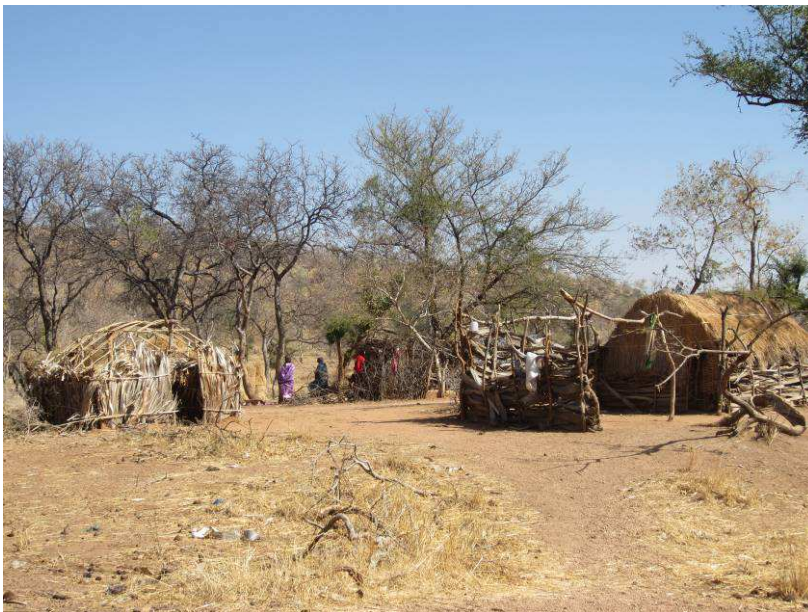
IDP settlement in Sanjak, January 2013