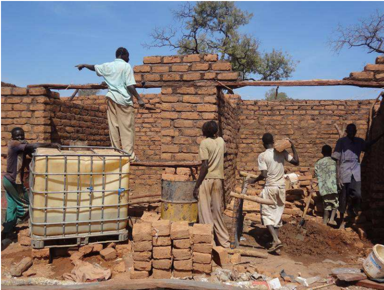
Construction in Yida's market by the refugee population, January 2013

In addition to expressing their fears about the location of the three sites as a result of their proximity, some of the refugees emphasised that they are well settled at Yida and had worked hard to establish themselves at the camp. They were concerned that a move to a new site means starting their lives again.