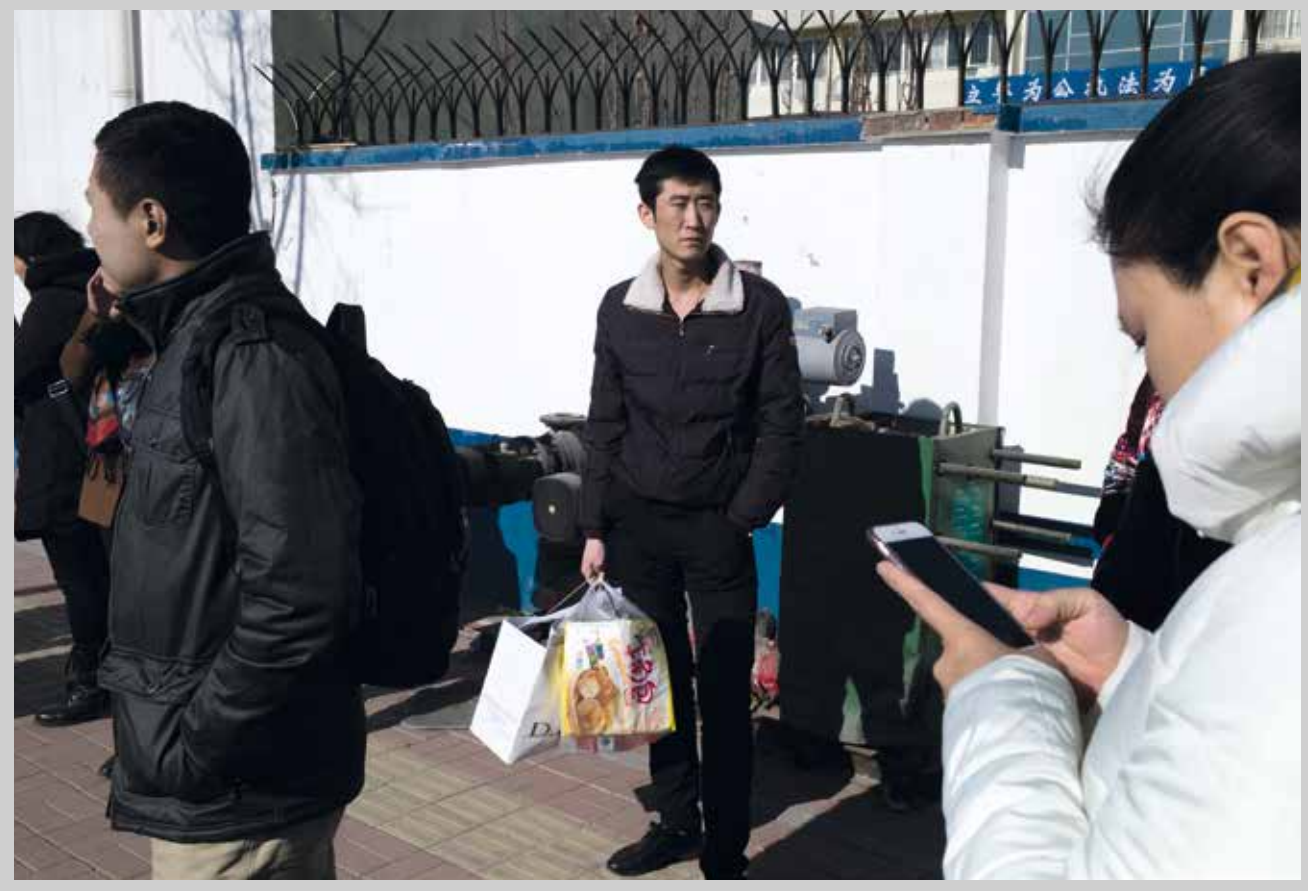
Family members and legal representatives of detained lawyers gather after an attempt to seek answers at a detention centre on January 8, 2016.